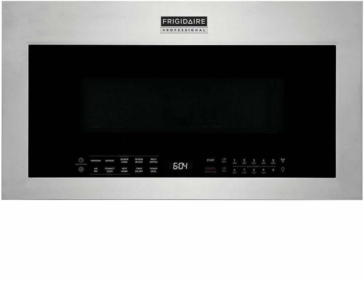
Front view of the Frigidaire Professional Over-The-Range Microwave, showcasing its sleek stainless steel design.