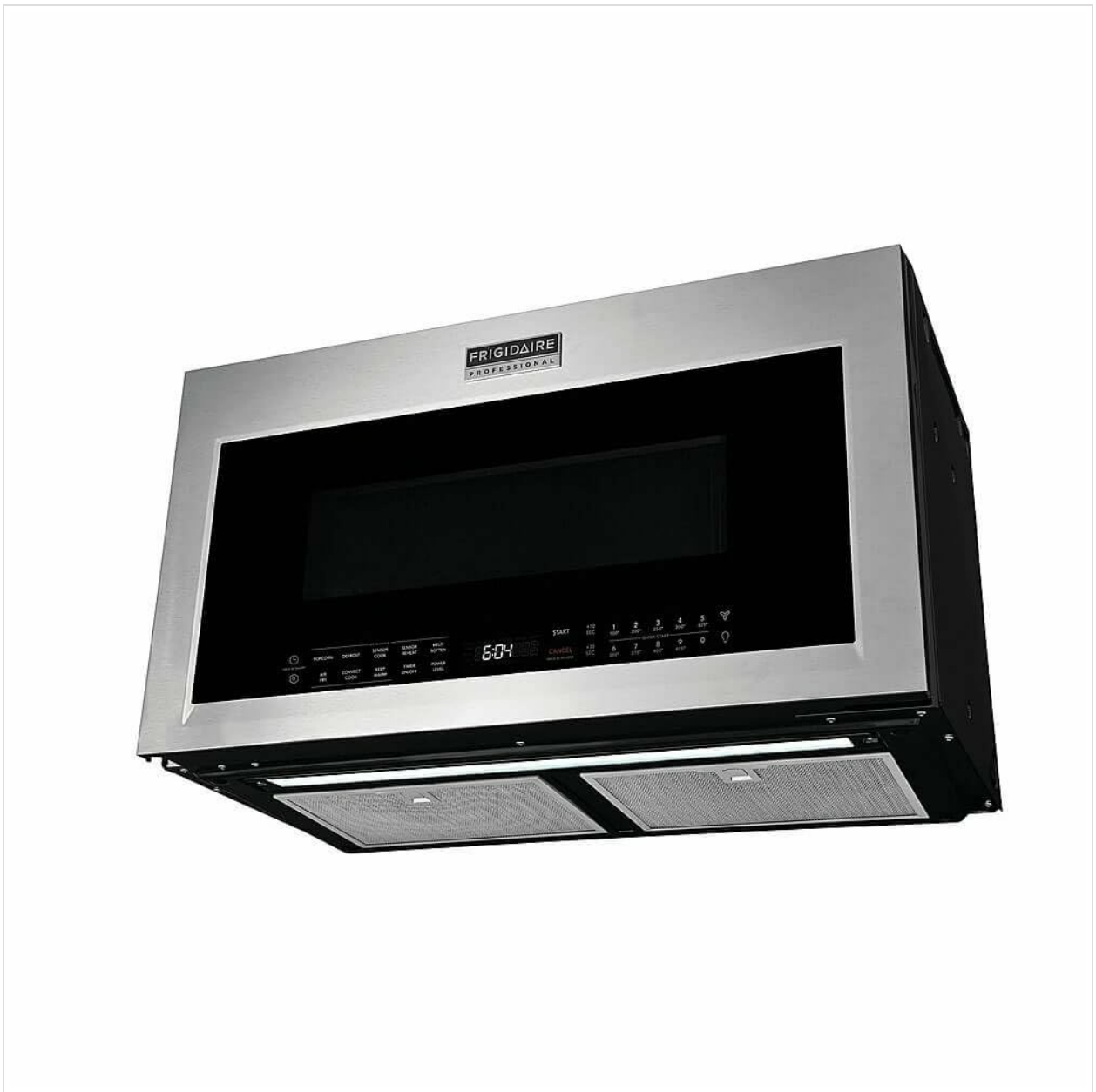
Angled view of the microwave, showing the powerful integrated vent system beneath the unit.