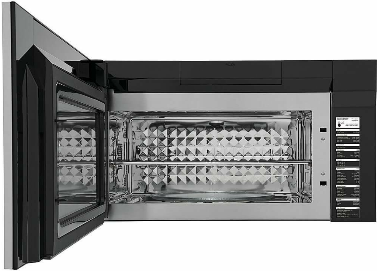
Spacious interior of the microwave with the door open, revealing the turntable and ample cooking space.