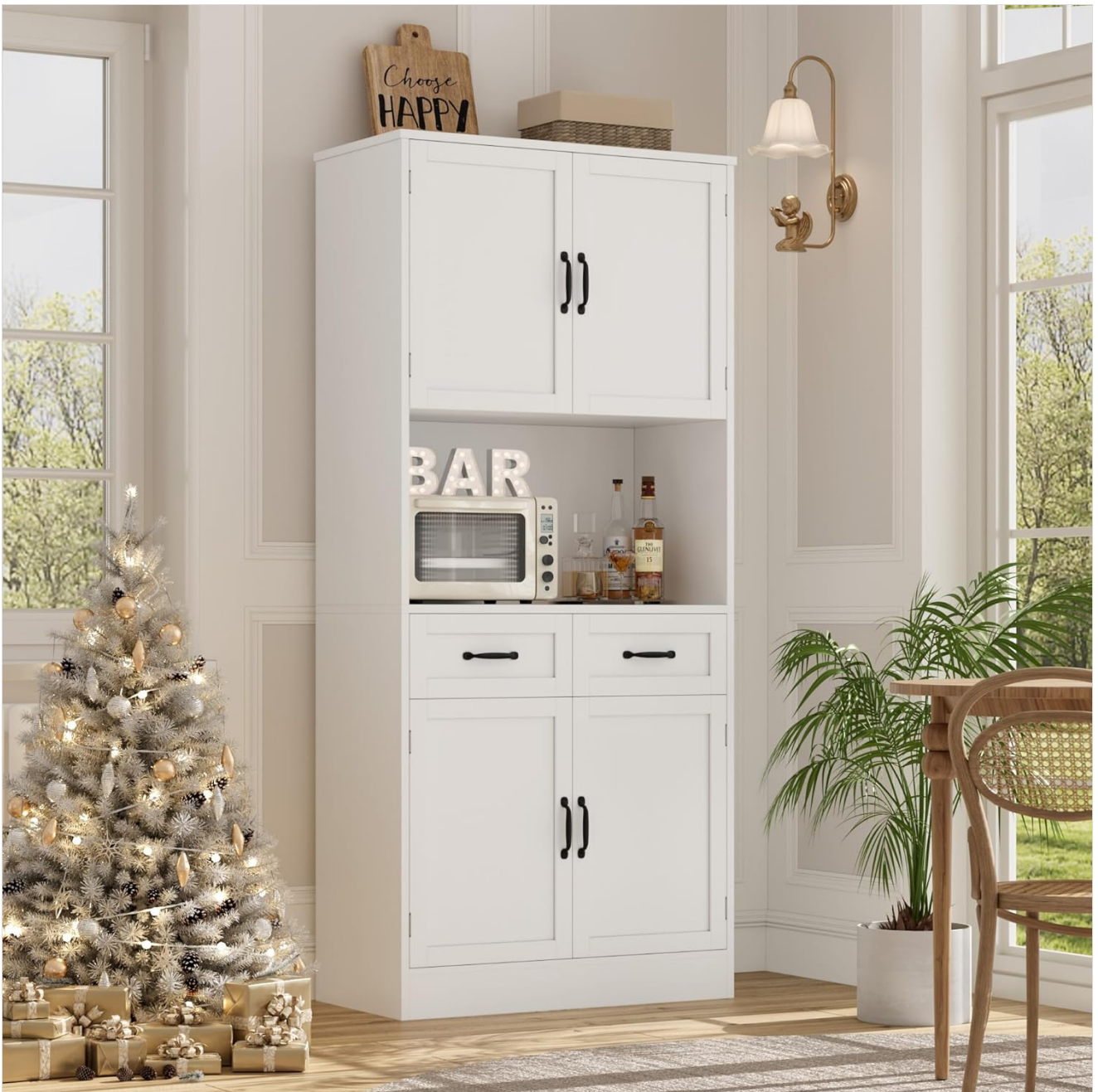
Figure 4.2: Cabinet in Dining Room Setting

This photograph shows the white HOSTACK cabinet positioned in a dining room, adorned with seasonal decorations. It highlights the cabinet's ability to blend seamlessly with contemporary home aesthetics and serve as a functional yet decorative piece of furniture.