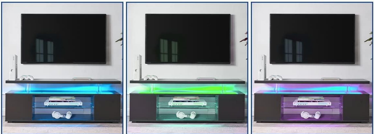
Figure 6.1: The 16-color LED light system with remote control.