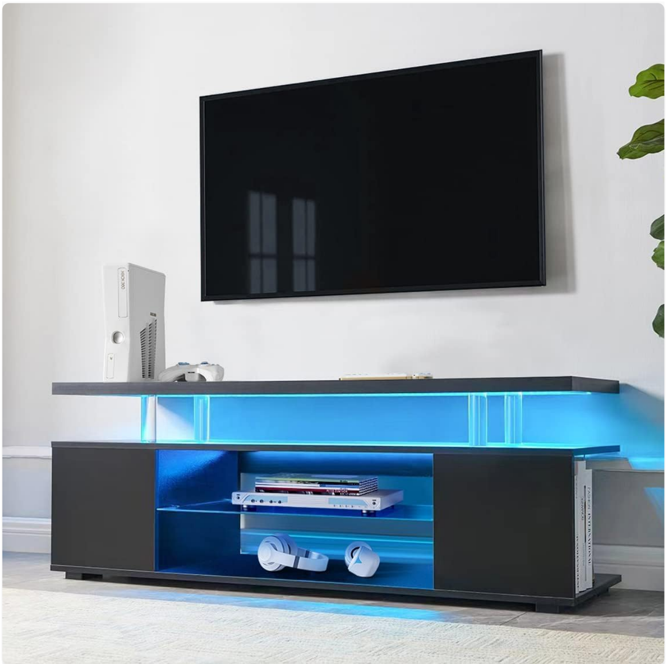
Figure 4.2: The TV stand accommodating a television and various media devices.