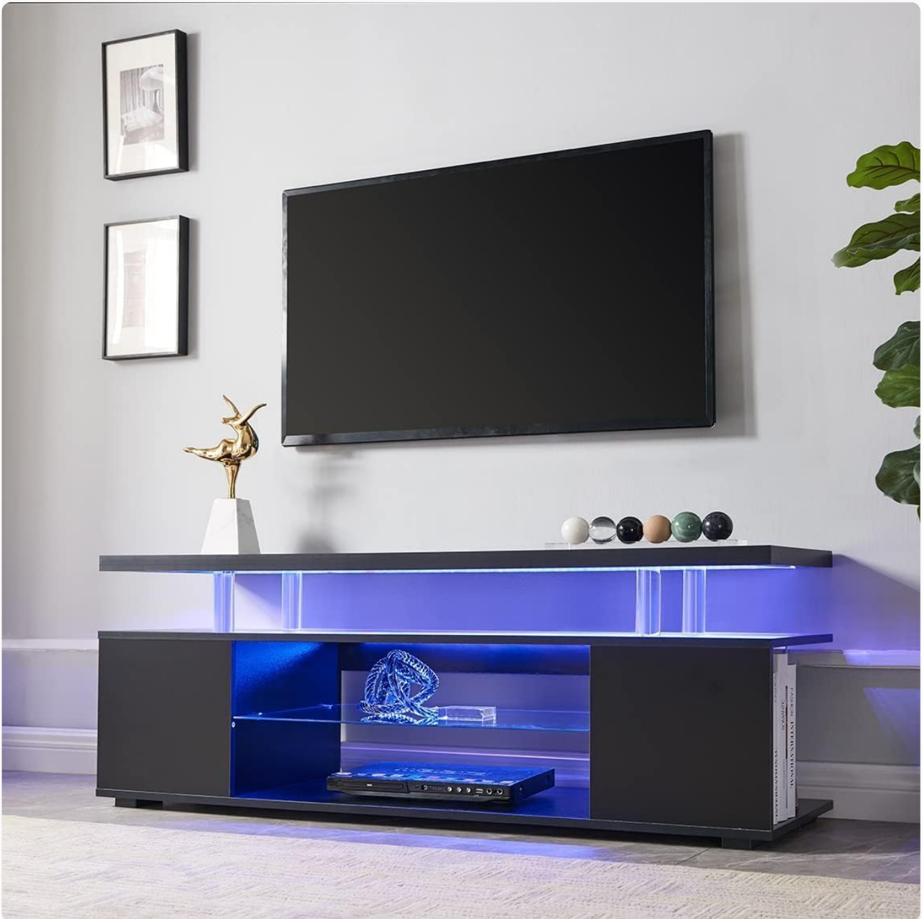
Figure 4.1: Fully assembled Bellemave LED TV Stand with integrated blue LED lighting.