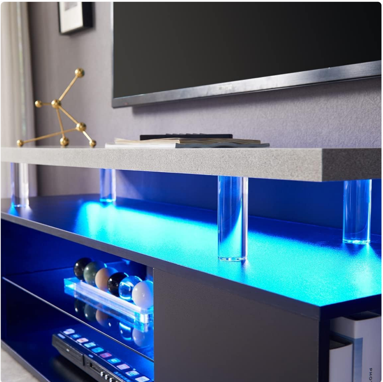
Figure 6.3: Detailed view of the LED light strip and its integration.