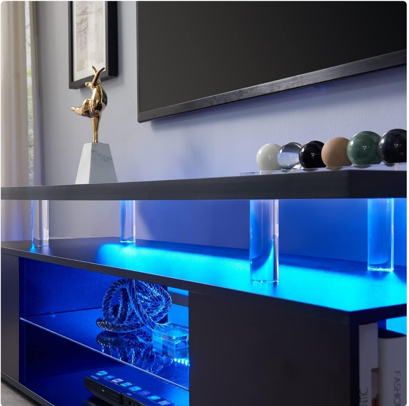
Figure 6.2: Close-up of the LED lighting and acrylic lamp posts.