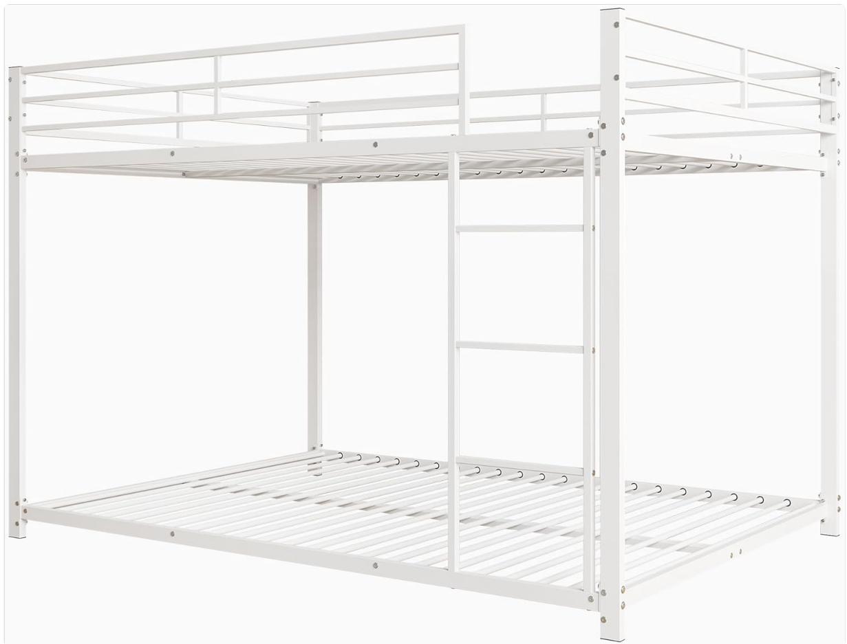
Figure 2: Fully assembled Moimhear Metal Bunk Bed frame, showcasing its structure.