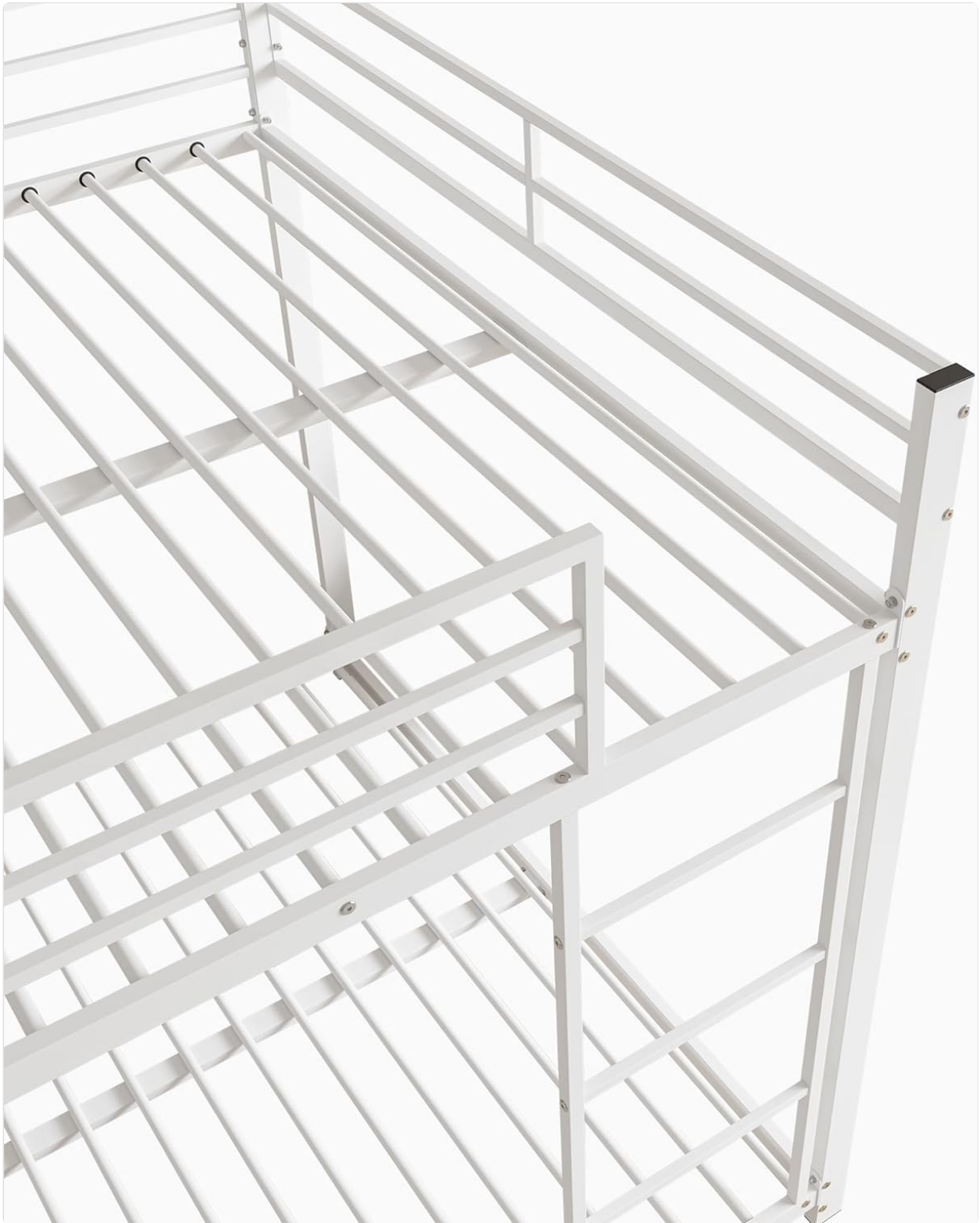
Figure 4: Detail of the upper bunk's safety rail, highlighting its height and protective design.