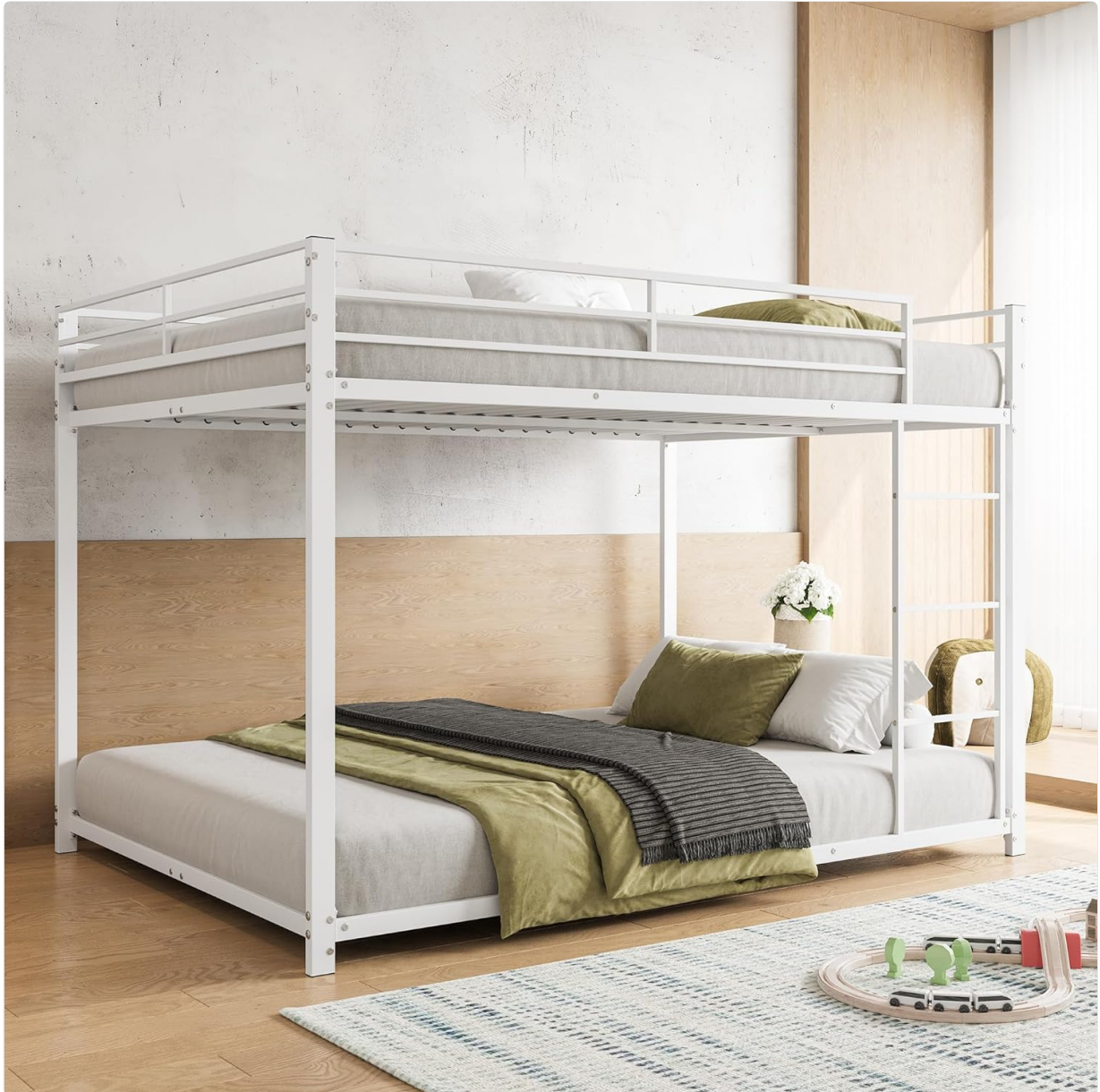
Figure 3: The Moimhear Metal Bunk Bed in a typical room setup, demonstrating its functional use.