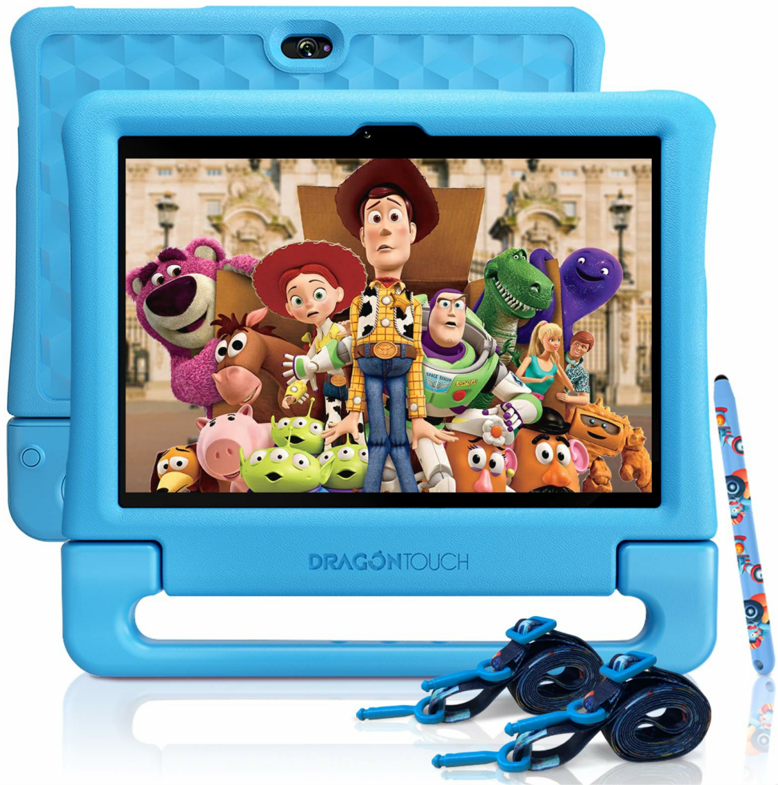
Image: The Dragon Touch KidzPad Y88X 10 Kids Tablet shown with its protective case, stylus, and shoulder strap, alongside the power adapter and USB cable.