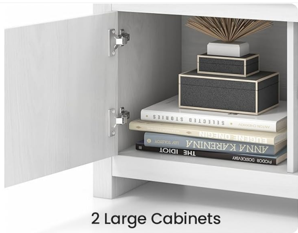
2 Large Cabinets