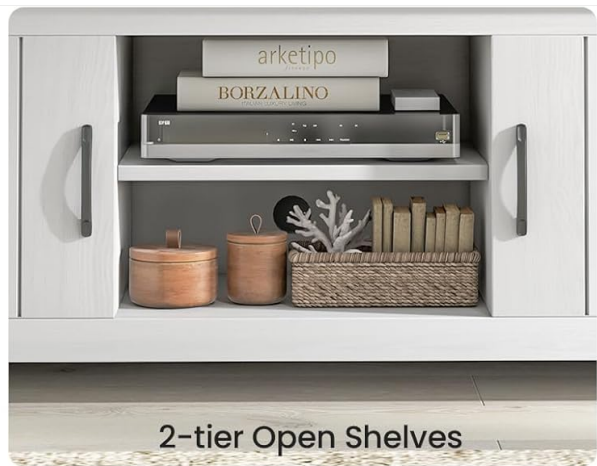
2-tier Open Shelves