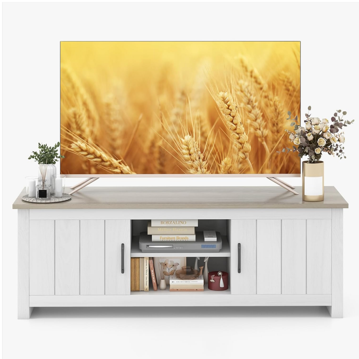
Image 1.1: KOMFOTTEU TV Stand (Model QE09313KWDE) in a living room setting.