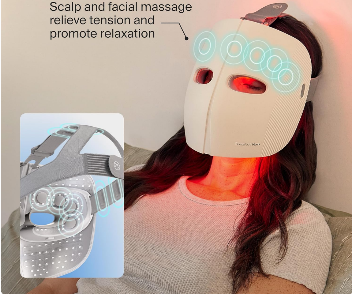
Image: A woman wearing the TheraFace Mask, with visual indicators highlighting the gentle vibration therapy targeting the scalp and facial pressure points for relaxation.

Scalp and facial massage relieve tension and promote relaxation