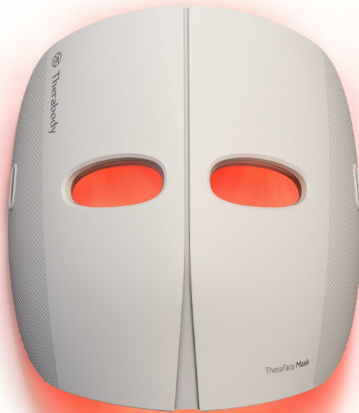
Image: The TheraFace Mask in its charging stand, highlighting its modern aesthetic.