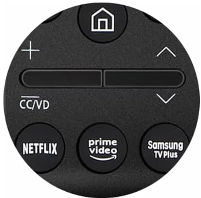
Image 1: Front view of the Smartby Universal Voice Remote Control. The remote is black with a sleek design, featuring a circular directional pad, dedicated buttons for streaming services, and a voice control button.