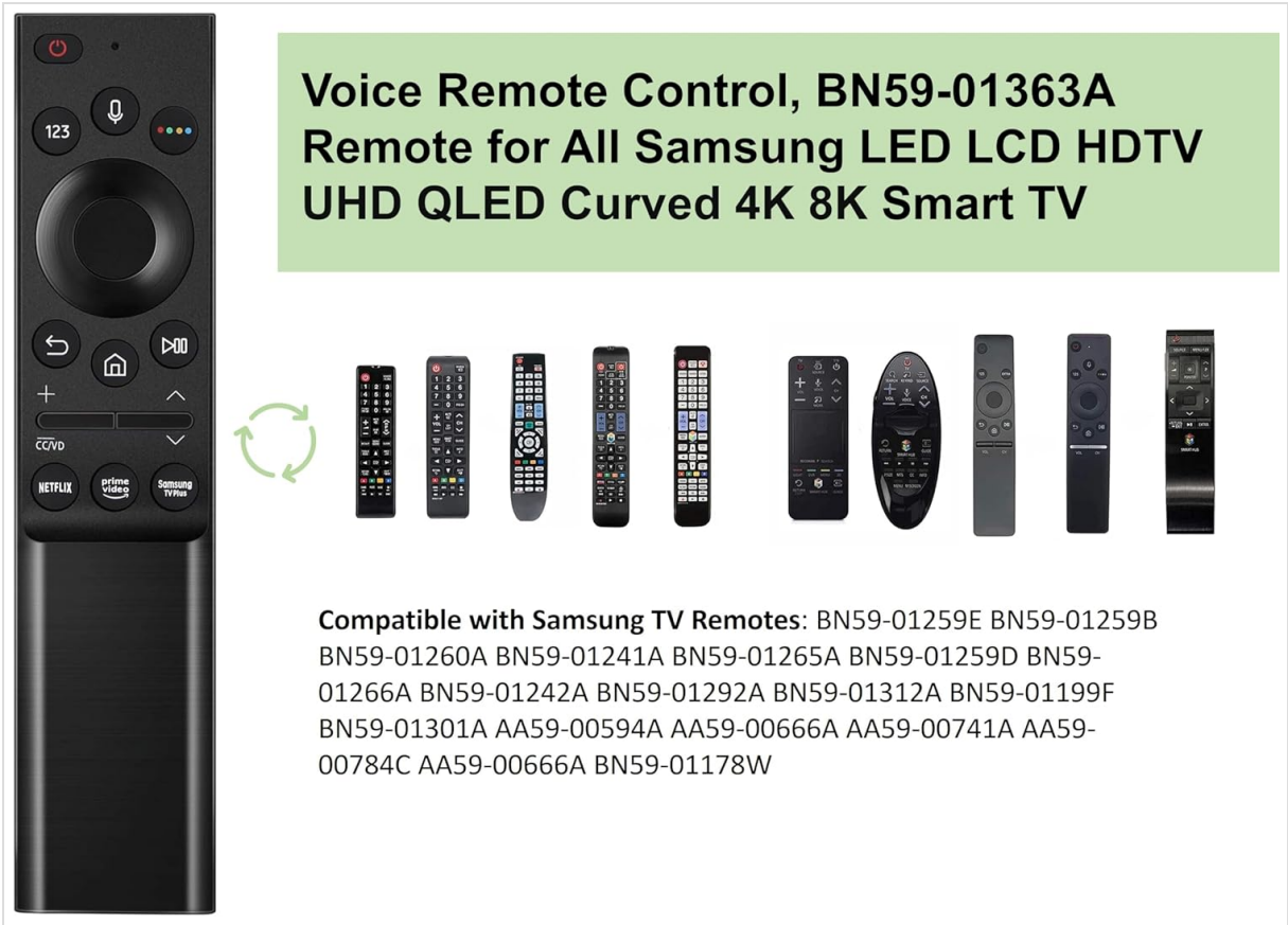
Image 5: A visual representation of various Samsung remote control models, indicating the broad compatibility of the Smartby BN59-01363A remote.

This remote is compatible with a wide range of Samsung TV remote control models, including but not limited to: BN59-01259E, BN59-01259B, BN59-01260A, BN59-01241A, BN59-01265A, BN59-01259D, BN59-01266A, BN59-01242A, BN59-01292A, BN59-01312A, BN59-01199F, BN59-01301A, AA59-00594A, AA59-00666A, AA59-00741A, AA59-00784C, AA59-00666A, BN59-01178W.