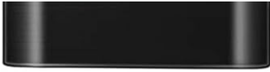
Image 4: The remote control with the voice control button highlighted. This button activates the microphone for voice commands.