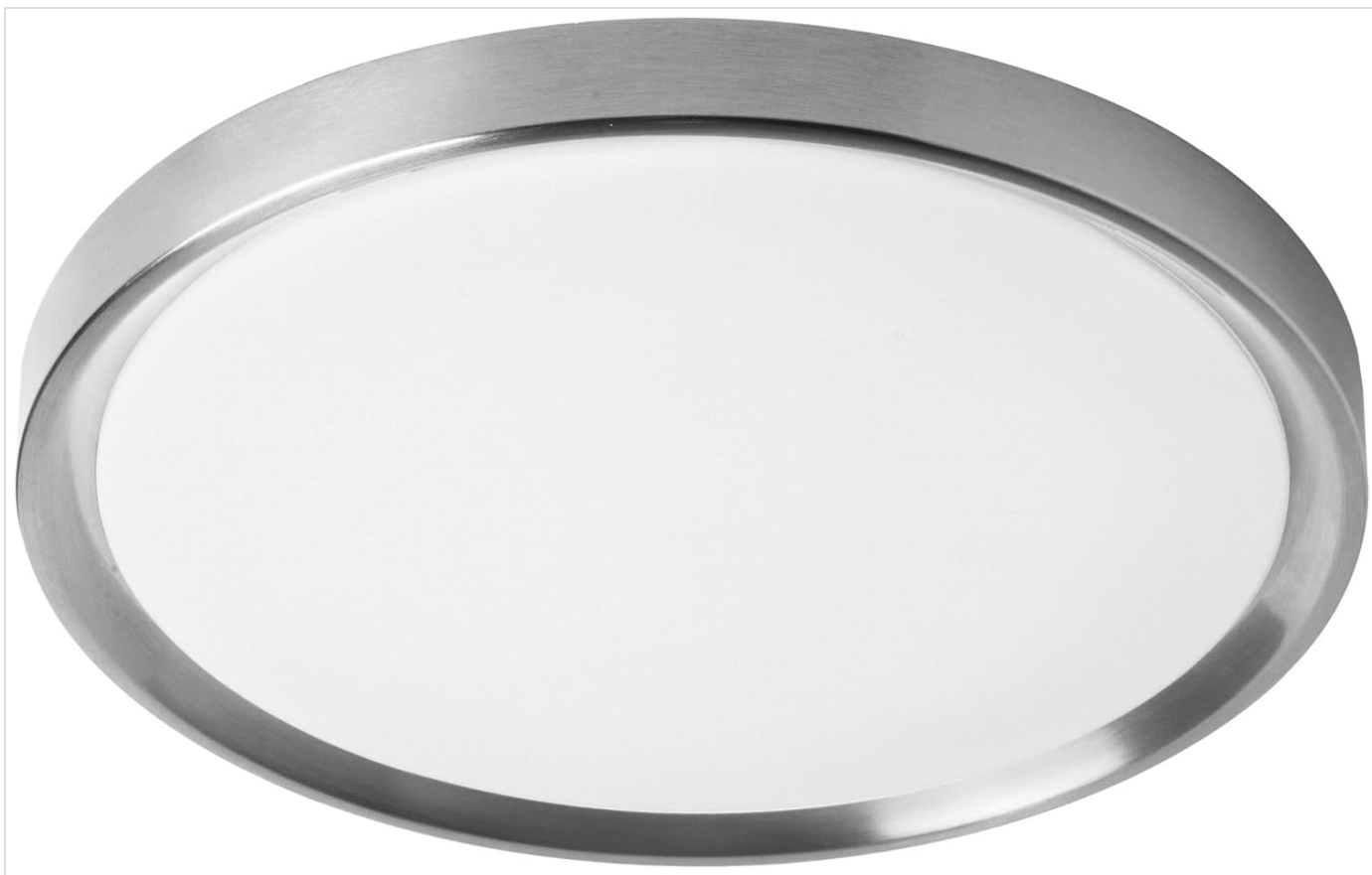
Figure 1: Dainolite FID-1630LED FH Frida Flush Mount Light in Satin Chrome finish. This image shows the complete light fixture with its circular design and white acrylic diffuser.