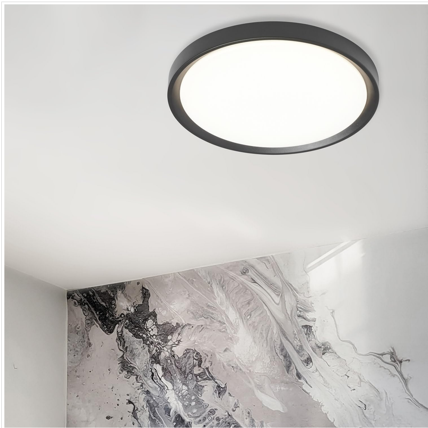
Figure 3: Another view of the Dainolite Frida Flush Mount Light installed, showcasing its integration into a contemporary interior design with a decorative wall.