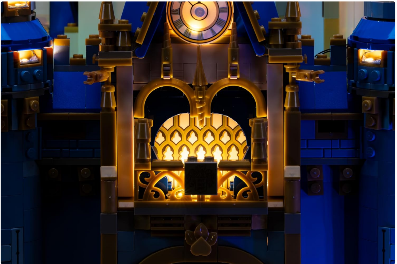
A detailed view of the castle's entrance, showcasing the warm glow provided by the lighting kit.