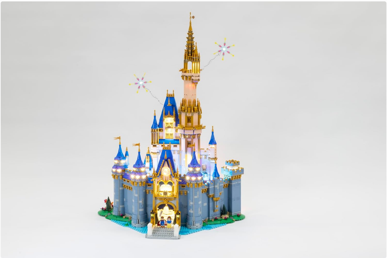
The illuminated Disney Castle 43222 model, showcasing the overall effect of the lighting kit.