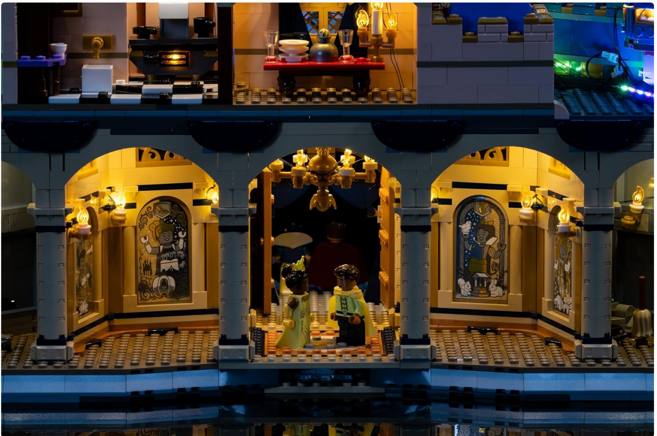
The interior of the castle, with lights enhancing the details of the rooms and figures.