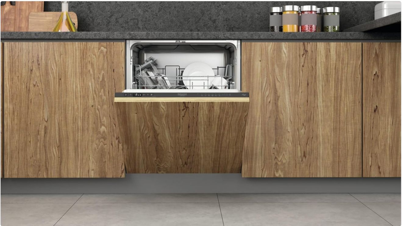
Image: The dishwasher with its door open, revealing the upper and lower baskets fully loaded with various dishes, glasses, and cutlery, demonstrating proper loading technique.