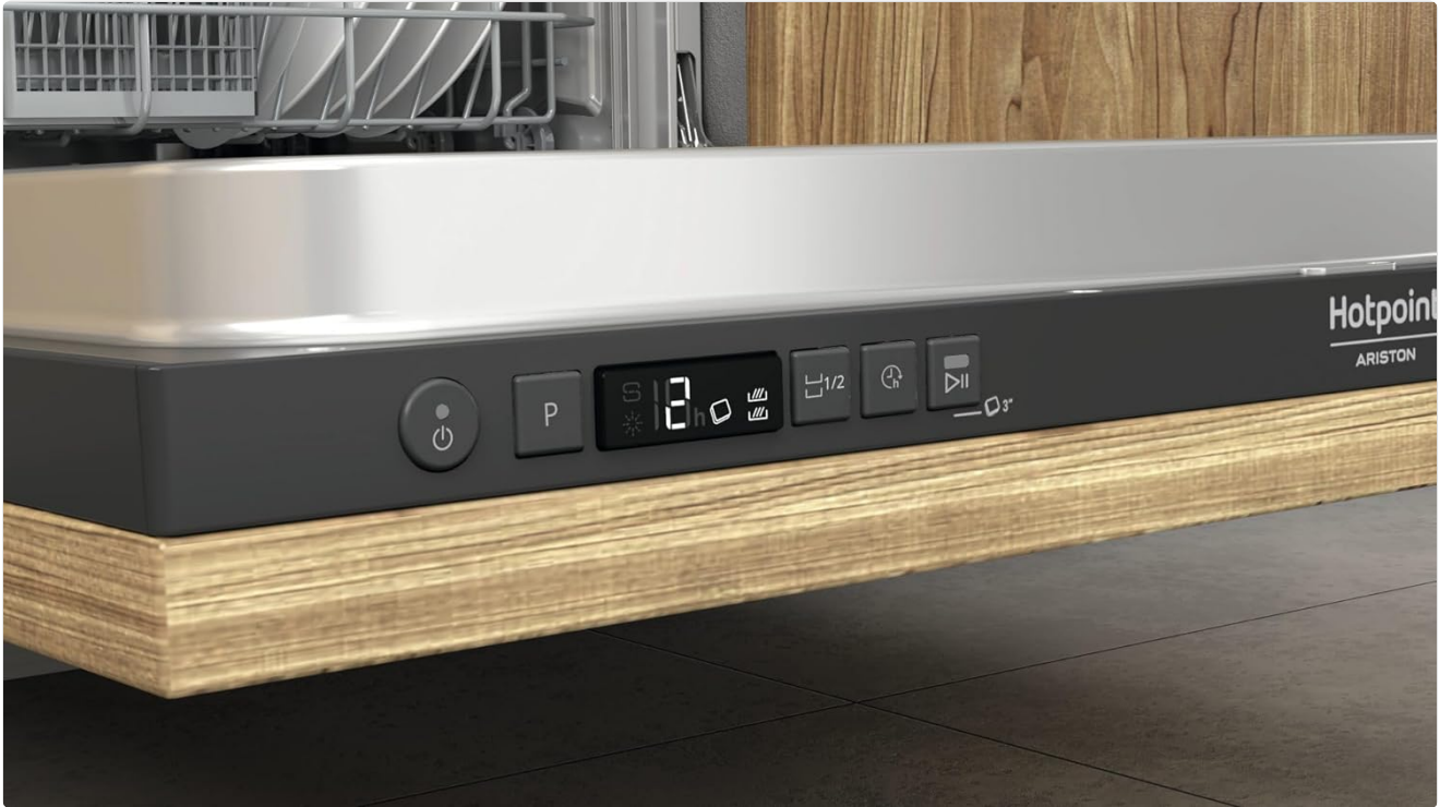
Image: A detailed view of the dishwasher's control panel, showing the power button, program selection button, digital display, delay start, and half-load options.

The control panel features buttons for power, program selection, delay start, half load, and a digital display. The display shows program status and remaining time.