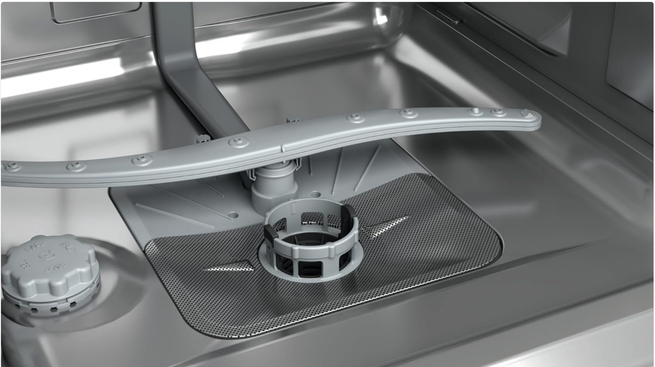
Image: A close-up of the dishwasher's interior base, highlighting the filter assembly and the lower spray arm. Regular cleaning of these components is essential.