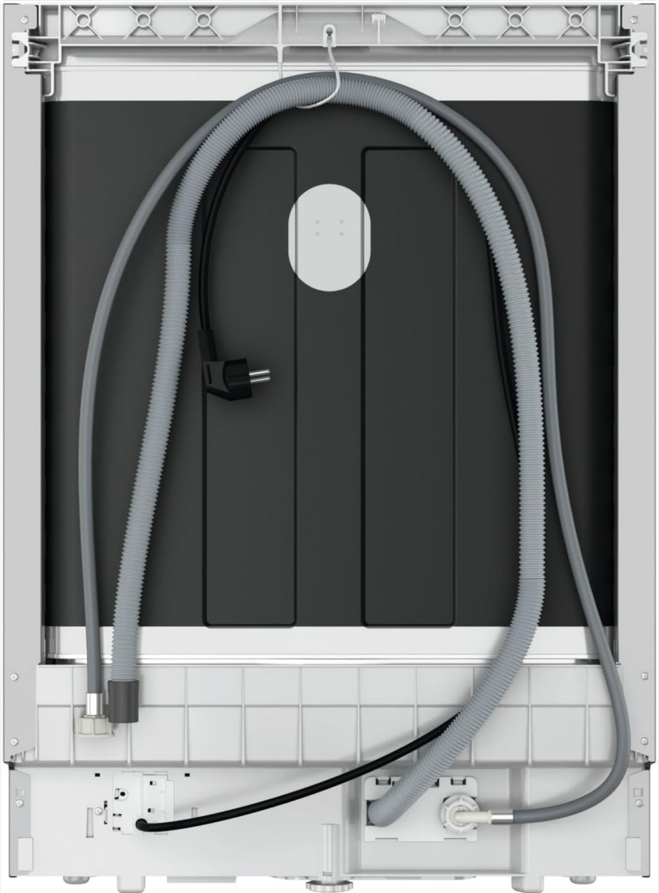
Image: Rear view of the dishwasher, illustrating the water inlet hose, drain hose, and electrical power cable connections. Ensure these are securely attached during installation.