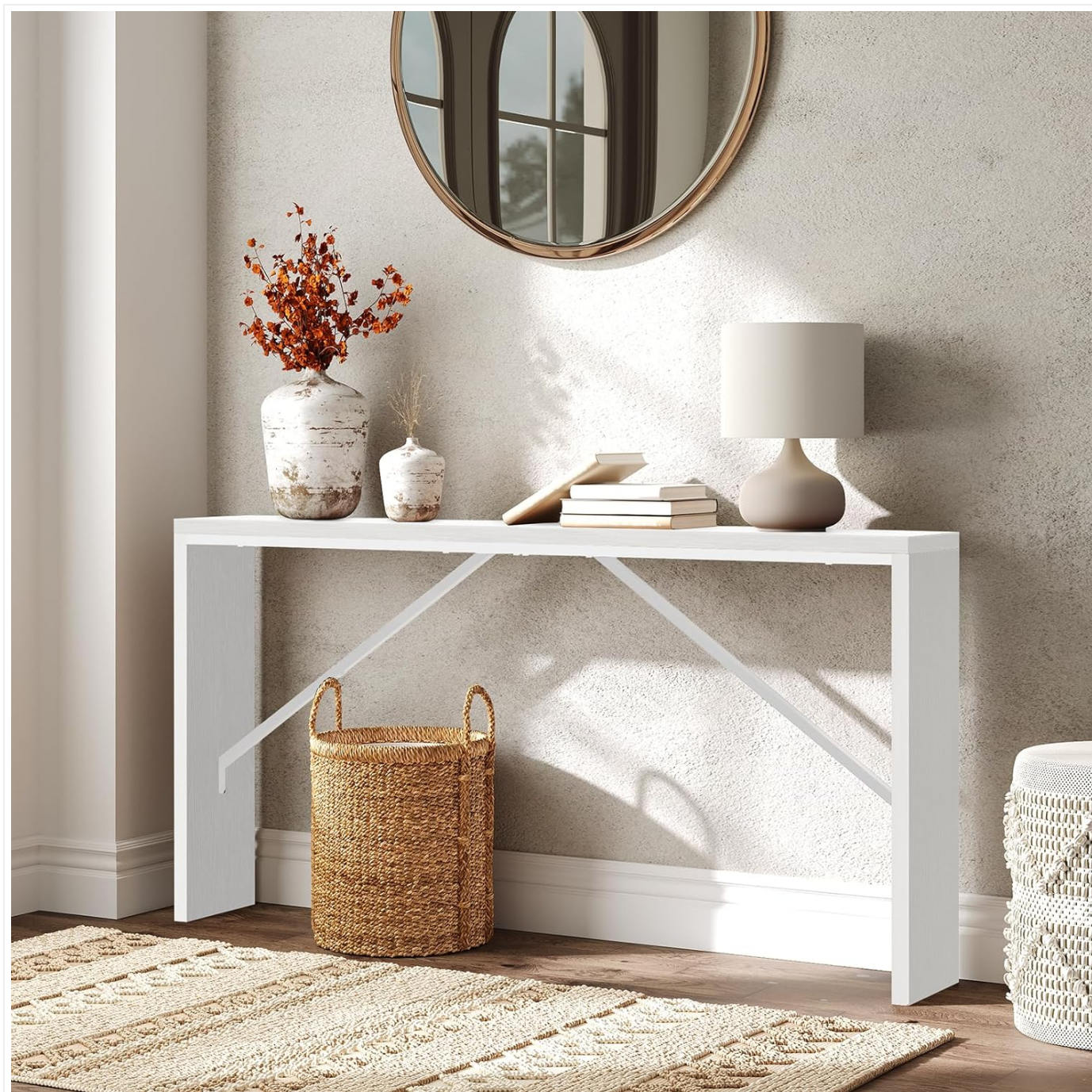
Figure 5: Console Table used in an entryway