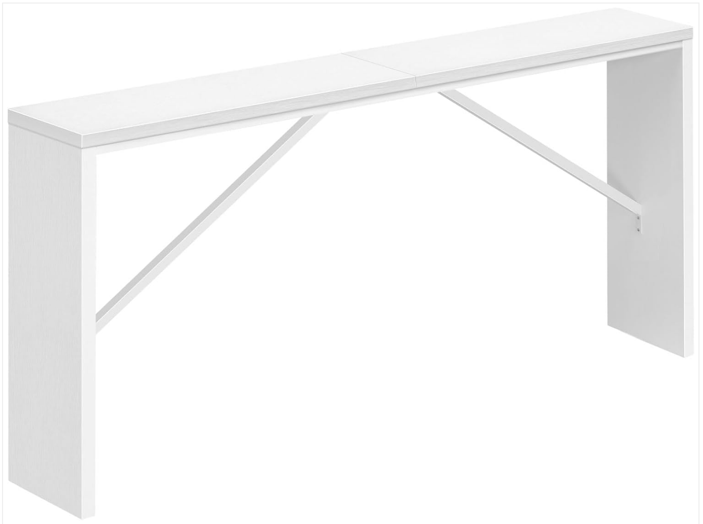
Figure 1: MAHANCRIS Console Table (White)