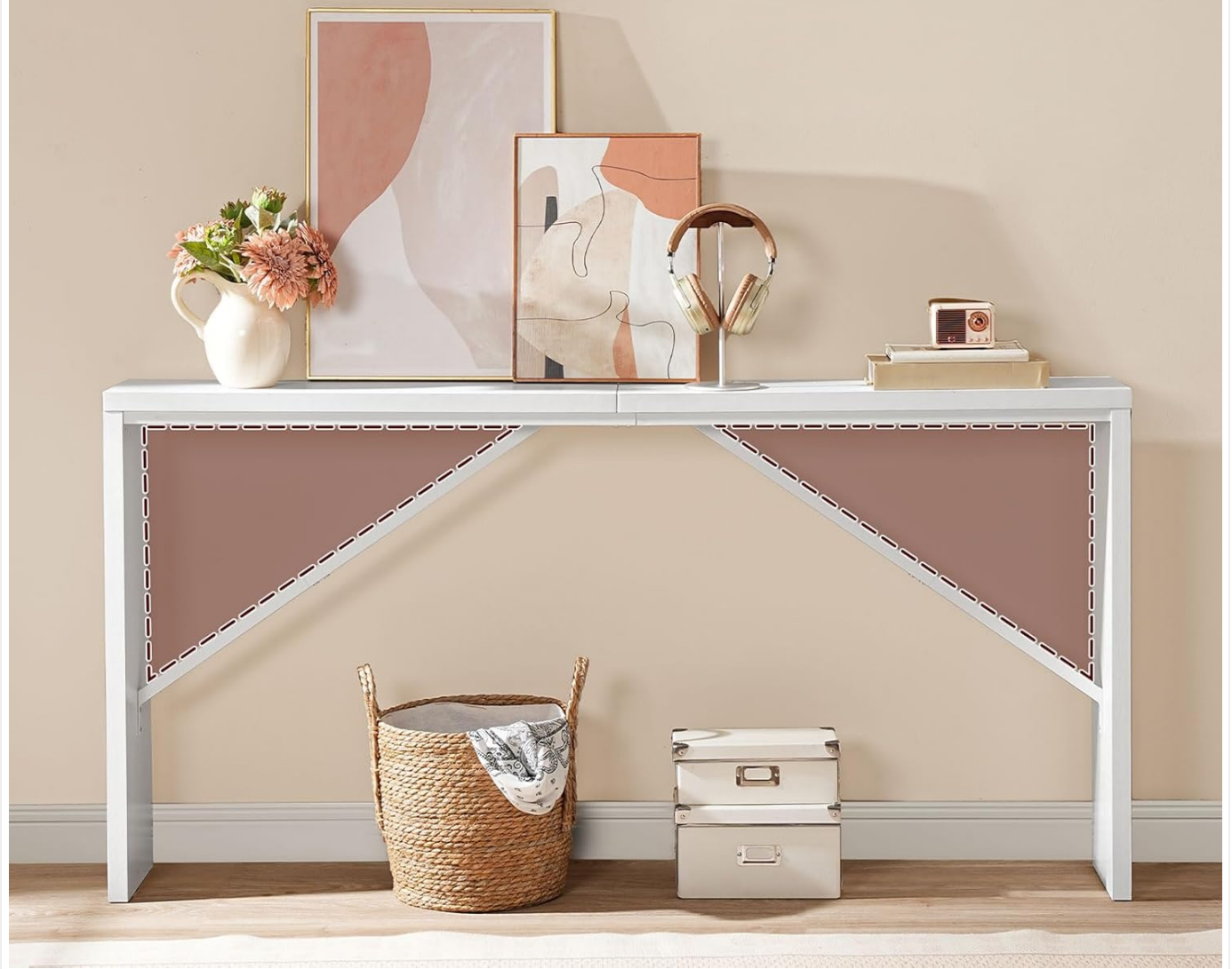
Figure 3: Illustration of the Herringbone Iron Support

The herringbone iron support effectively helps stability without sacrificing basket storage below and can bear up to 120 pounds.