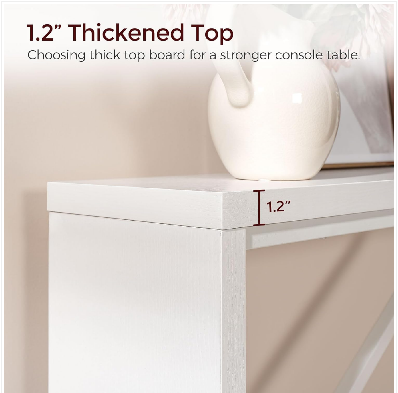
Figure 6: Detail of the 1.2" Thickened Top

Choosing thick top board for a stronger console table.