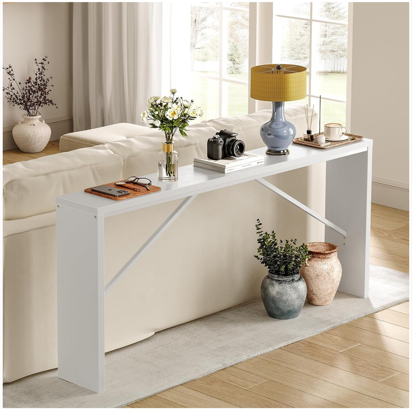
Figure 4: Console Table used behind a couch