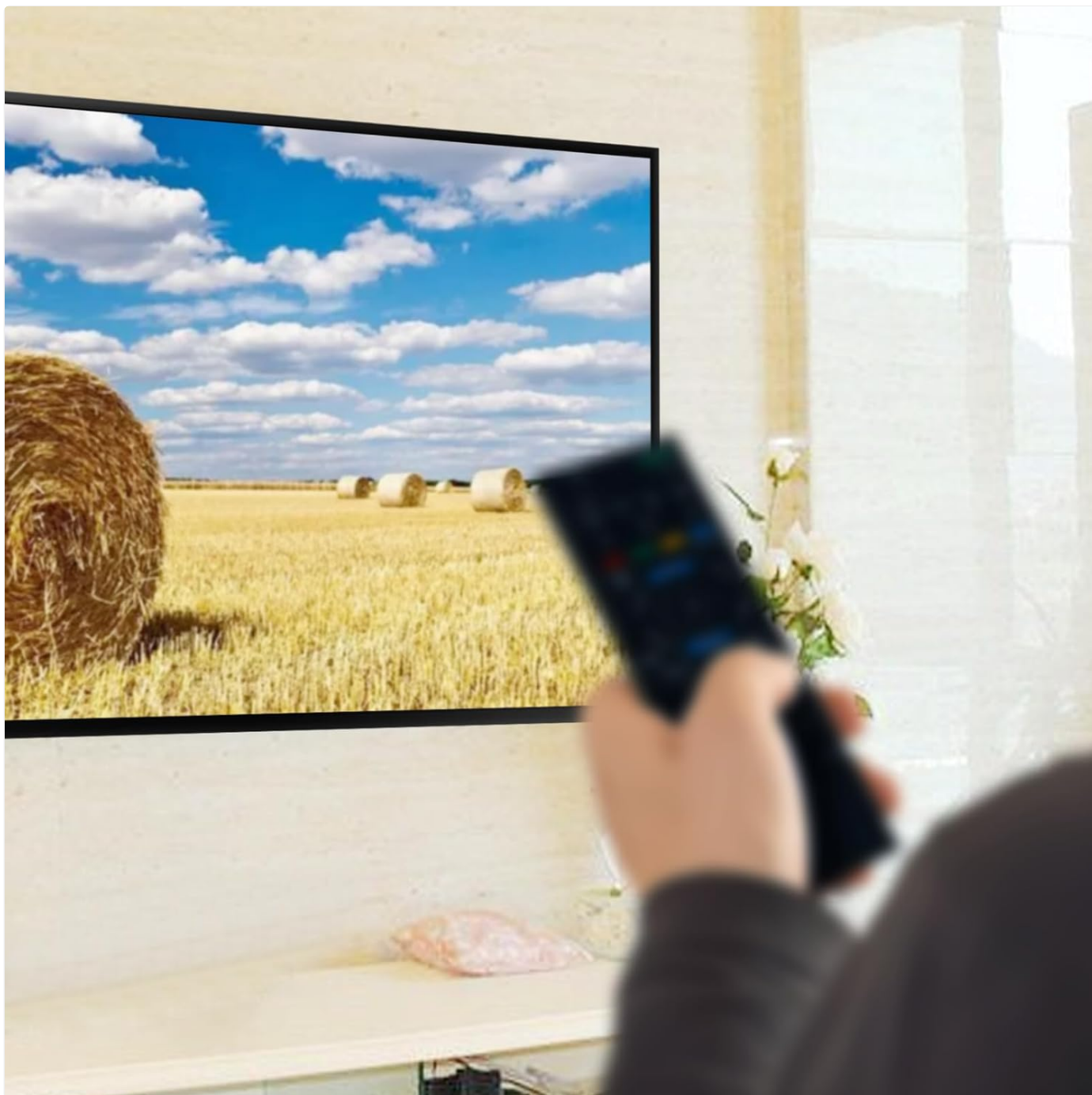
Figure 4.1: Remote control in use. This image shows a user operating the remote control, demonstrating the typical distance and angle for effective signal transmission.