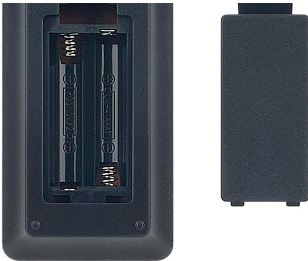
Figure 3.1: Back view of the remote control with the battery compartment open. This image illustrates the correct orientation for inserting two AAA batteries.

Note: Batteries are not included with the remote control. Always use new alkaline batteries for optimal performance. Do not mix old and new batteries, or different types of batteries.