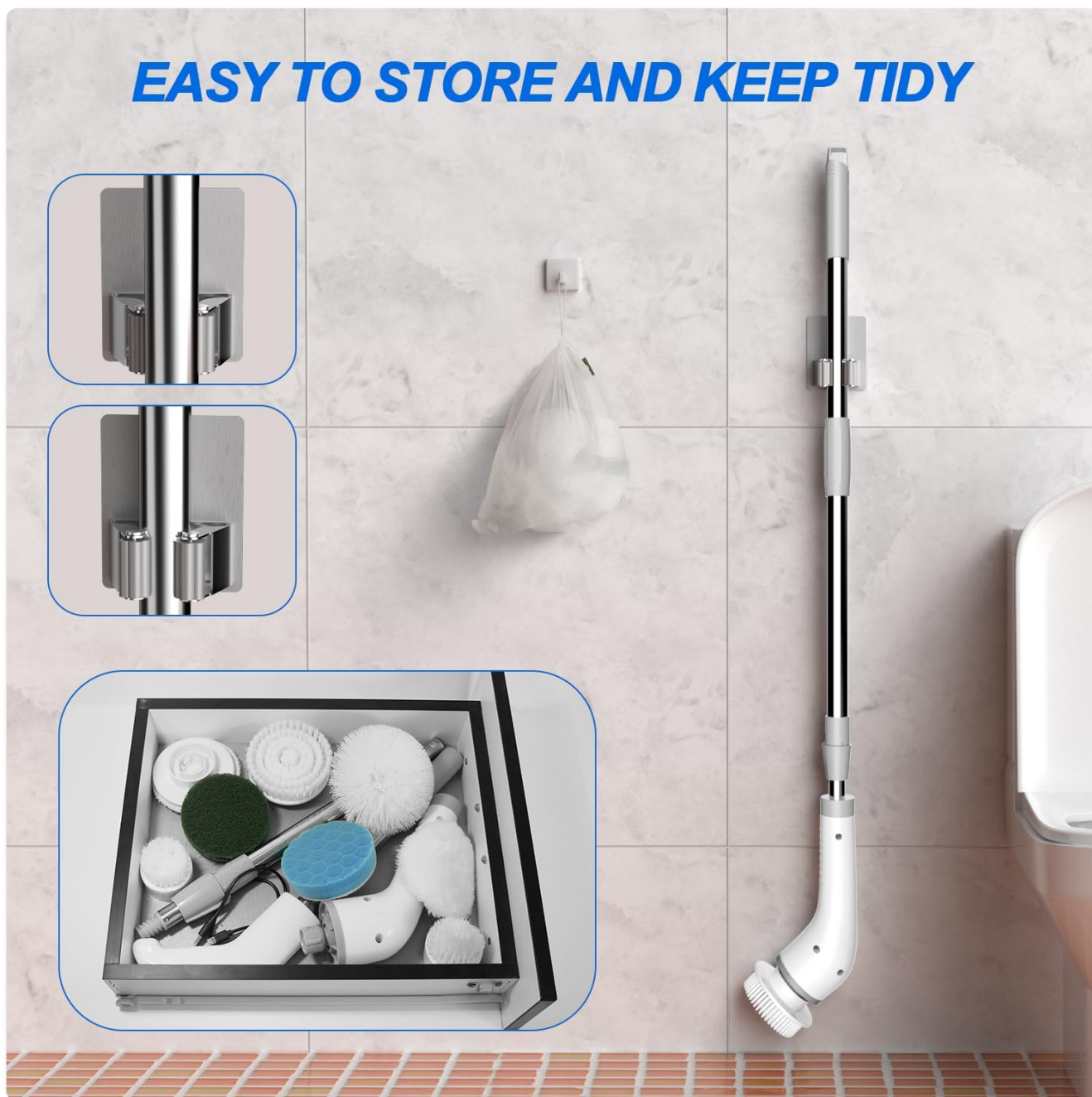
Image: Illustrates effective storage solutions, showing the extended scrubber hanging neatly on wall mounts and the various brush heads organized in a drawer.