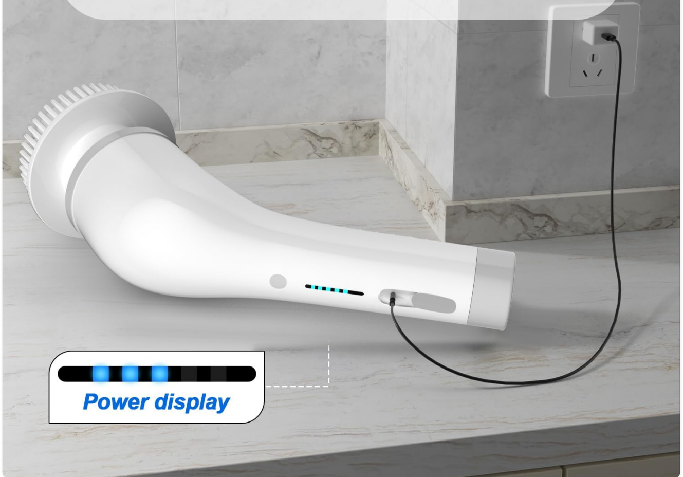
Image: Shows the electric spin scrubber connected to a power outlet via a Type-C charging cable, with an illuminated power display indicating battery status.