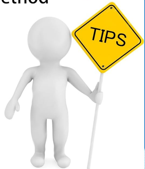
Image: Provides charging tips, advising to use a TYPE-C charging head (not C-C), charge after battery exhaustion, and use a 2A output power for optimal charging and extended product life.

Use TYPE-C charging head, not C-C charging head. Charge after the battery is exhausted. The best output power of the charging head is 2A. The correct charging method can extend the service life of the product.