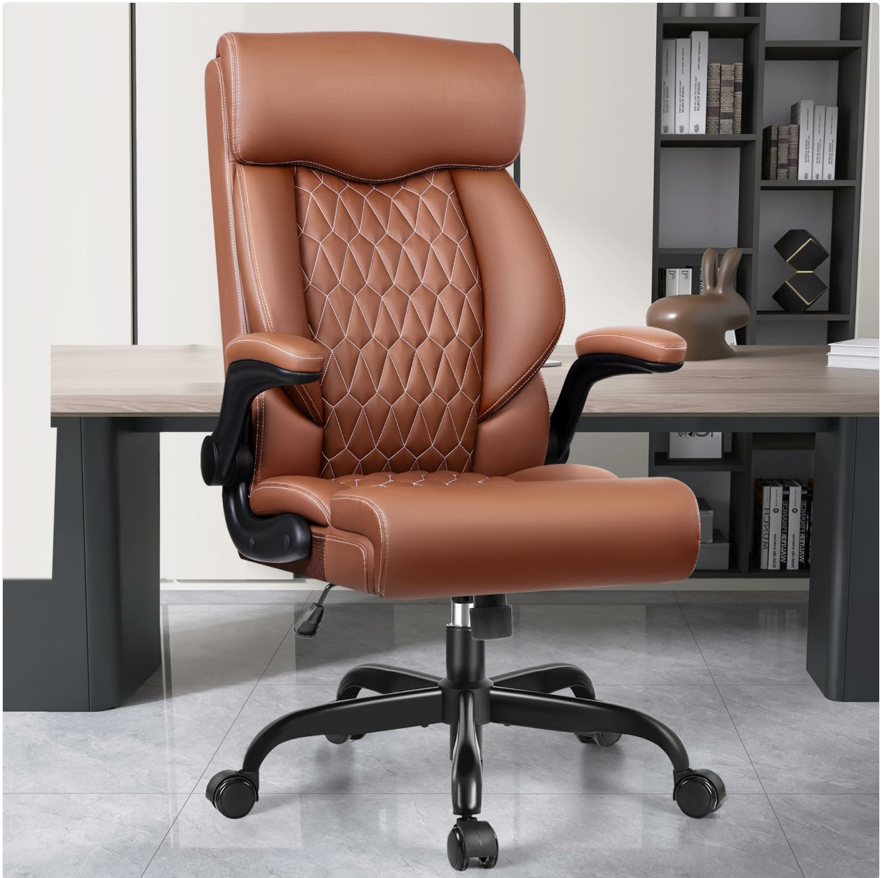
Image: Overview of the BestGlory Executive Office Chair, showing its main components.