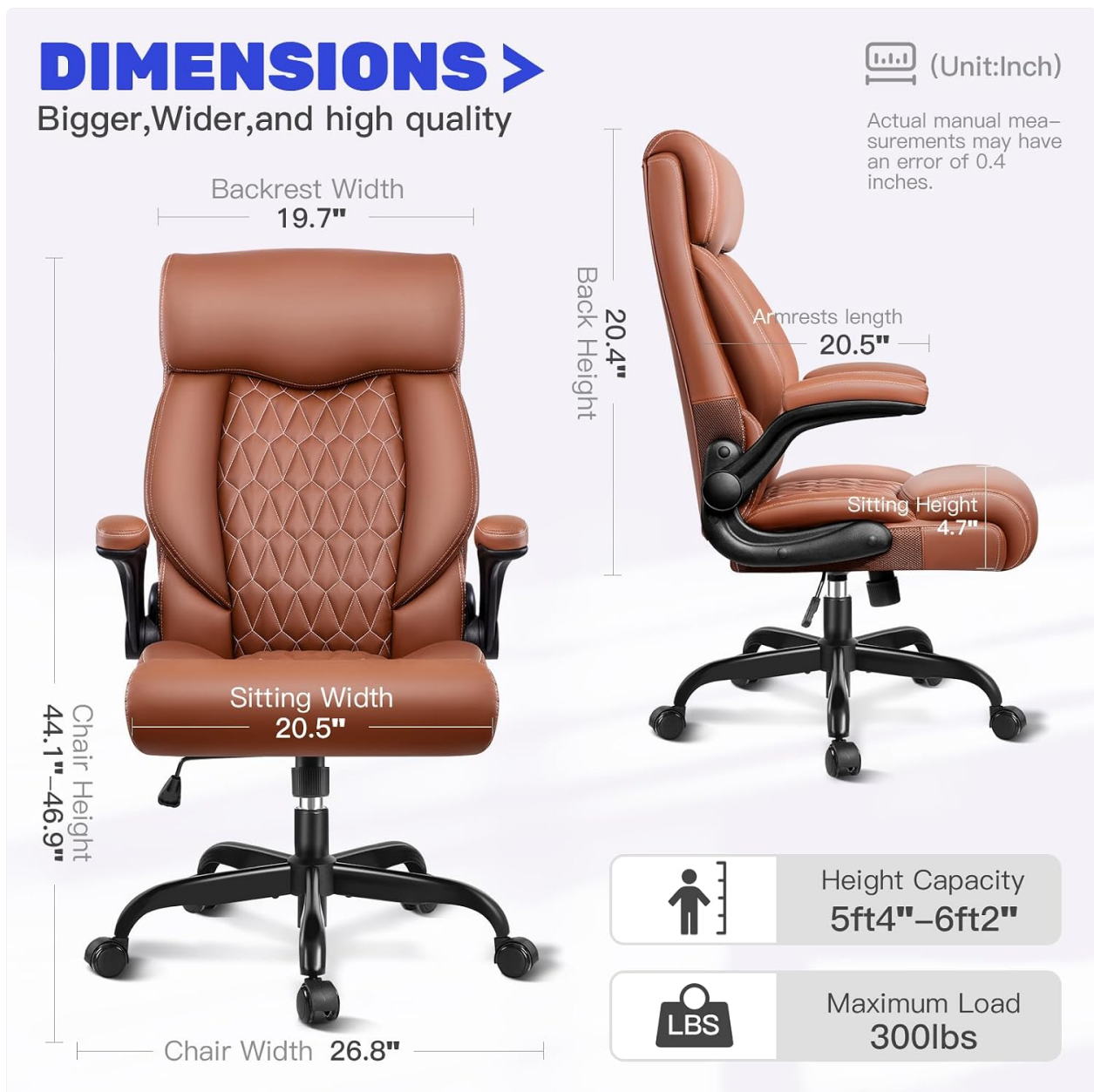
Image: The chair's height adjustment lever is located beneath the seat for easy access.

To adjust the seat height, locate the lever under the seat on the right side. Pull the lever up to raise the seat. To lower, remain seated and pull the lever up. Release the lever at the desired height.