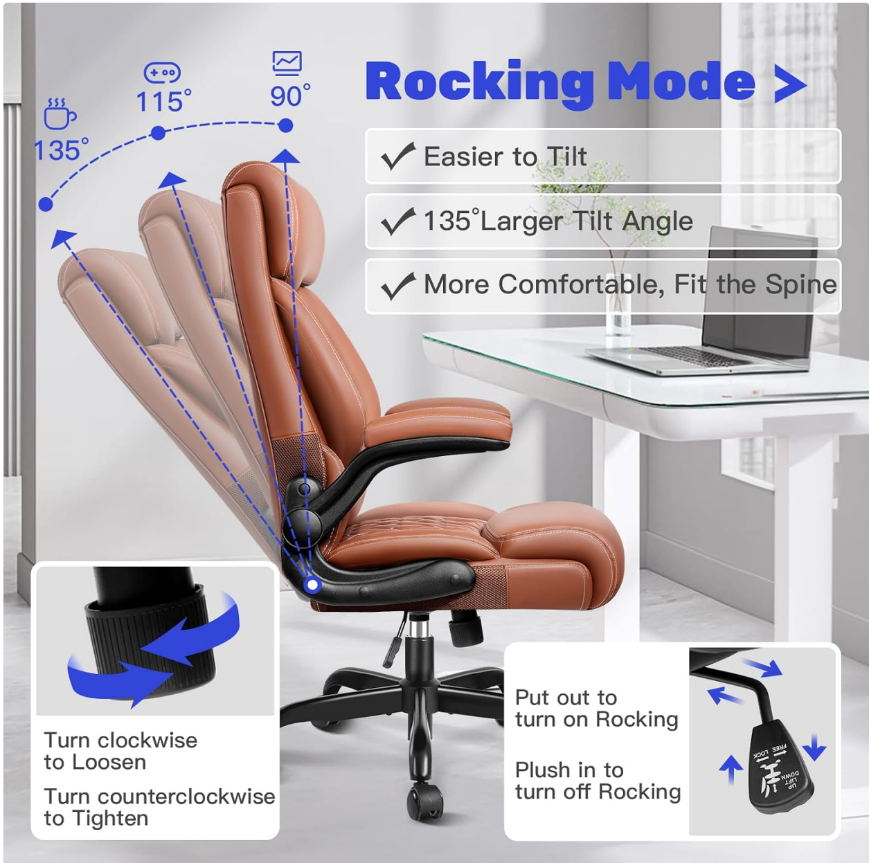
Image: Diagram illustrating the rocking mechanism and tilt lock lever, showing how to engage and disengage the rocking function and adjust tilt tension.

(between 90° and 135°), push the lever inwards. Adjust the tilt tension by rotating the round knob located under the front of the seat; turn clockwise to loosen for easier rocking, counter-clockwise to tighten for firmer resistance.