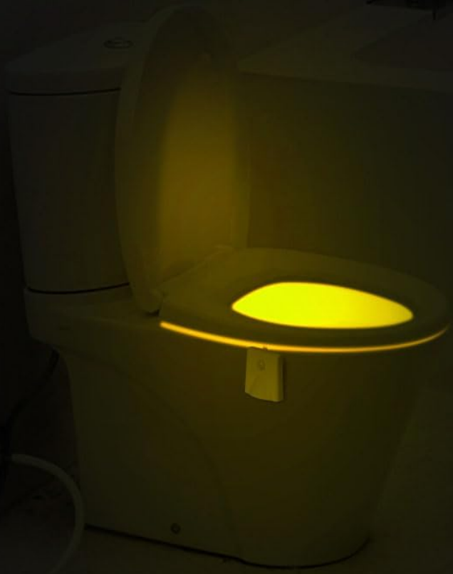
Image: The HOTUT Toilet Night Light illuminating a toilet bowl with a yellow light and projecting a star pattern onto the floor.