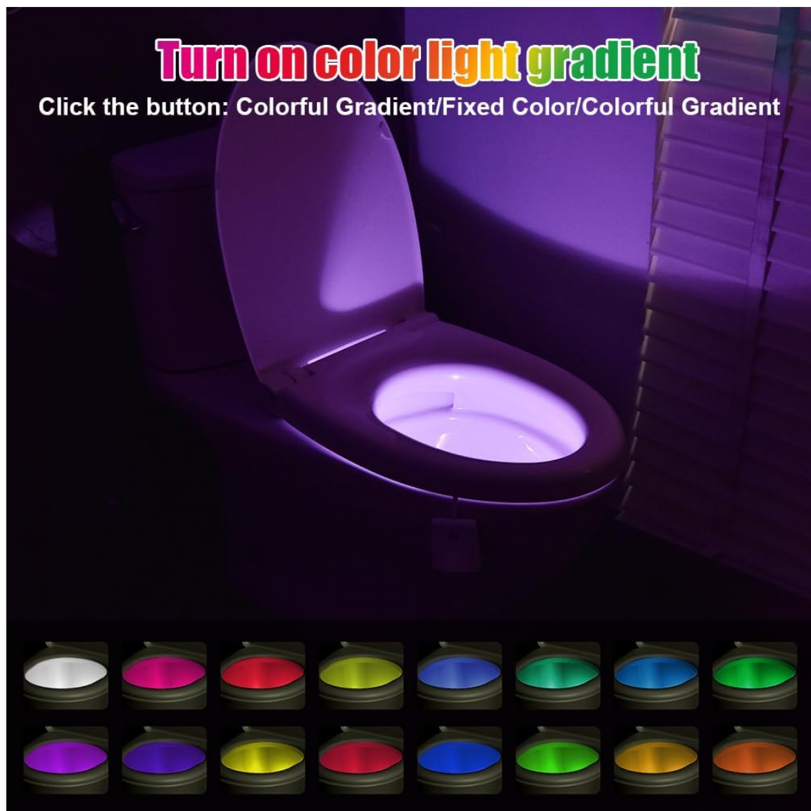
Image: The toilet night light displaying a purple hue, with a visual guide to the 16 available LED colors.