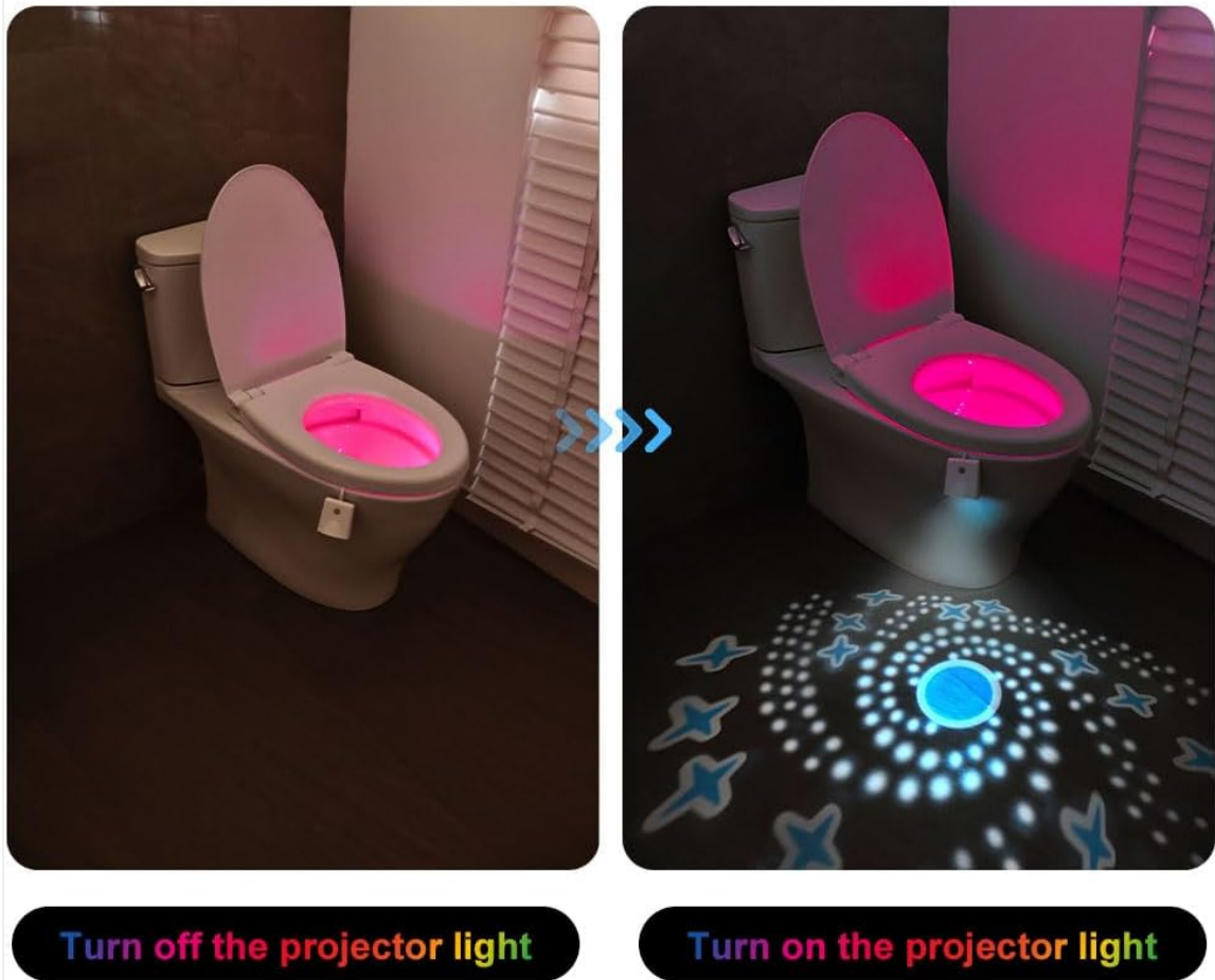
Image: Comparison showing the toilet night light with the projector off and with the star projector activated.

Long press button: turn on/off the projector light