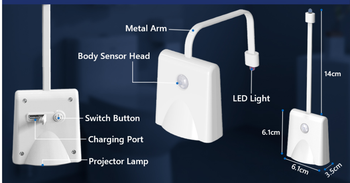
Image: Diagram illustrating the various parts of the toilet night light and its dimensions.