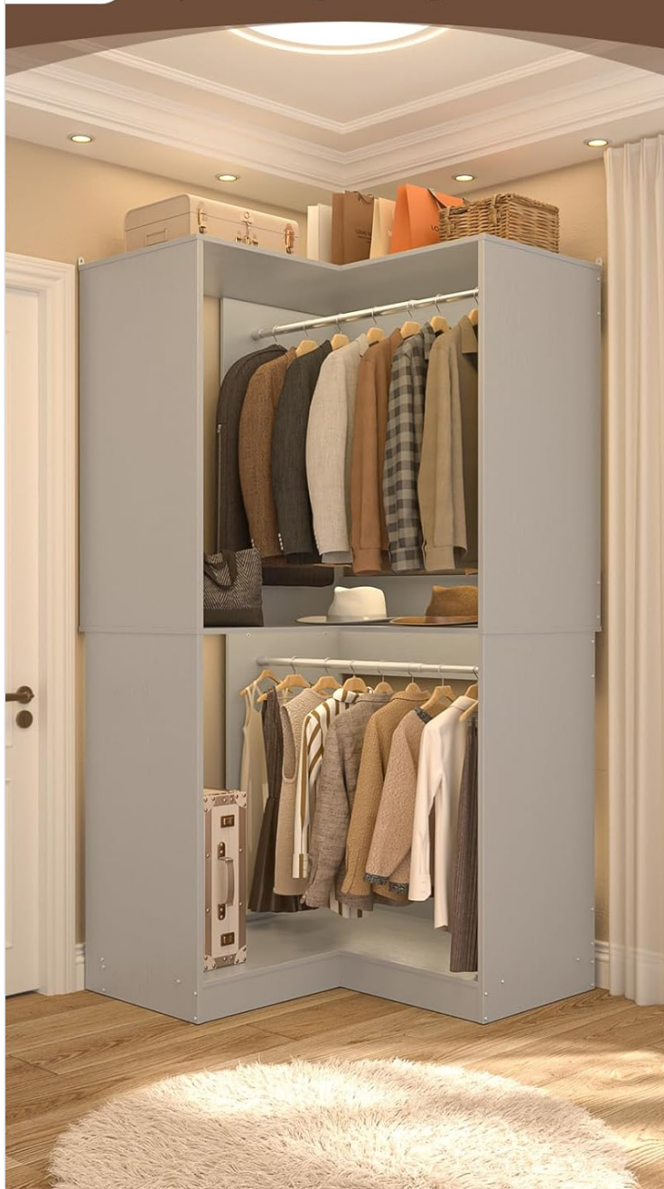
After Tidy with Large Storage Corner Closet