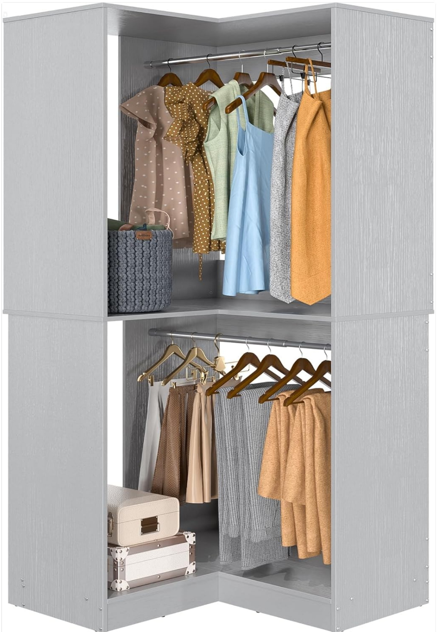
Image: The Armocity Corner Closet System in its grey finish, showcasing its two hanging rods and multiple storage compartments,