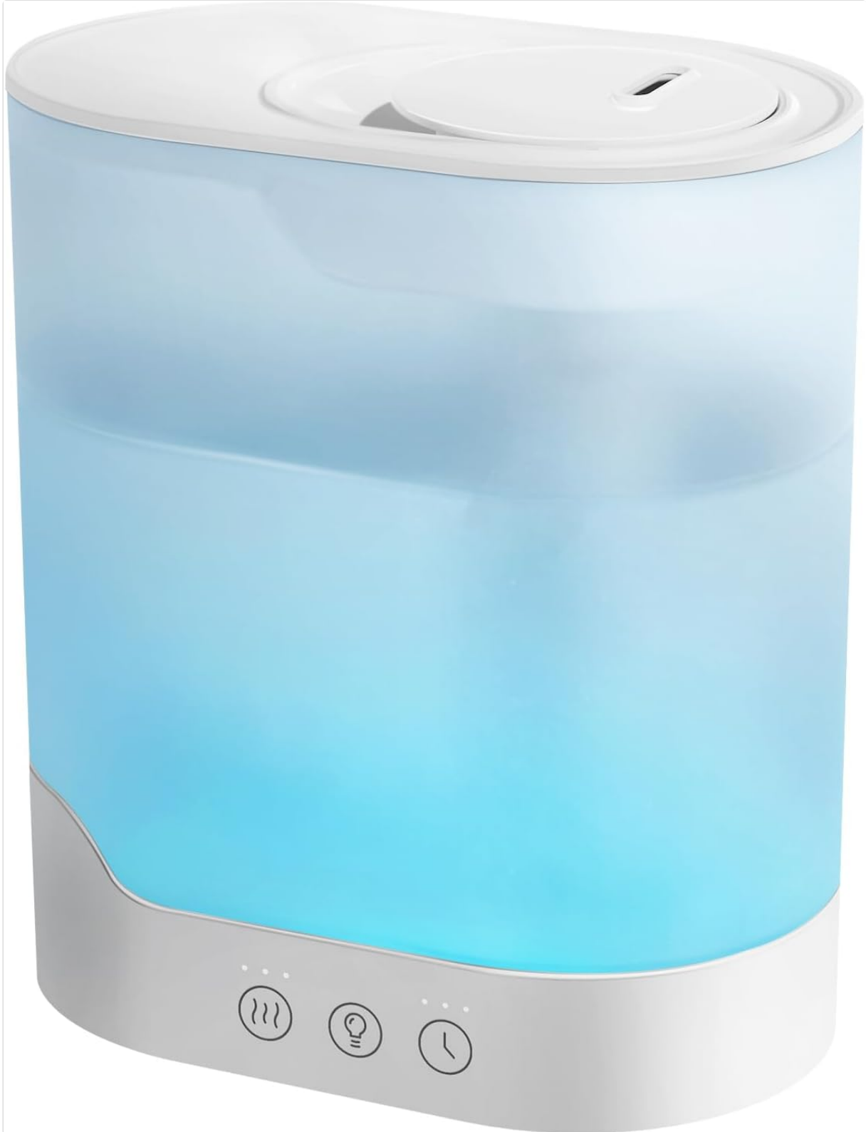
Figure 4.1: Front view of the YOGIN 3L Humidifier, showing the translucent water tank with blue ambient light and the control panel at the base.

Familiarize yourself with the main parts of your YOGIN humidifier.