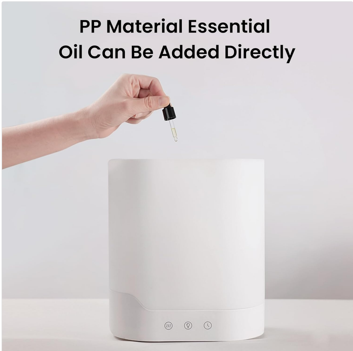
Figure 5.1: Demonstrating how to add essential oils directly into the water tank.