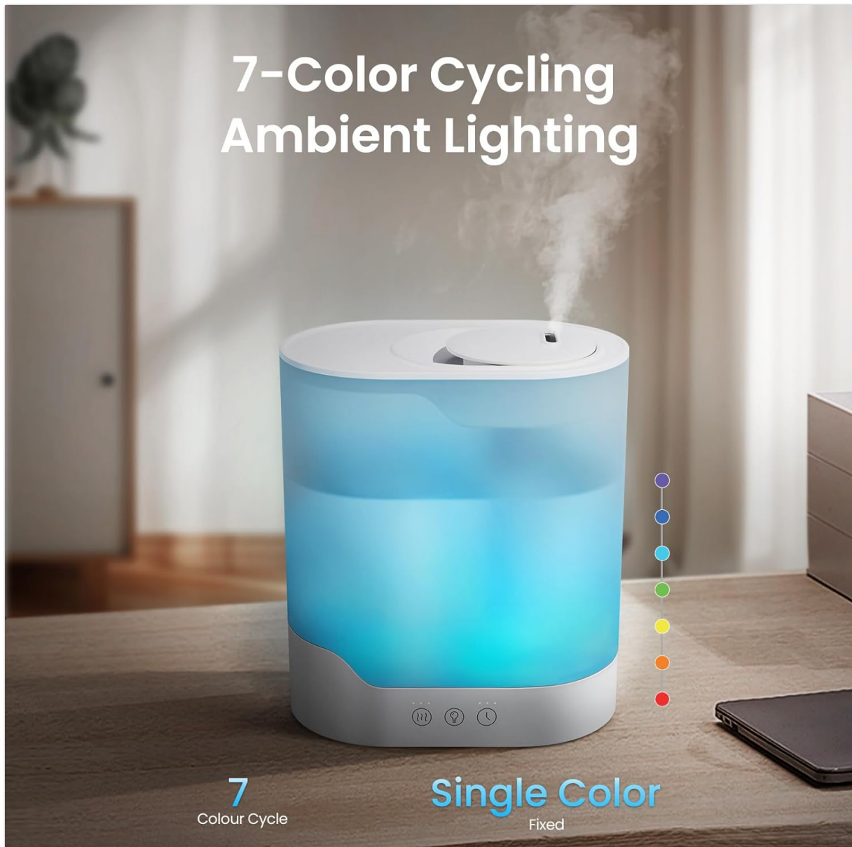
Figure 6.2: The humidifier showcasing its 7-color cycling ambient lighting feature.

Press the light button (indicated by a light bulb icon) to cycle through the 7-color ambient lighting options or to turn the light off. You can choose a single color or allow it to cycle automatically.