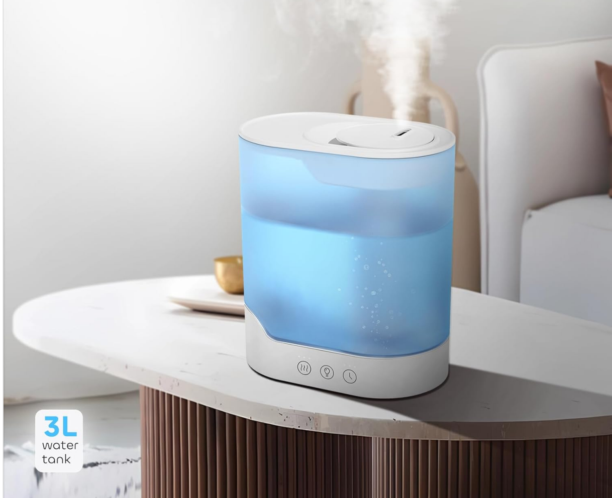
Figure 4.2: The humidifier in operation, demonstrating mist output from the top nozzle.