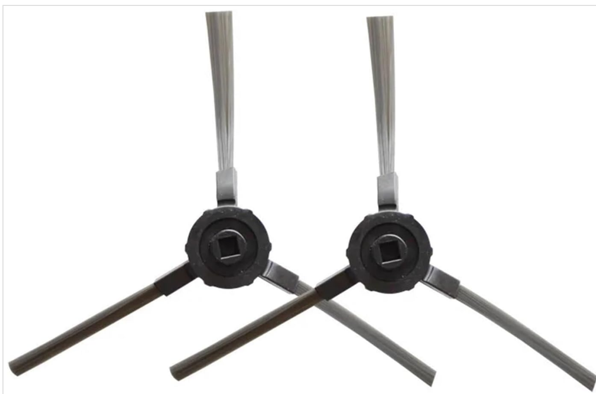
This image features two side brushes, crucial for sweeping debris from edges and corners into the robot vacuum's main cleaning path.