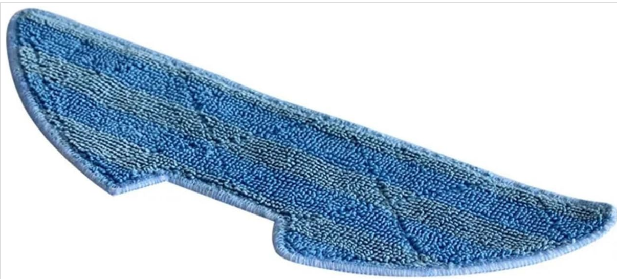
Shown here is a blue microfiber mop cloth, designed for wet or dry mopping to effectively clean hard floor surfaces.