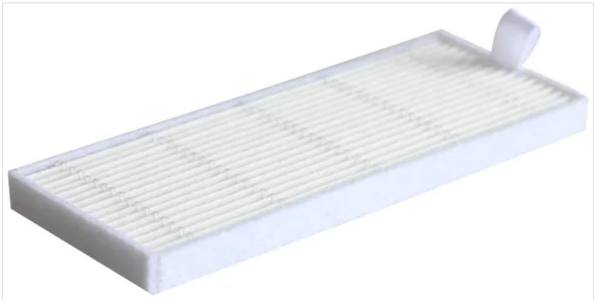
A close-up of a single HEPA filter, highlighting its pleated design for maximum filtration efficiency.