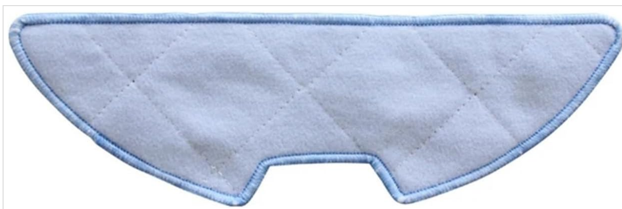
Another view of a mop cloth, this one in a light blue and white pattern, used for thorough floor cleaning.