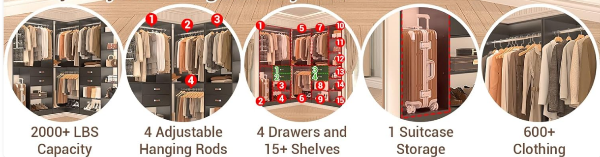
Image 1.2: Overview of the closet system's features, including capacity, adjustable rods, shelves, drawers, and dedicated suitcase storage.