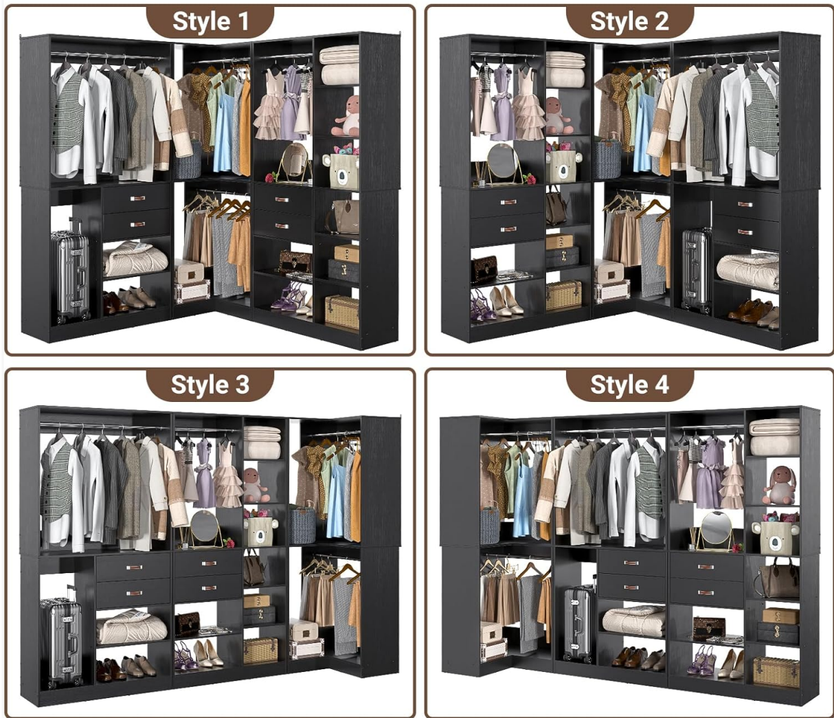
Image 4.1: Various DIY installation methods for the closet system, illustrating different layout possibilities.

Can be set up as a one multifunctional wardrobe or as 3 separate closet system