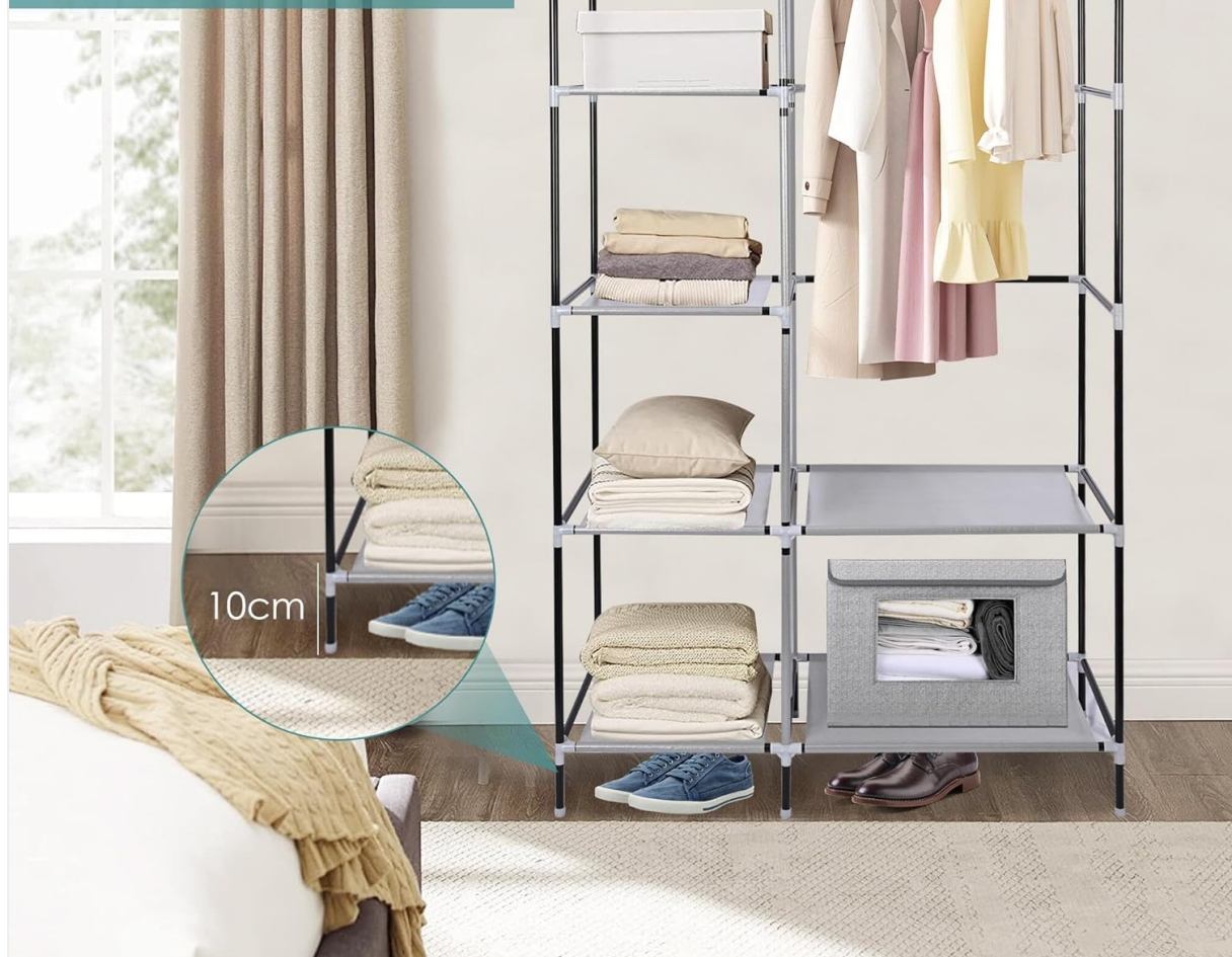
Figure 5: High-leg design for moisture protection and under-wardrobe storage.

Convenient for cleaning and cleaning, it can allow the sweeping robot to pass through, and it can also be used to store shoes.