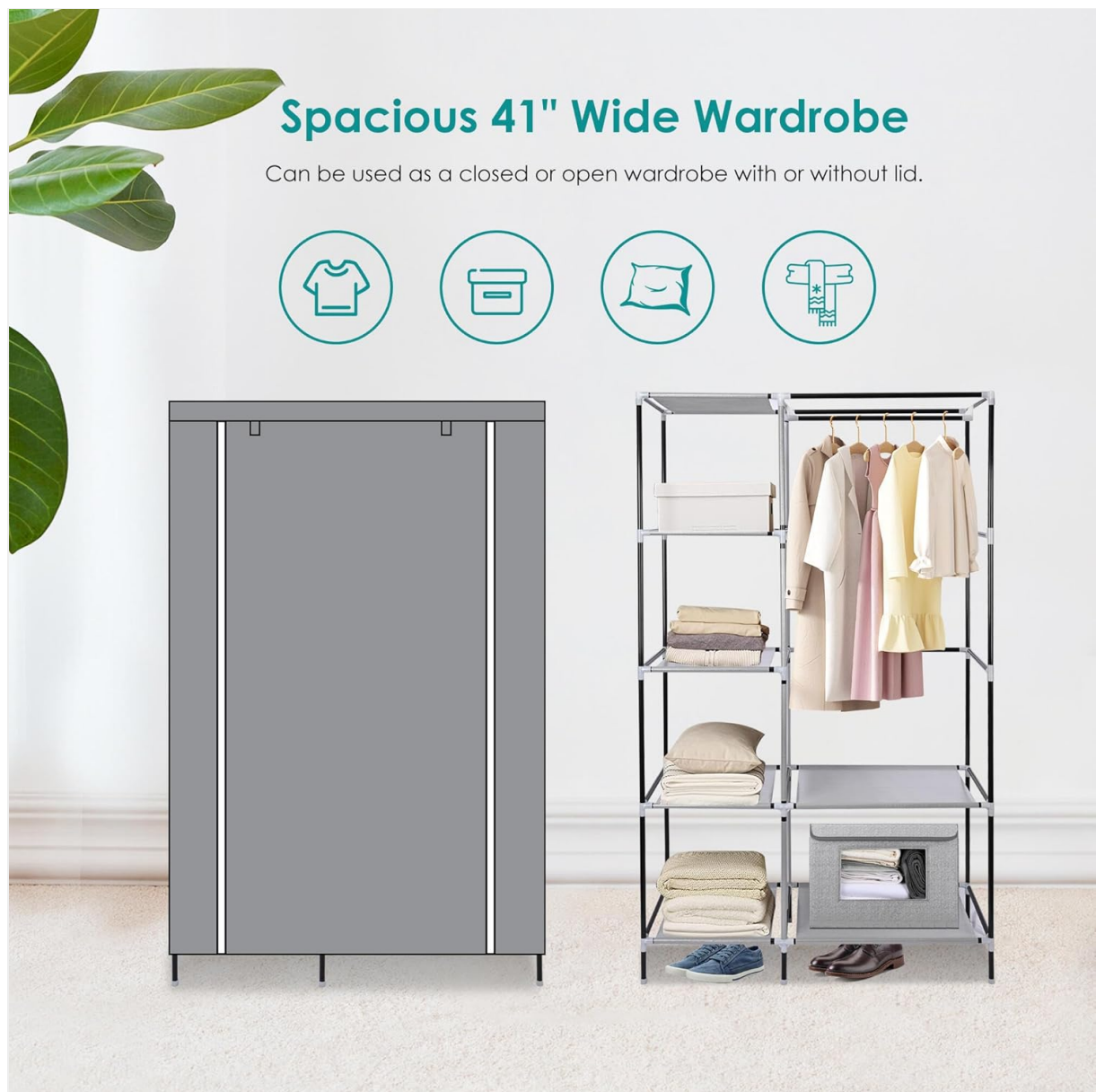
Figure 4: Spacious interior and cover options for the wardrobe.