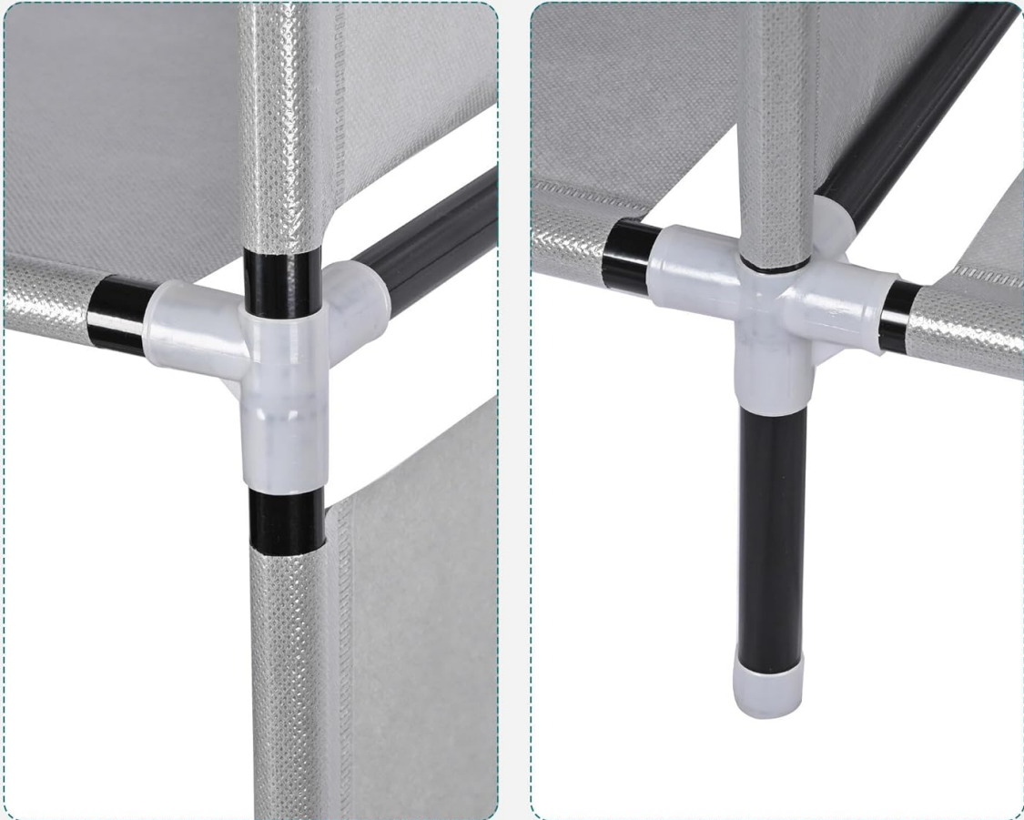
Figure 3: Detail of the durable PP plastic connectors.

Sturdy and not easy to break, suitable for long-term use.