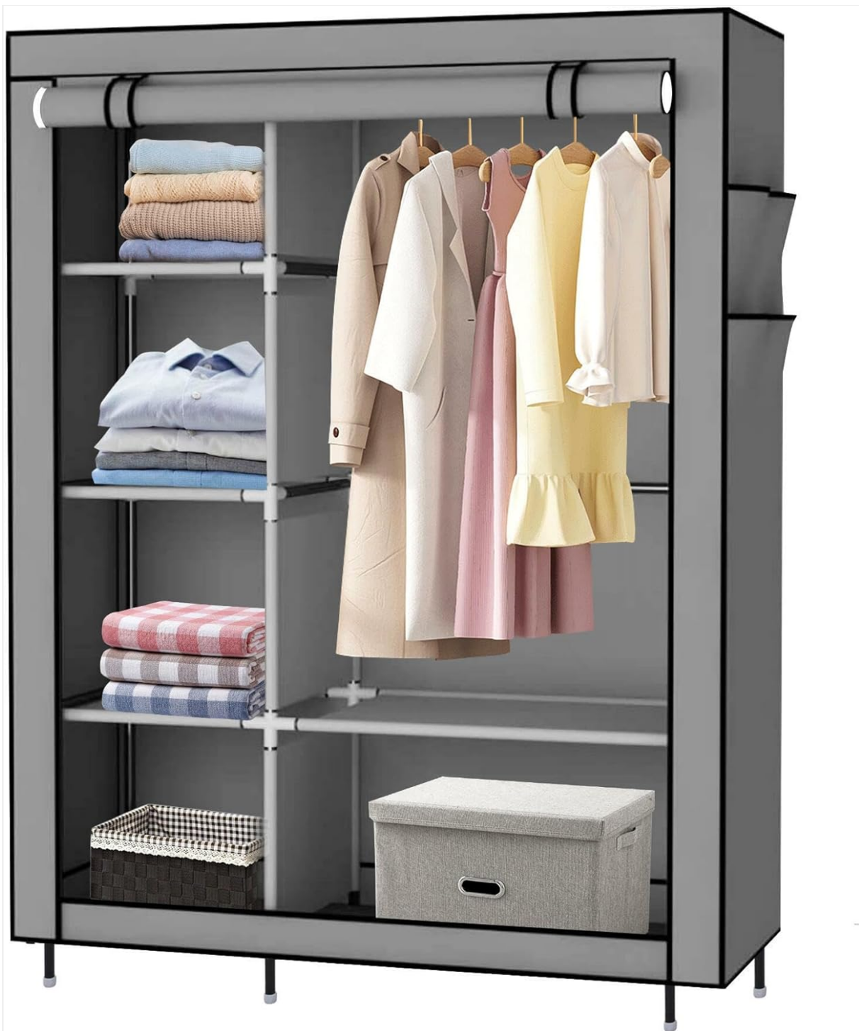
Figure 1: Fully assembled SortWise Portable Closet Wardrobe.