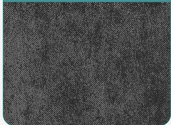
Figure 7: Comparison illustrating the durable non-woven fabric.