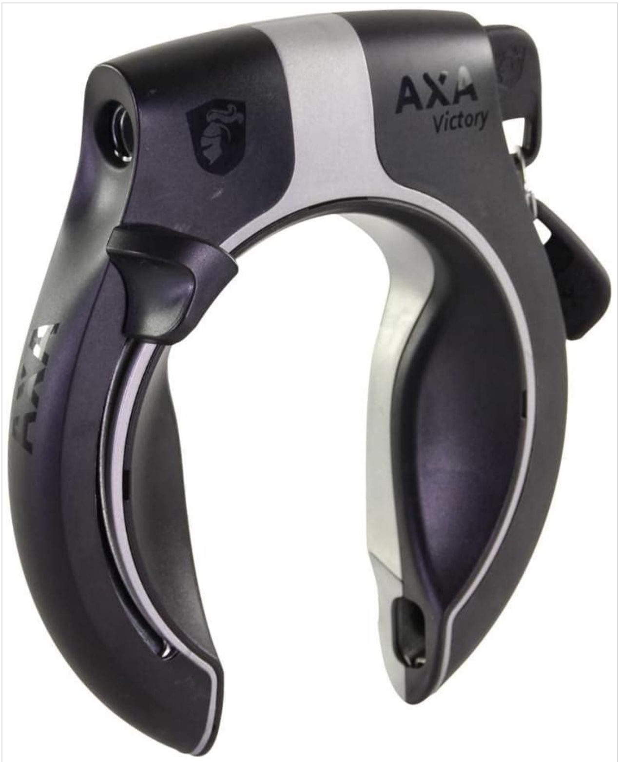
Figure 1: Front view of the AXA Victory Frame Lock, showcasing its robust design and key slot.