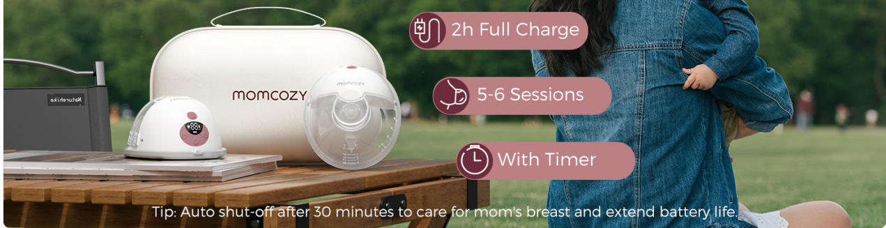
Image: Information on the Momcozy M5's battery life, indicating 2 hours for a full charge, providing 5-6 pumping sessions, and featuring a built-in timer.