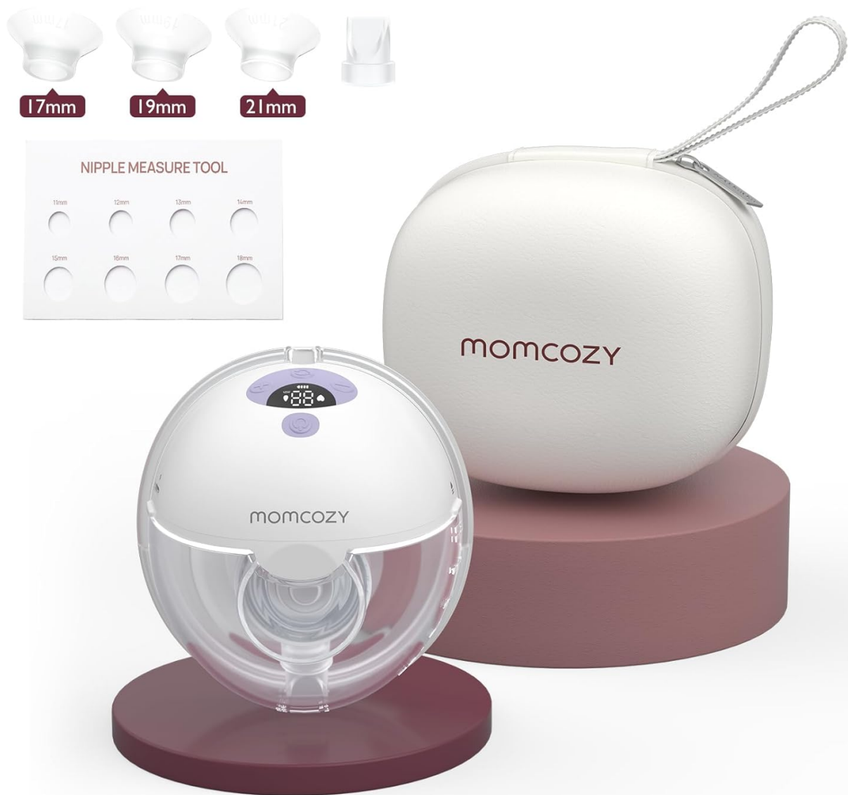
Image: The Momcozy M5 pump, its compact carrying case, and a nipple measurement tool.