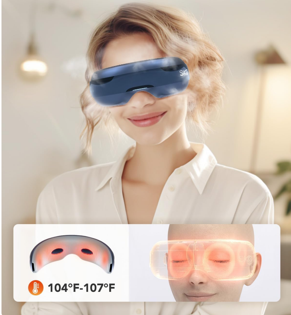
Figure 4: Diagram illustrating the constant temperature heat therapy provided by the SKG EYE1 eye massager, ranging from 104°F to 107°F.