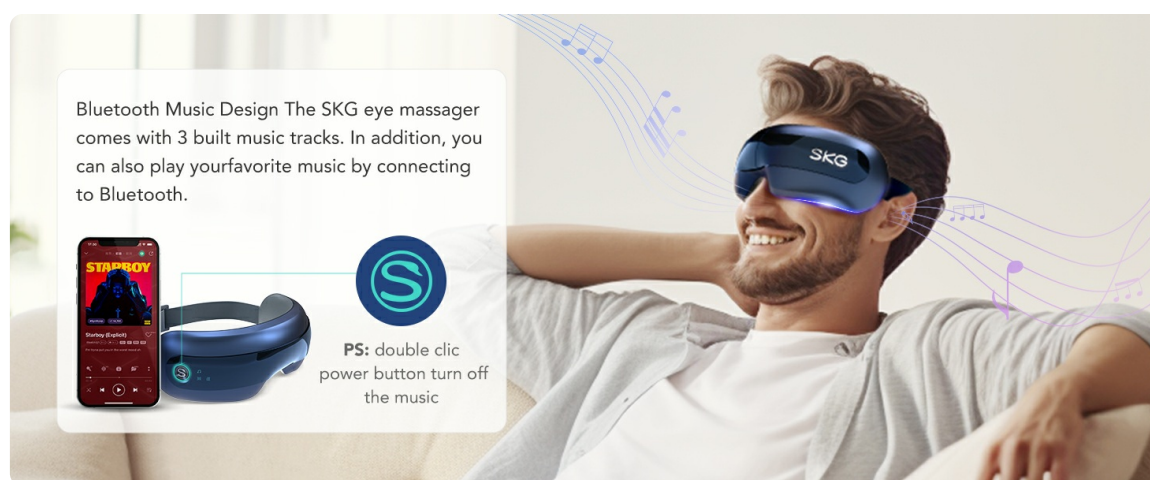
Figure 2: Illustration of how to wear the SKG EYE1 eye massager, showing the adjustable headband for a custom fit.

Ensure the device is powered off. Place the massager over your eyes, aligning the vision window. Adjust the elastic strap for a comfortable and secure fit. The device should feel snug but not overly tight.