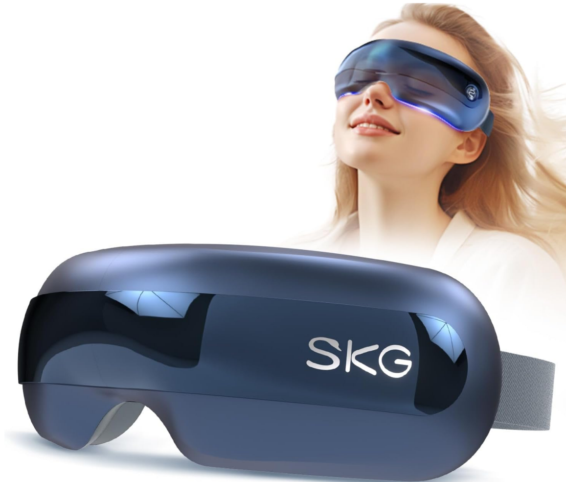
Figure 1: Front view of the SKG EYE1 Bluetooth Heated Eye Massager. This image displays the device in its blue color, highlighting its ergonomic shape and the SKG logo.

The SKG EYE1 eye massager features a sleek design with a comfortable fit, incorporating heat, air compression, and vibration massage. It includes a unique vision window for situational awareness.