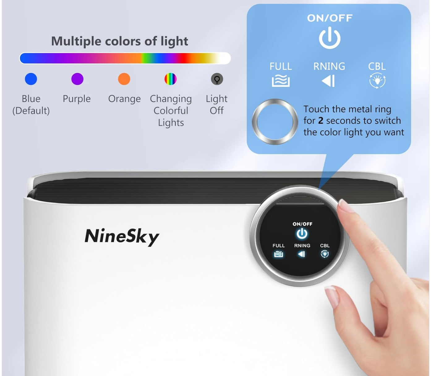
Figure 6: Diagram showing the light control metal ring and available LED light colors.