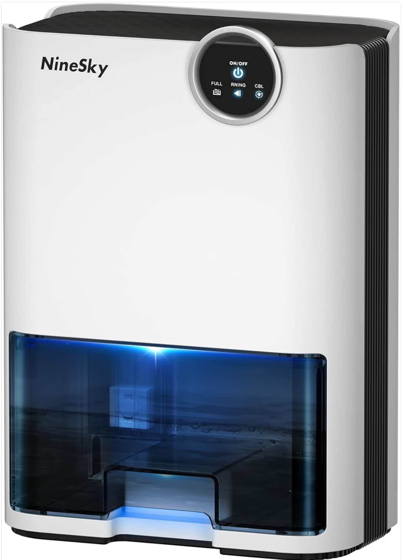
Figure 1: Front view of the NineSky Dehumidifier, showing the control panel and visible water tank.