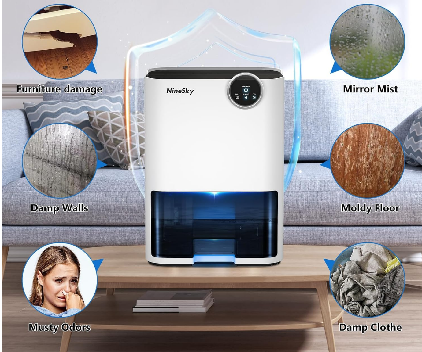
Figure 5: Illustration of the dehumidifier in normal operation (blue light) and with a full water tank (red light and alarm).