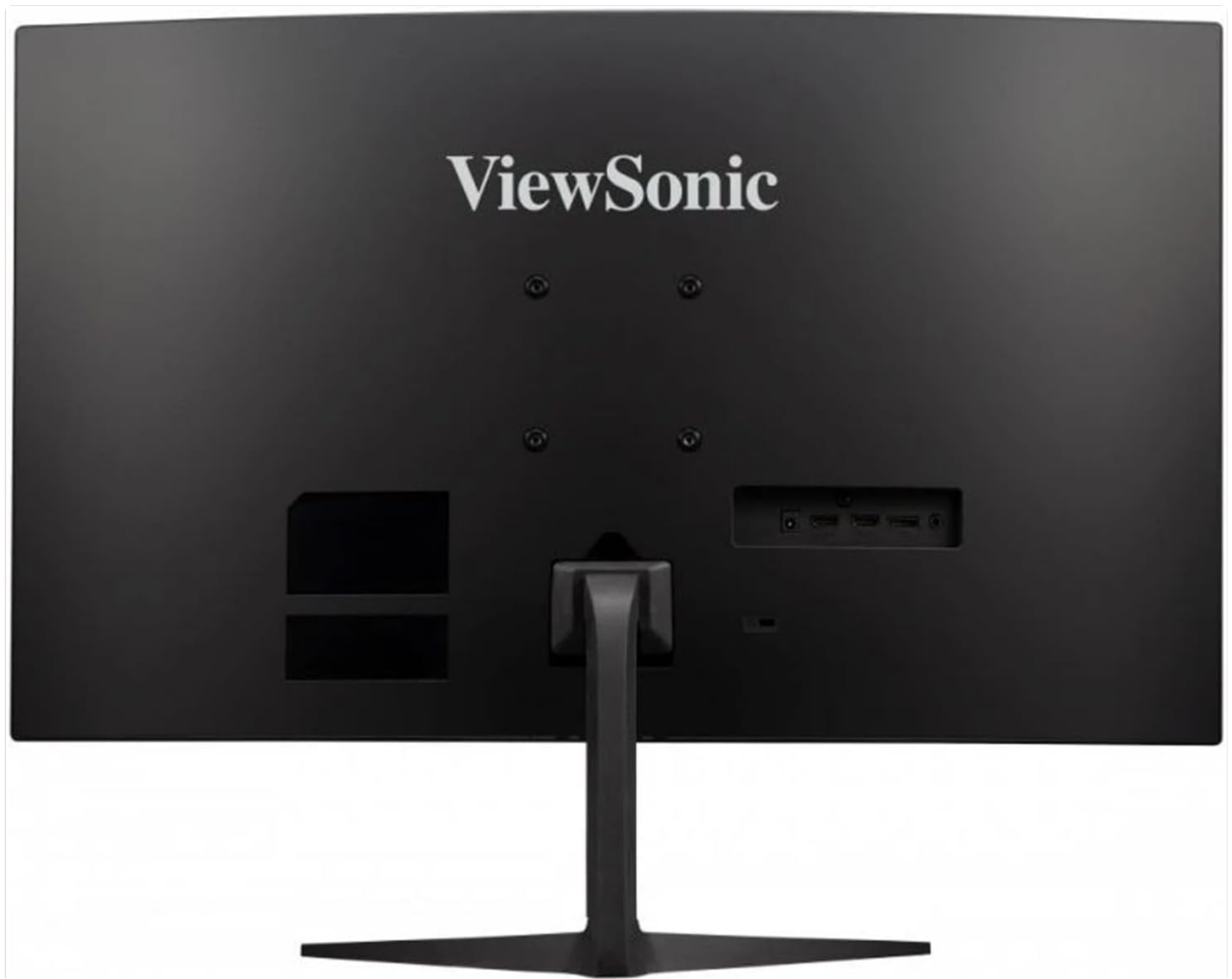
Figure 3: Rear view of the ViewSonic OMNI VX2718-2KPC-MHD monitor, highlighting the HDMI, DisplayPort, and audio out ports.