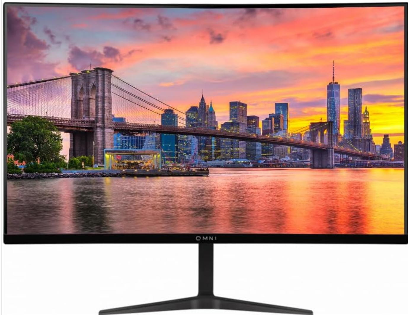
Figure 1: Front view of the ViewSonic OMNI VX2718-2KPC-MHD monitor, showcasing its curved display and slim bezels.