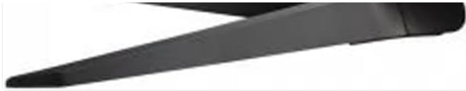
Figure 2: Side view of the ViewSonic OMNI VX2718-2KPC-MHD monitor, illustrating its curved profile and stand attachment point.