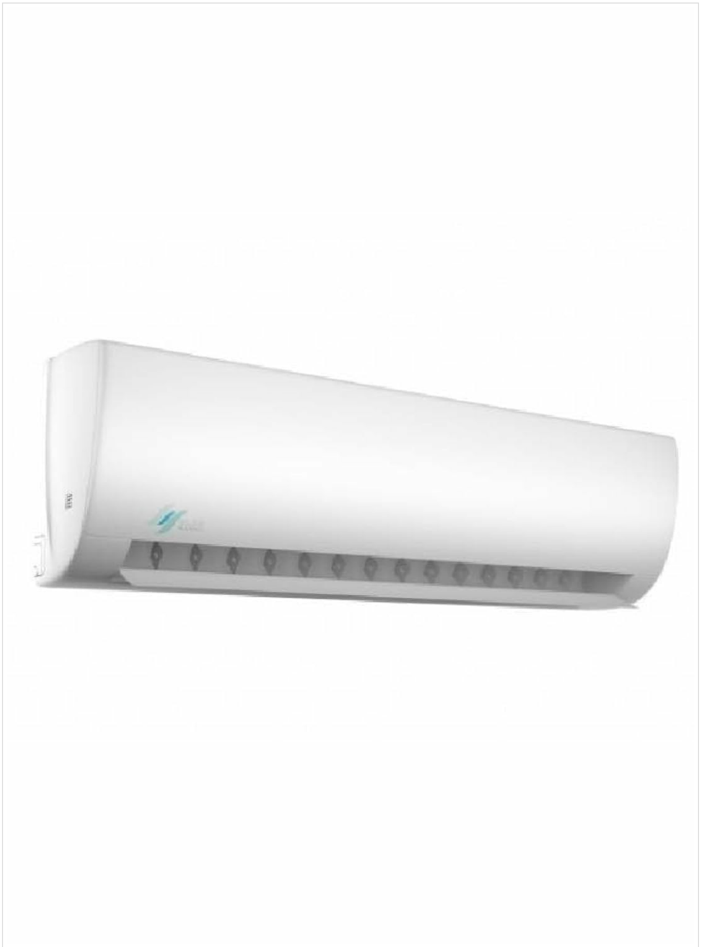
Figure 3.1: Mando F23TP-18CT Indoor Unit installed in a room.