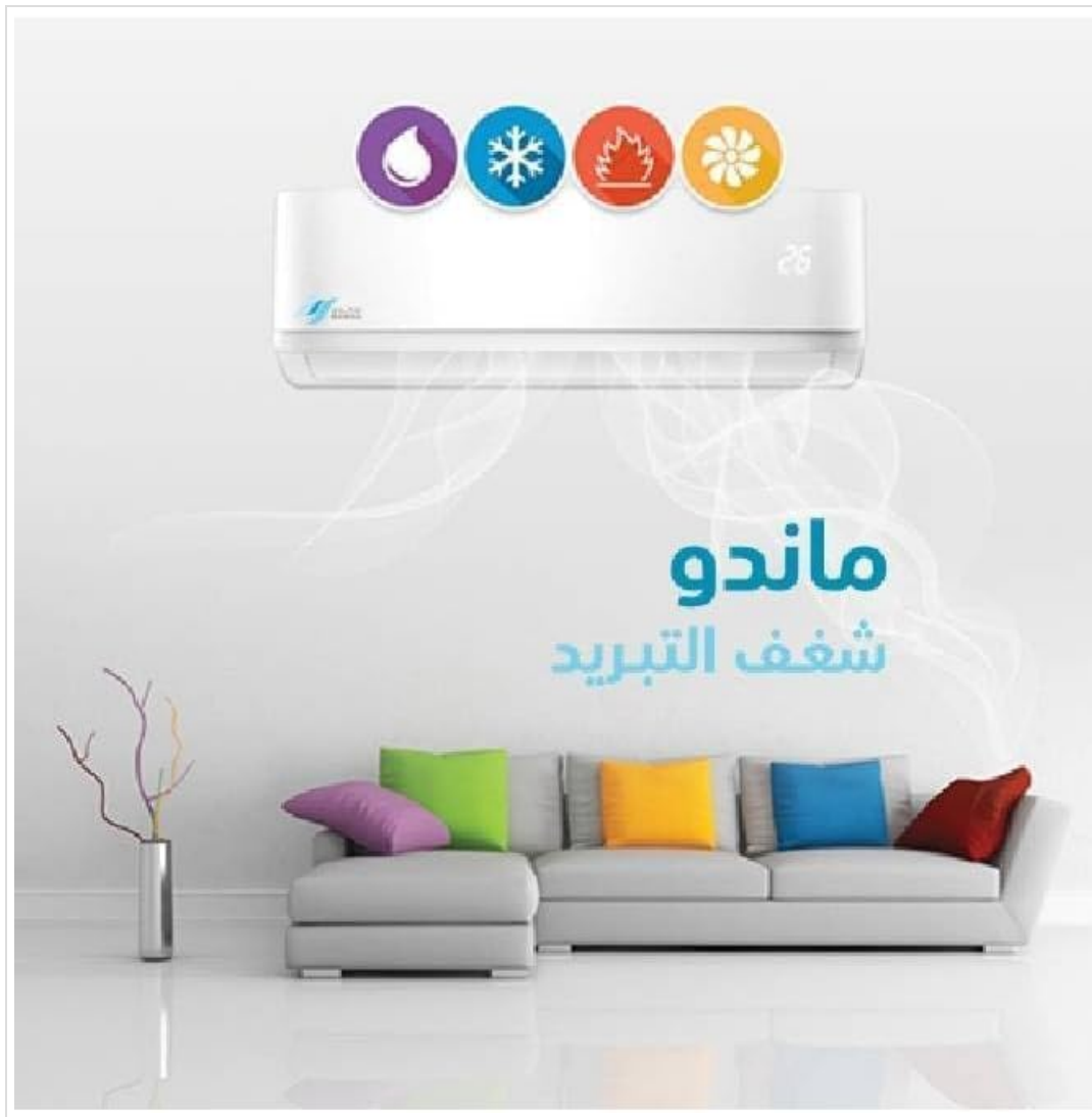
Figure 3.2: Front view of the indoor unit, showing the digital display.