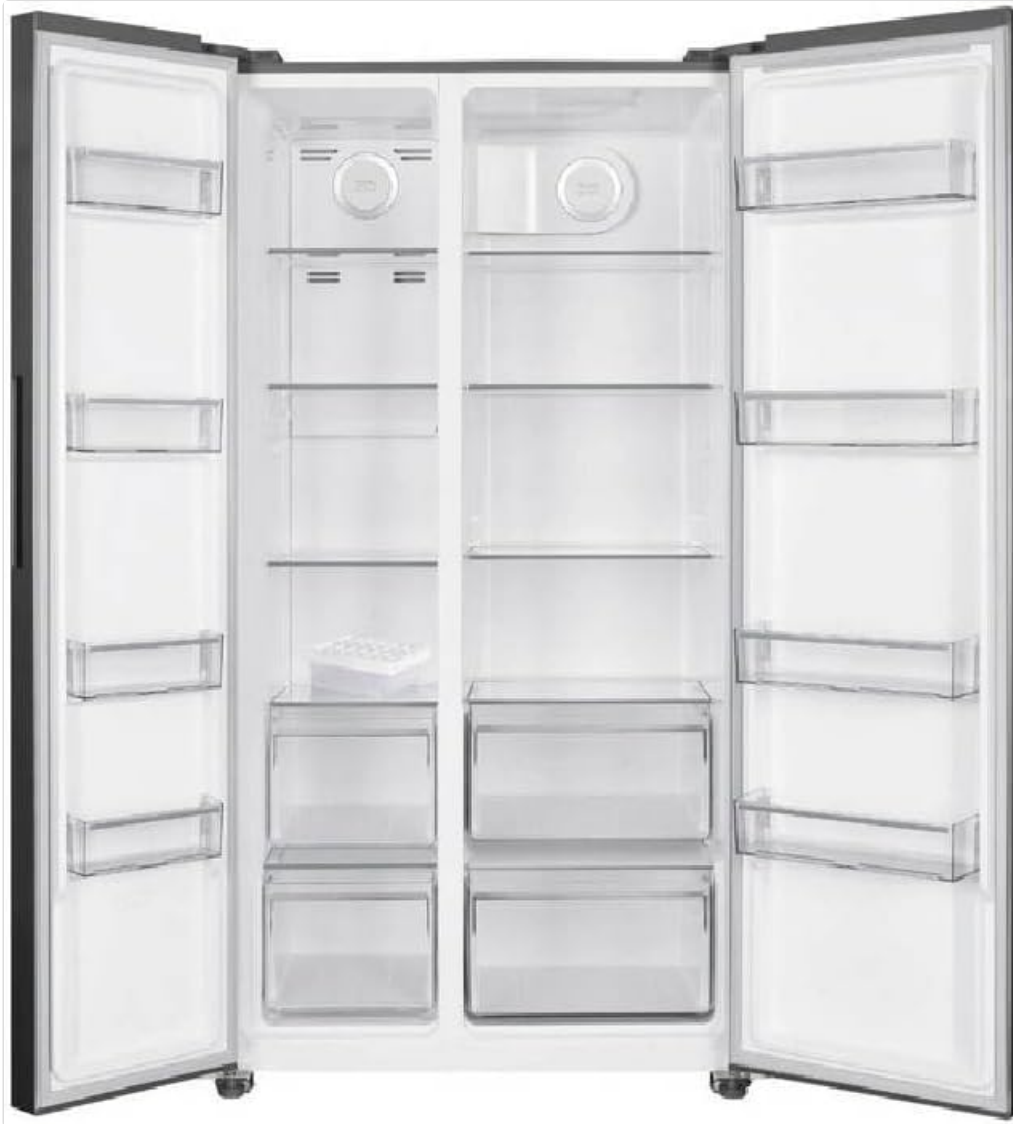
Figure 2.2: Interior view of the HAAM Side by Side Refrigerator with doors open. This image displays the spacious shelves, door bins, and crisper drawers in both the refrigerator and freezer compartments.