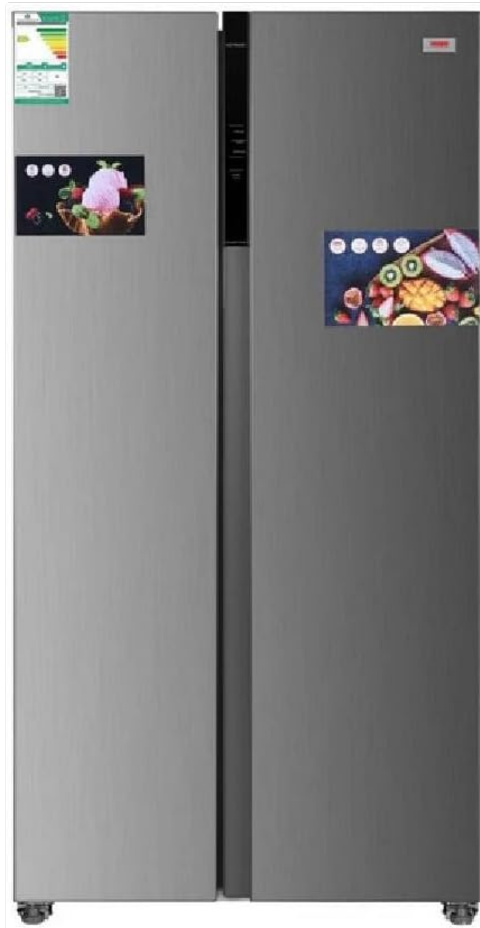
Figure 2.1: Exterior view of the HAAM Side by Side Refrigerator. This image shows the sleek silver finish and the integrated control panel on the freezer door.