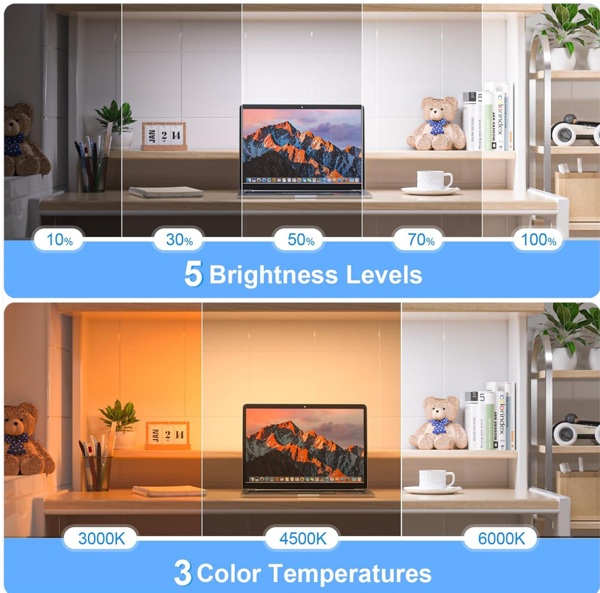
Figure 3: Visual representation of 5 brightness levels and 3 color temperatures.