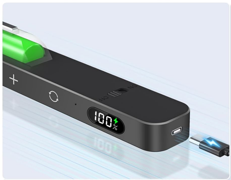
Figure 4: Battery level display and Type-C charging feature.

Type-C Rechargeable Fully charged within 4 hours