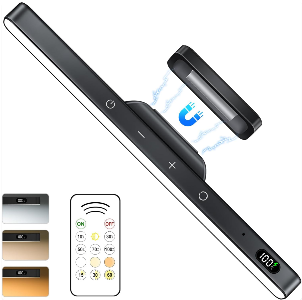
Figure 1: WILLED 3W Rechargeable Light Bar with Remote Control and color temperature samples.