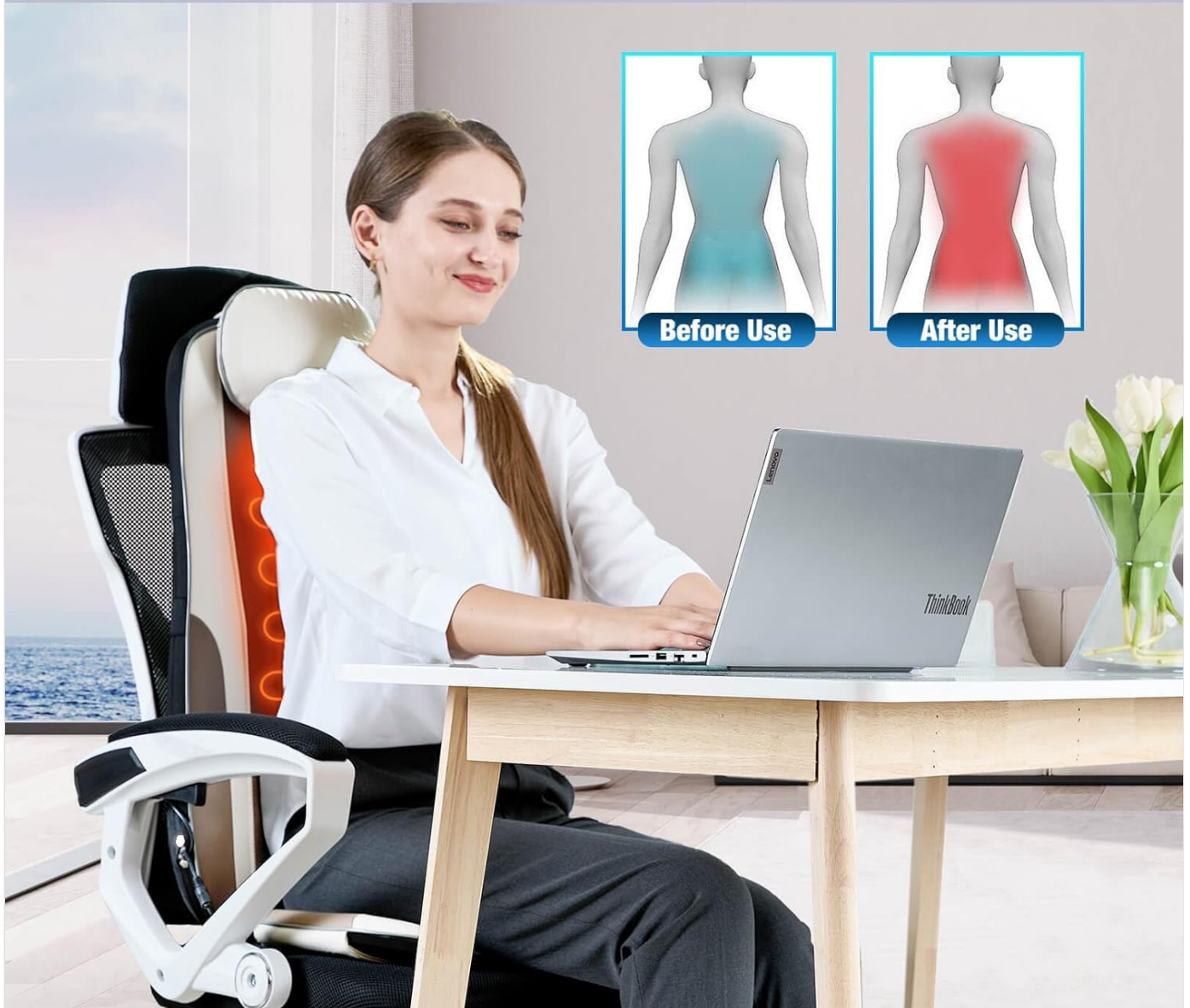
Figure 3: Visual representation of the back heating nodes providing warmth.

Note: The Heat Is On The Roller Nodes, It's Not A Heating Pad.