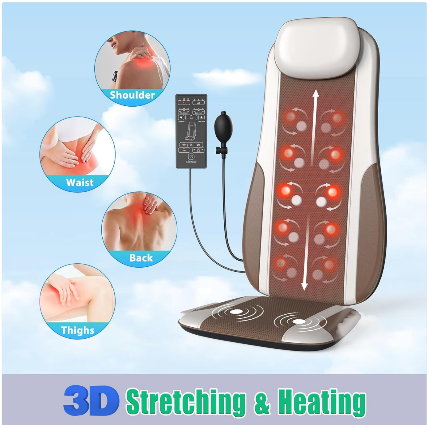
Figure 7: The massager targets various areas including shoulders, waist, back, and thighs.