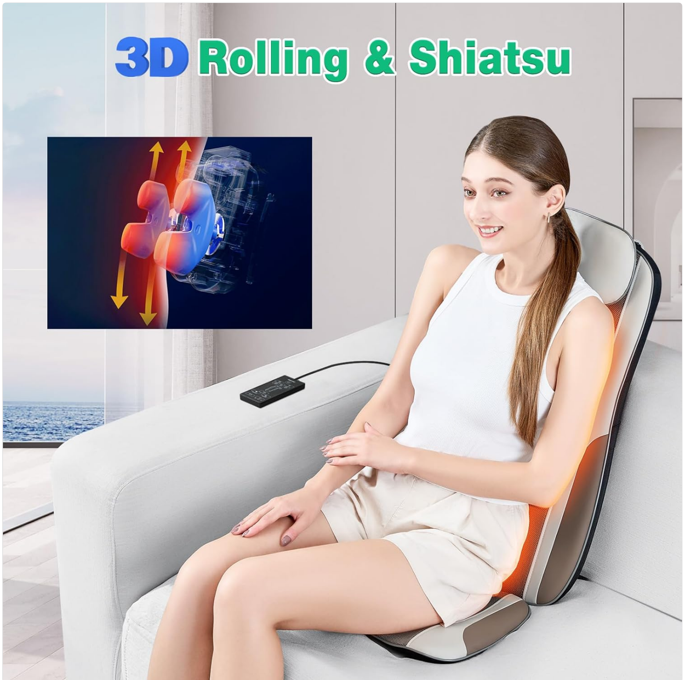
Figure 2: Illustration of 3D Rolling & Shiatsu massage action on the back.