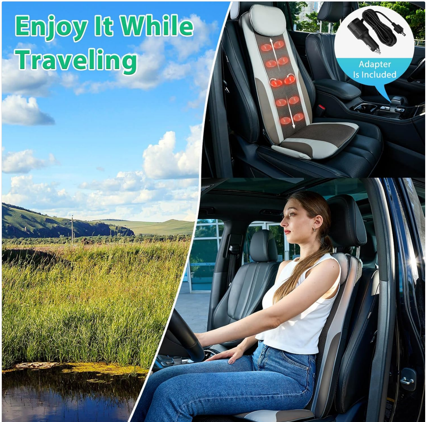
Figure 4: The massager is designed to fit most common chair types.