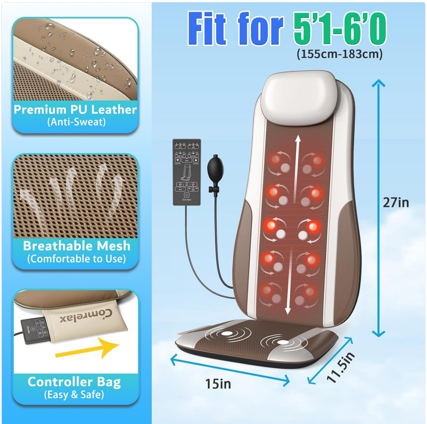
Figure 9: Product dimensions and material details.