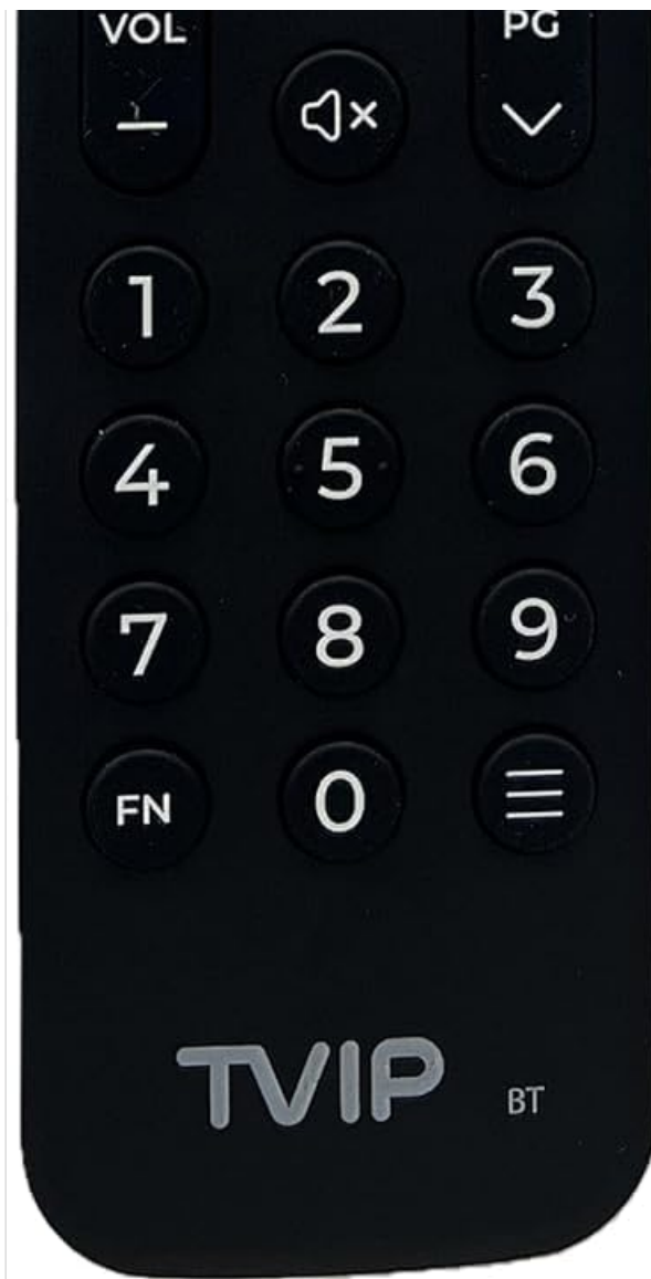
Figure 2: Front view of the remote control with key functions labeled.