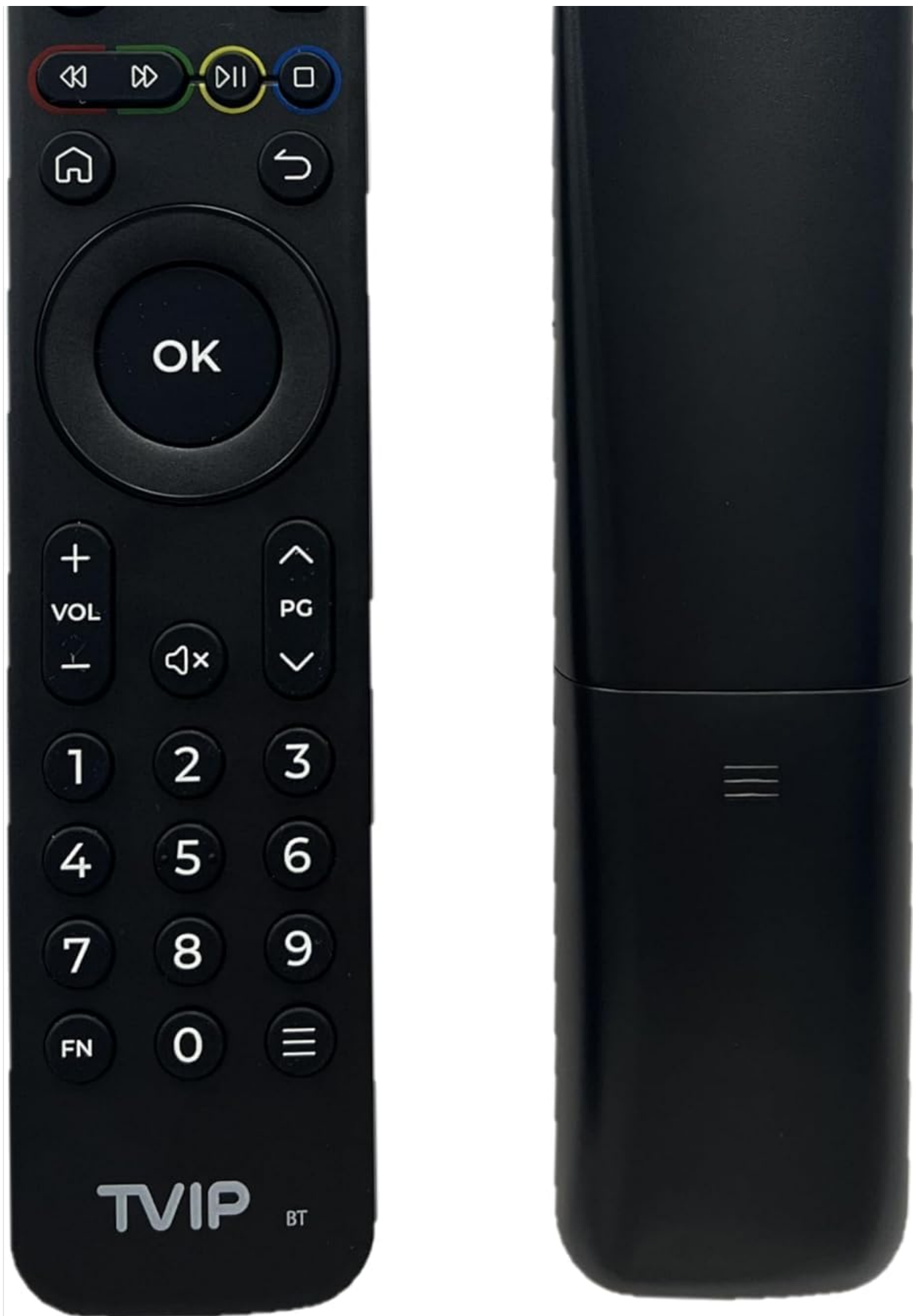
Figure 1: Back view of the remote control, illustrating the battery compartment location.