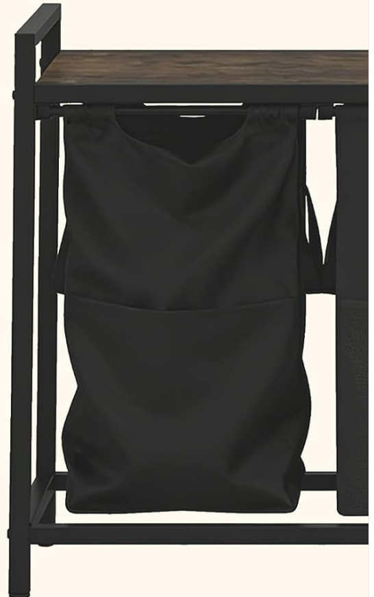
Image: Visual comparison demonstrating how the included plastic bottom panel prevents the laundry bags from sagging, ensuring they stay upright and maintain their shape.