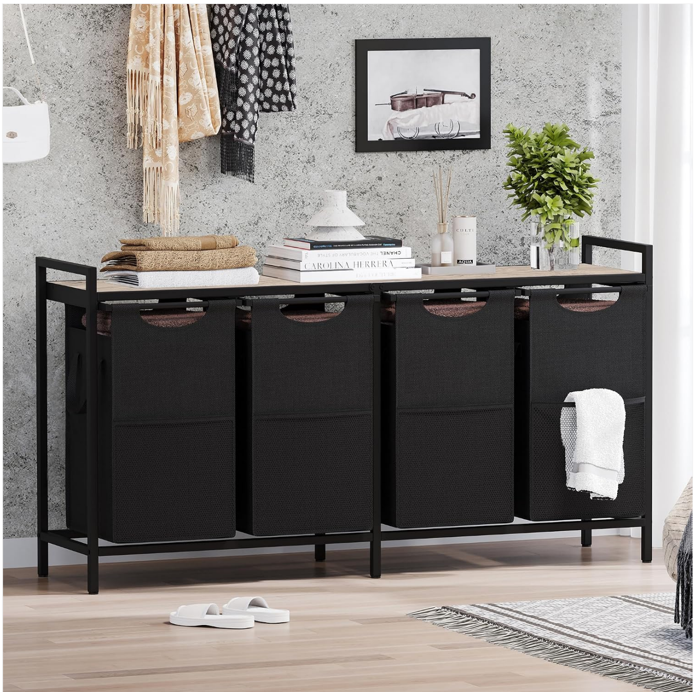
Image: The Heybly 4-Bag Laundry Hamper with Desktop Sorter, featuring a greige finish and black bags, positioned in a modern room setting, showcasing its organizational capabilities.