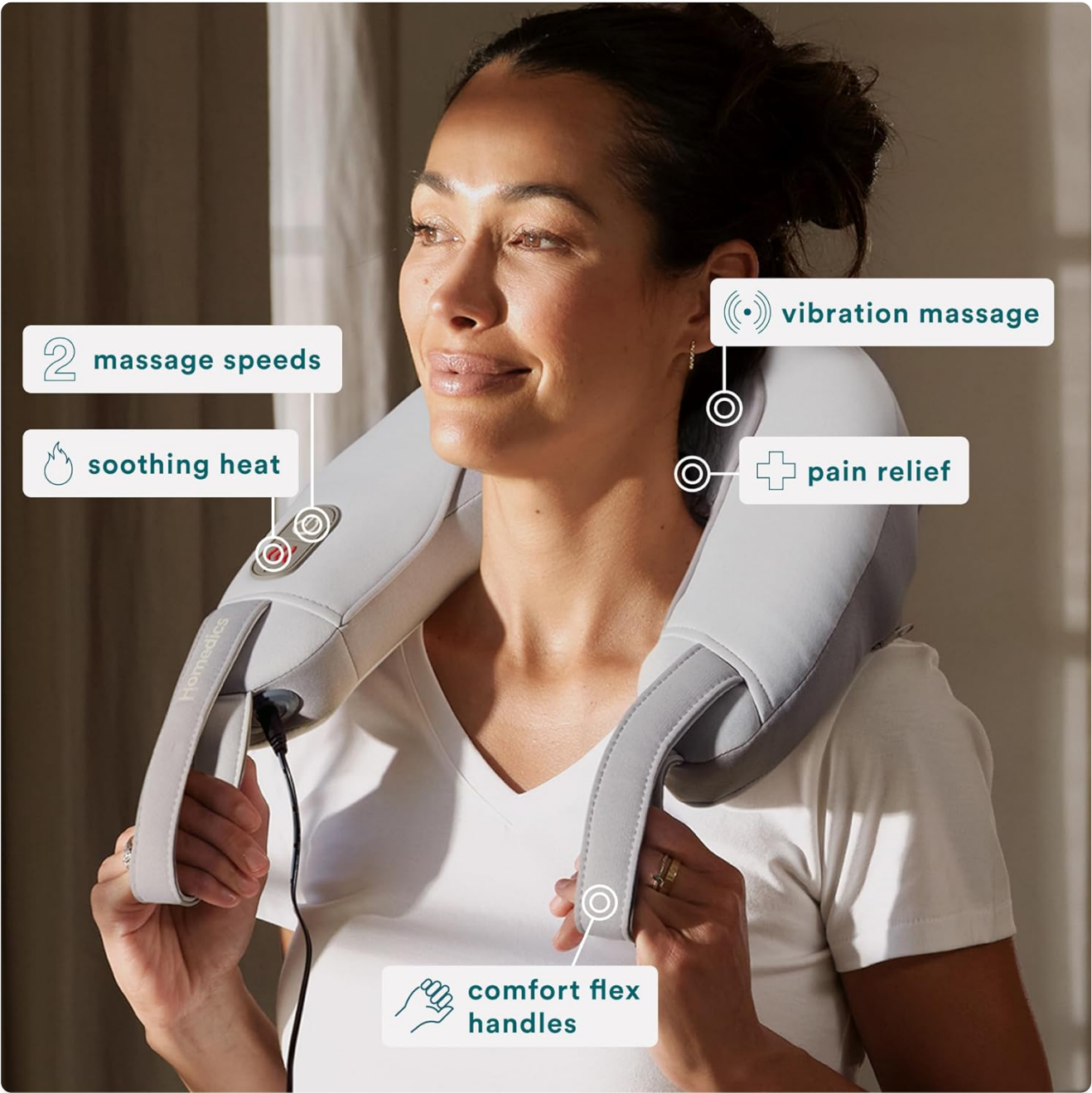
Image: A woman wearing the HoMedics neck massager, with visual callouts pointing to "vibration massage," "soothing heat," "pain relief," and "comfort flex handles," illustrating the device's main functions and components.

handles. Pulling tighter increases the pressure and intensity of the massage.