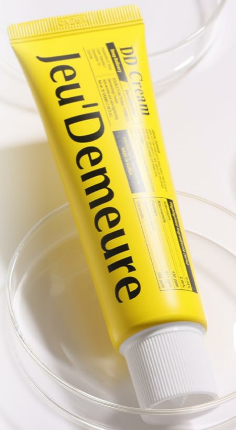
Image: Application steps for JEU'DEMEURE DD Cream.

* If used after Lifting kit, it is recommended to wait at least 30 mins afterwards.