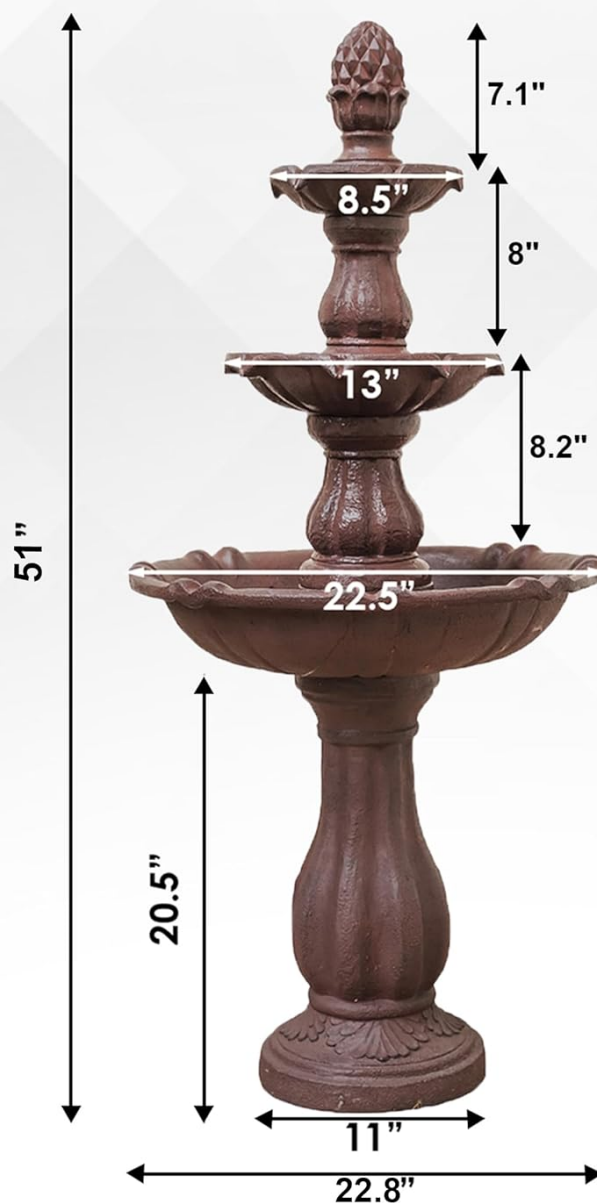
Figure 6: Diagram illustrating the dimensions of the 51-inch tall XBrand 3-Tier Water Fountain.