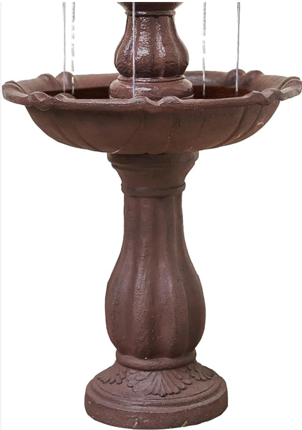
Figure 1: The XBrand 3-Tier Water Fountain in brown, showcasing its design and water flow.