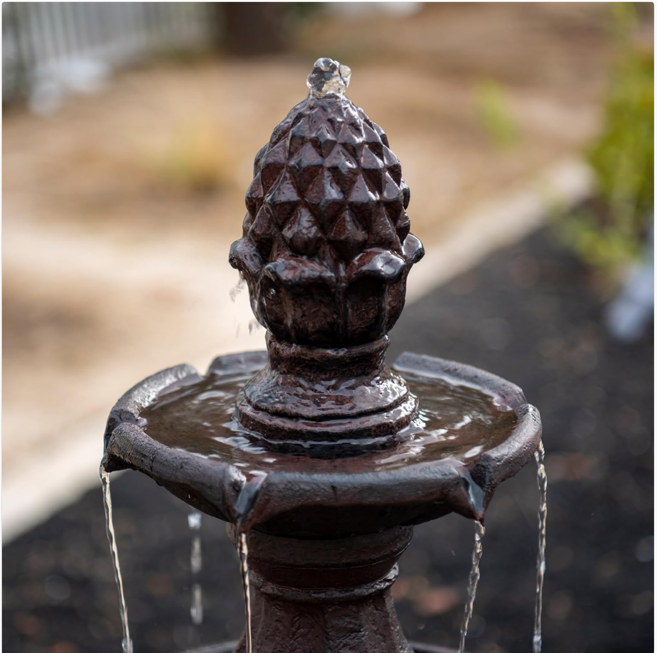
Figure 5: Detailed view of water flowing into one of the basins of the XBrand 3-Tier Water Fountain.