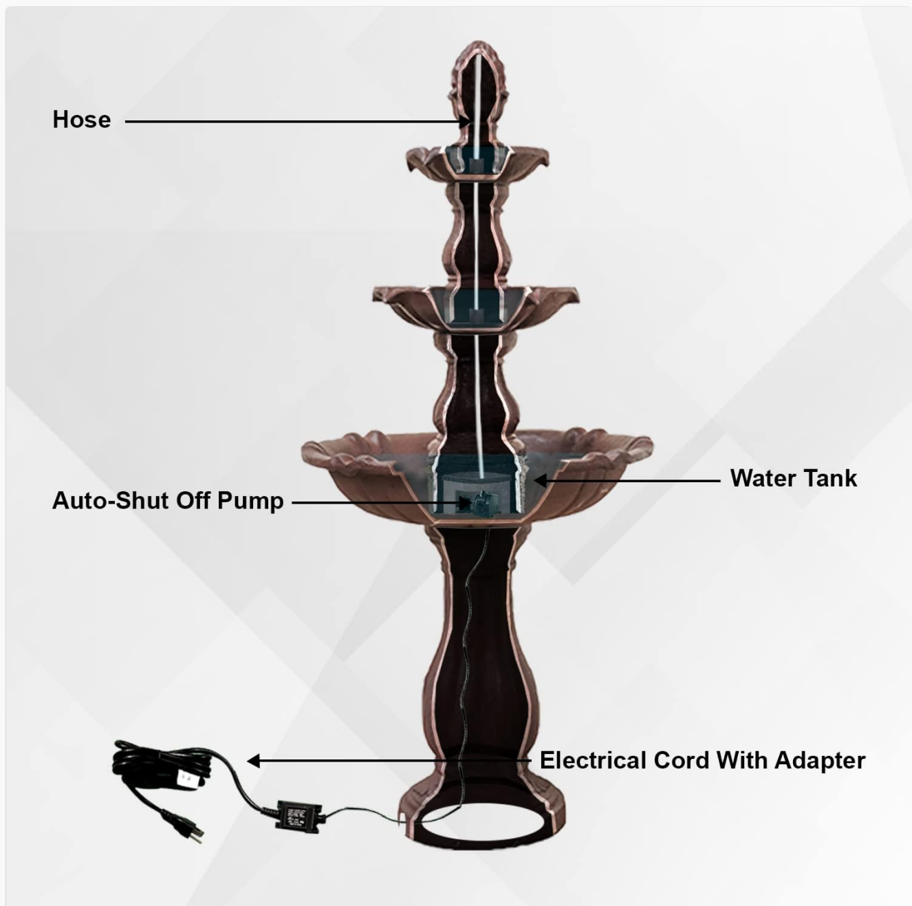
Figure 2: Exploded view diagram showing the fountain's main components: hose, auto-shut-off pump, water tank, and electrical cord with adapter.