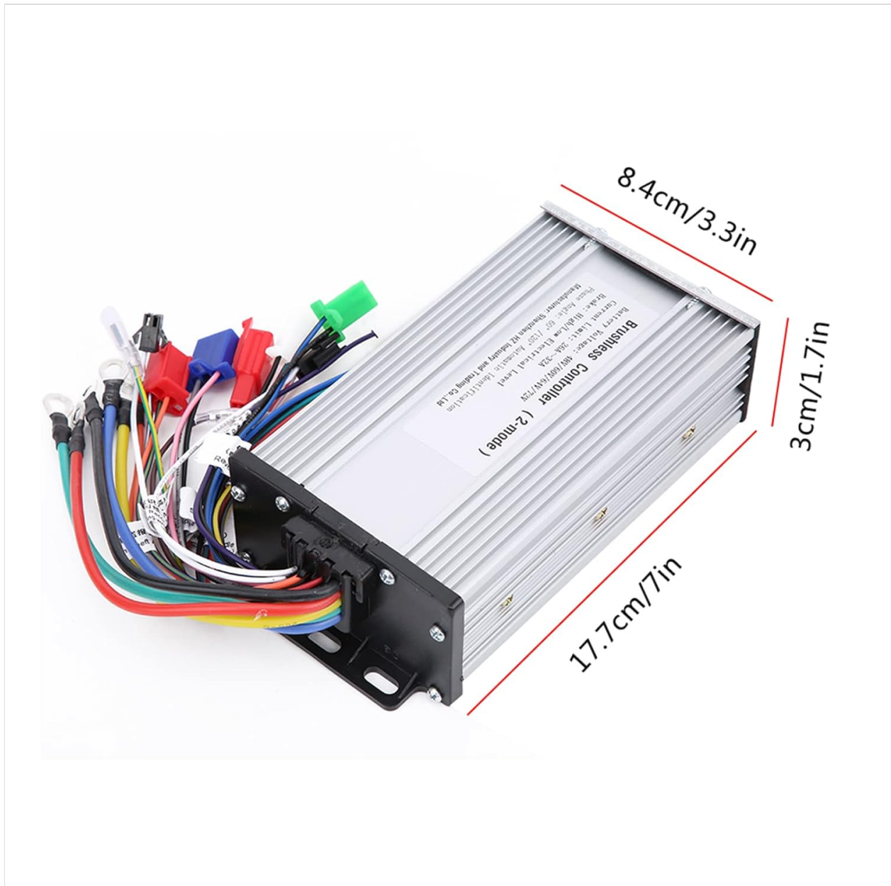
Image: Dimensions of the Pissante Brushless Motor Controller, showing its length, width, and height.