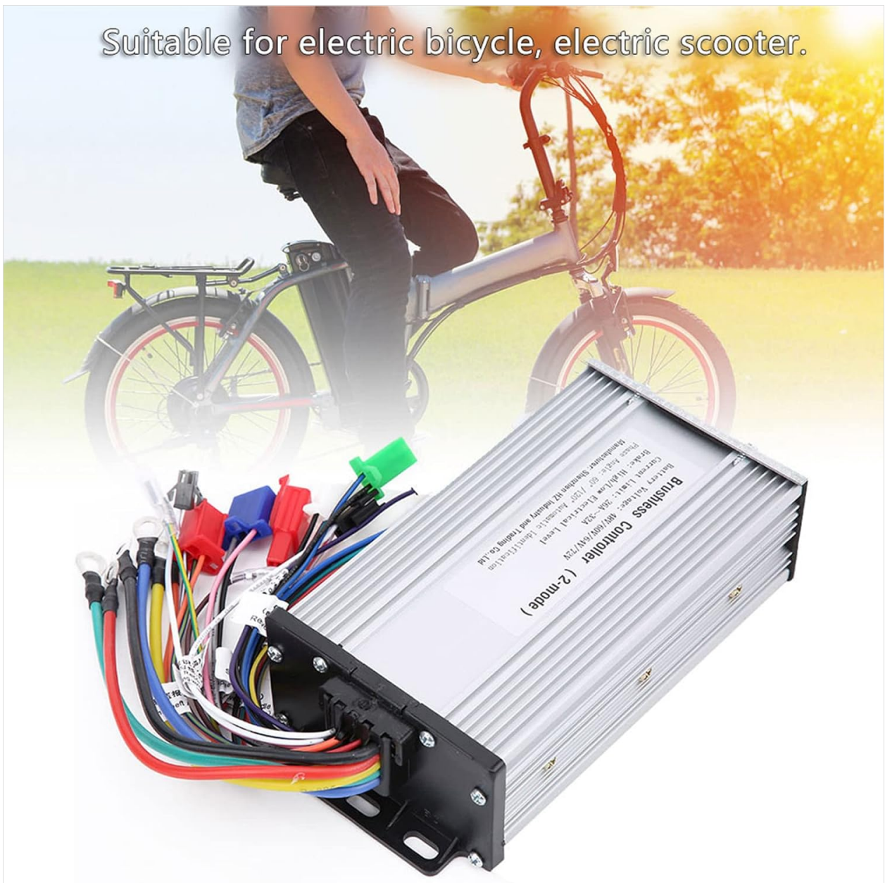
Image: The Pissente Brushless Motor Controller shown in context with an electric bicycle, illustrating its application.

Suitable for electric bicycle, electric scooter.