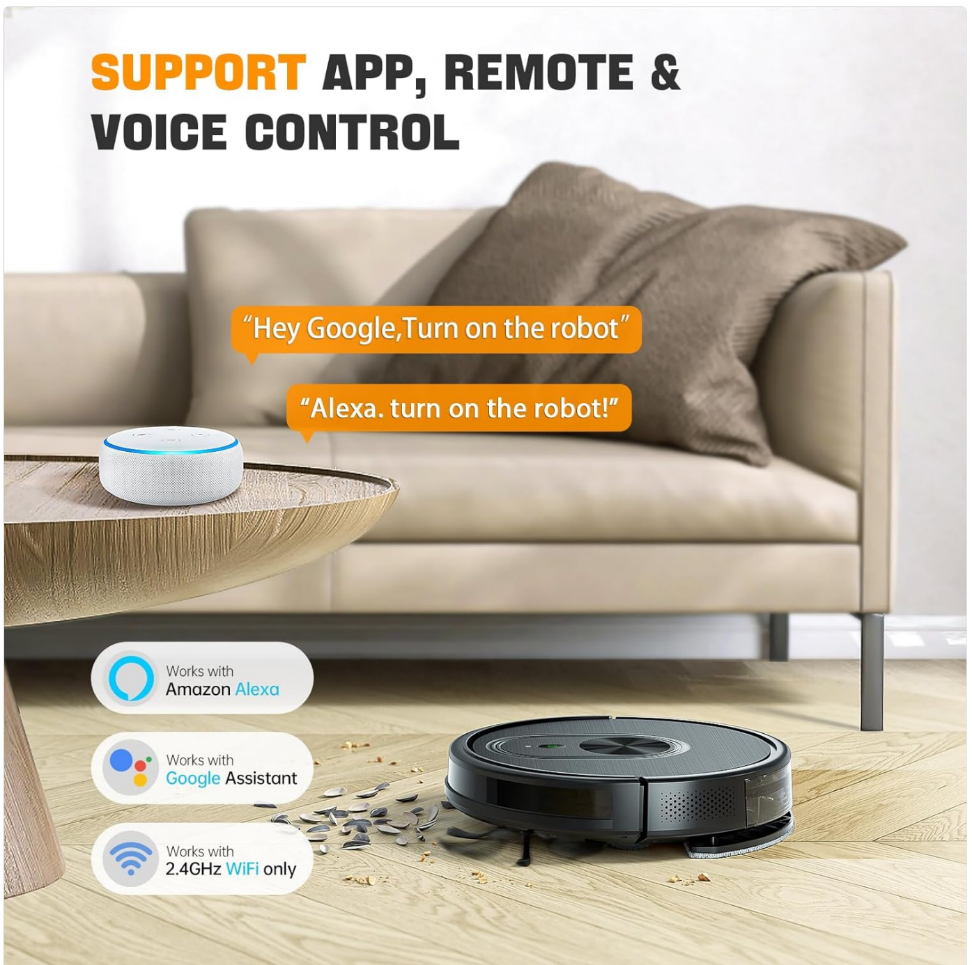
Figure 4: Illustrates the various control methods for the robot vacuum, including the smartphone app, remote control, and voice assistants like Amazon Alexa and Google Assistant.