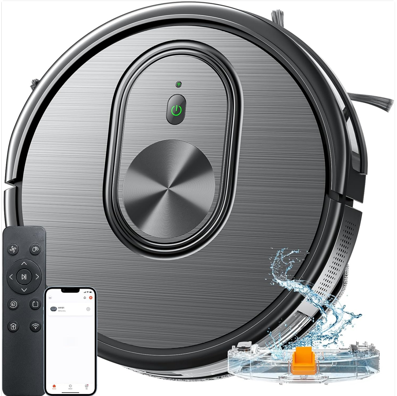
Figure 1: XIEBro Robot Vacuum and Mop Combo HR101, showing the main unit, remote control, and smartphone app interface.