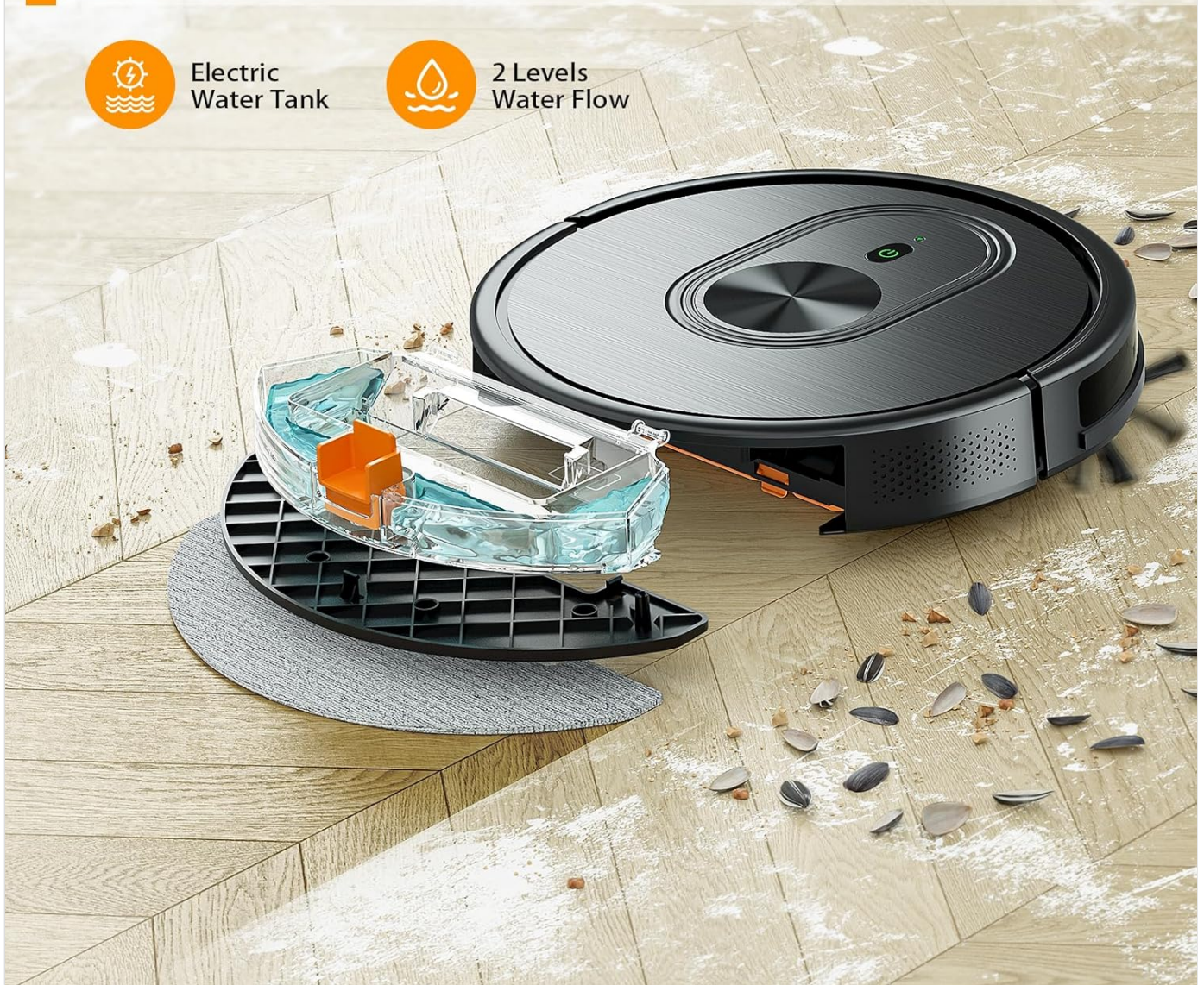
Figure 3: Exploded view of the robot vacuum's water tank and dustbin, illustrating the 200ml micro-control water tank with two levels of water flow.