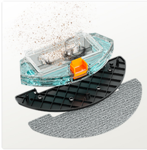
Figure 6: Visual guide for daily maintenance of the dustbin, including removal, emptying, and cleaning of filters.