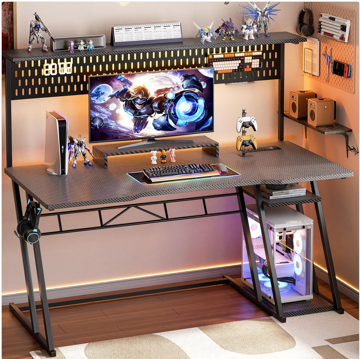
Figure 4: Integrated power outlets and USB ports for convenient charging.