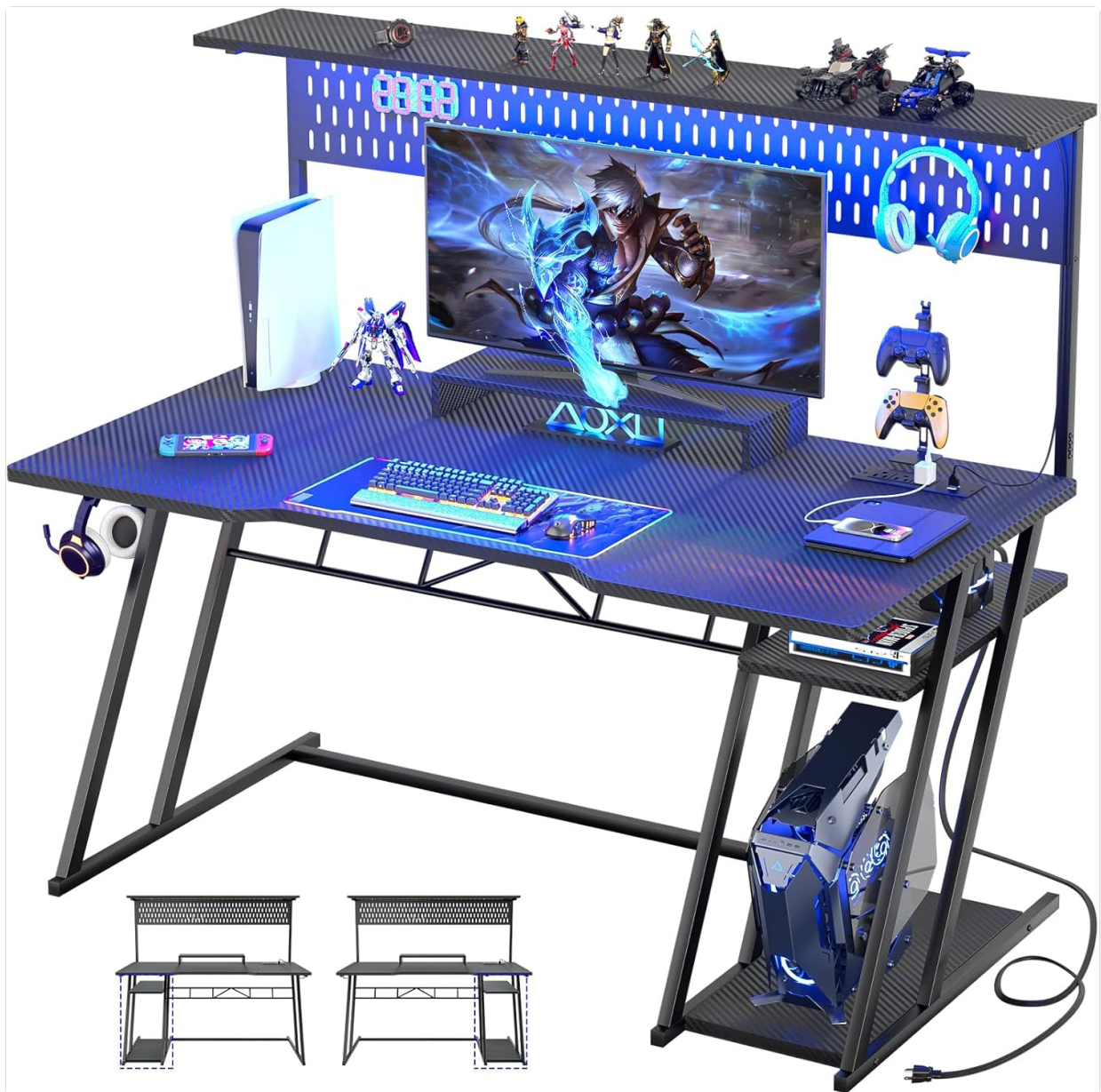
Figure 1: Fully assembled Armocity Gaming Computer Desk.