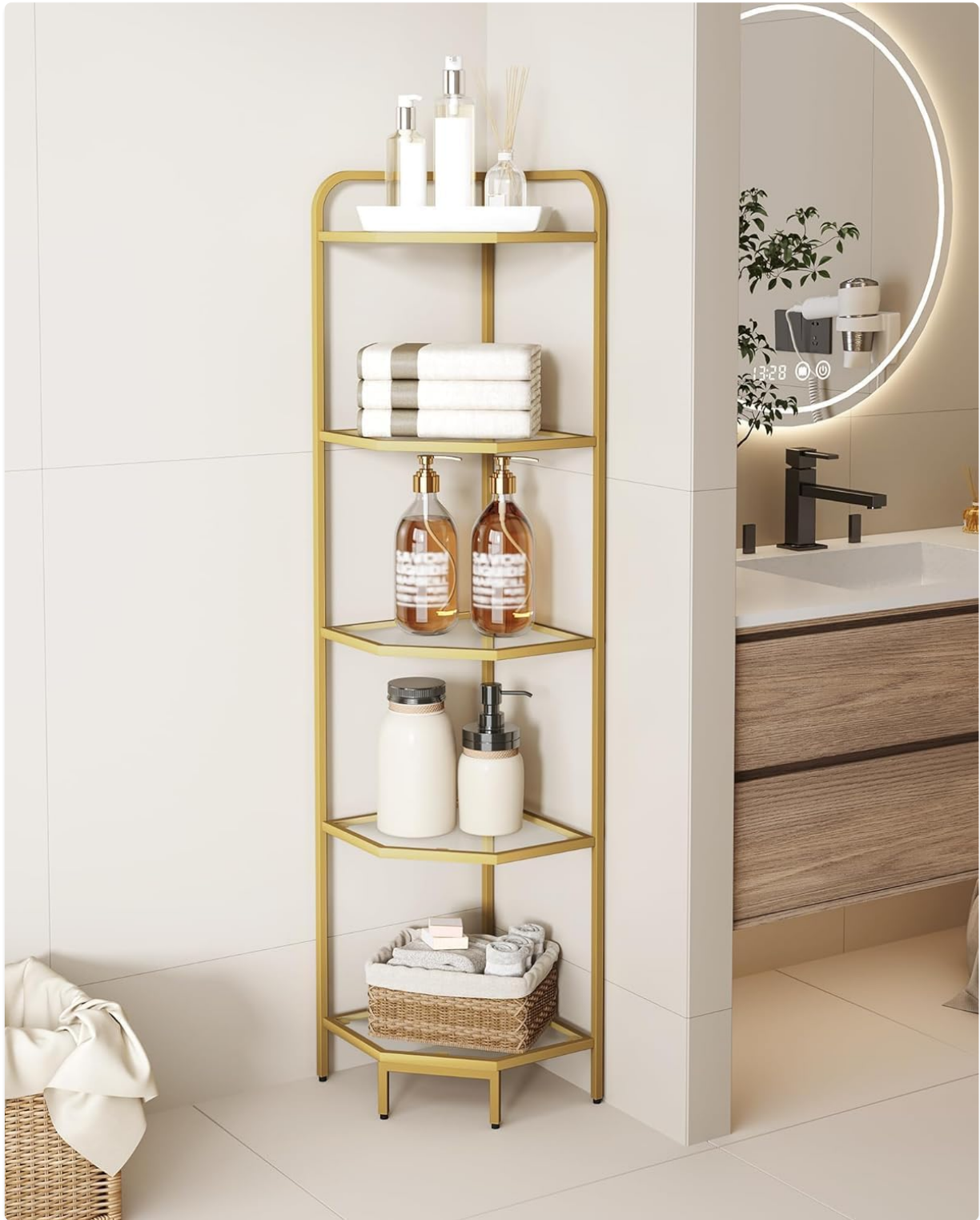
Image: The corner shelf functioning as a bathroom organizer, holding toiletries and towels.