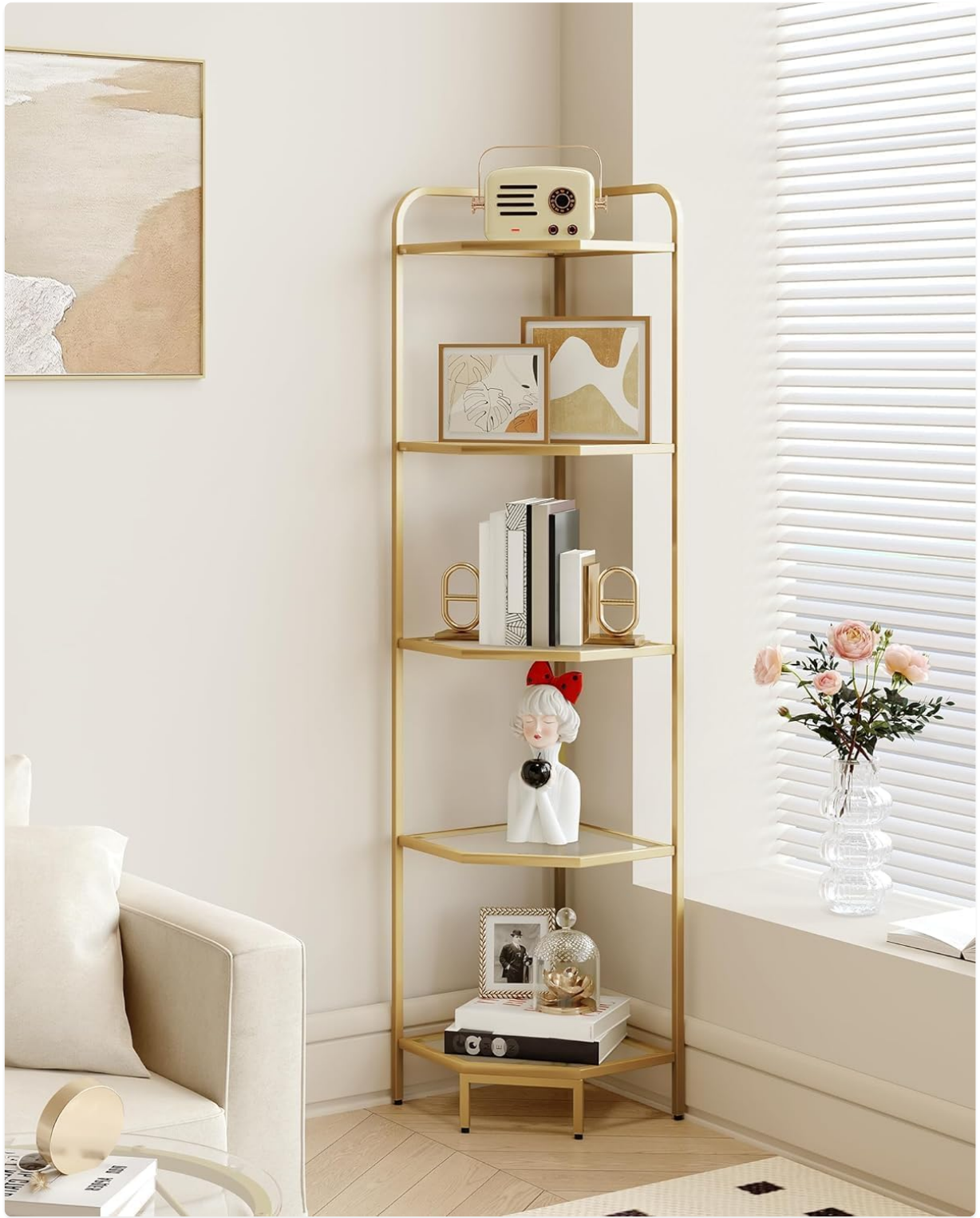
Image: Detail of the 90-degree design, ensuring a snug fit into room corners.