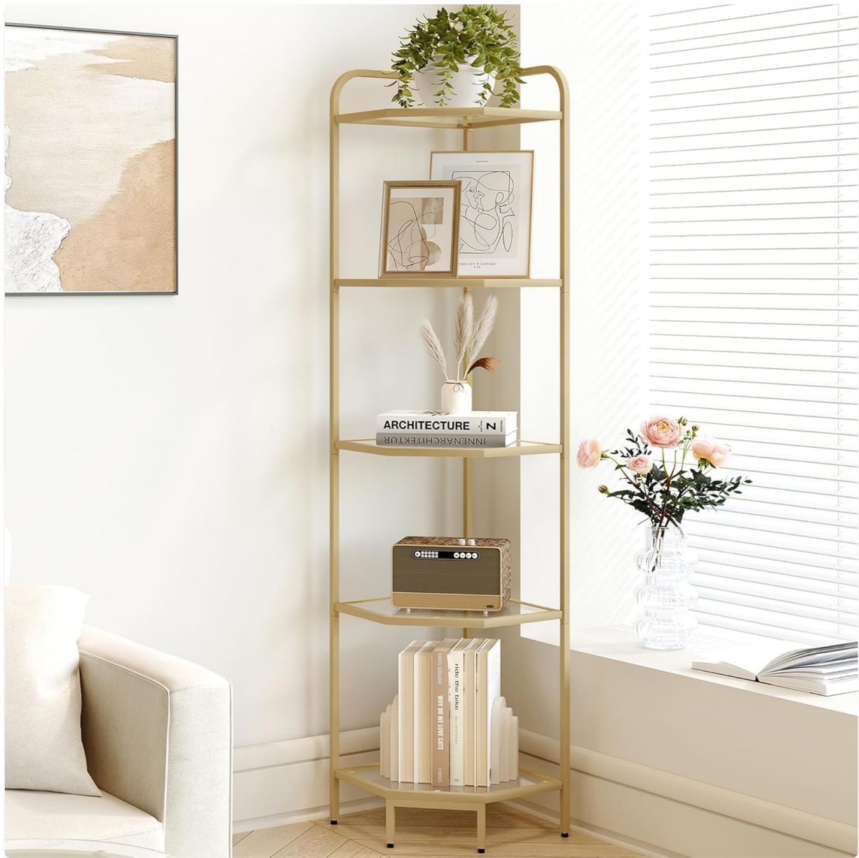
Image: The Hzueneri 5-Tier Gold Corner Shelf, showcasing its design and five tempered glass shelves.