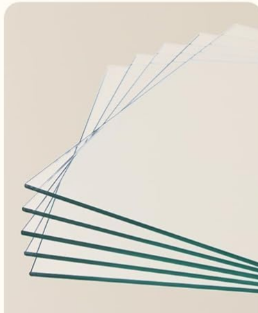
Robust Tempered Glass