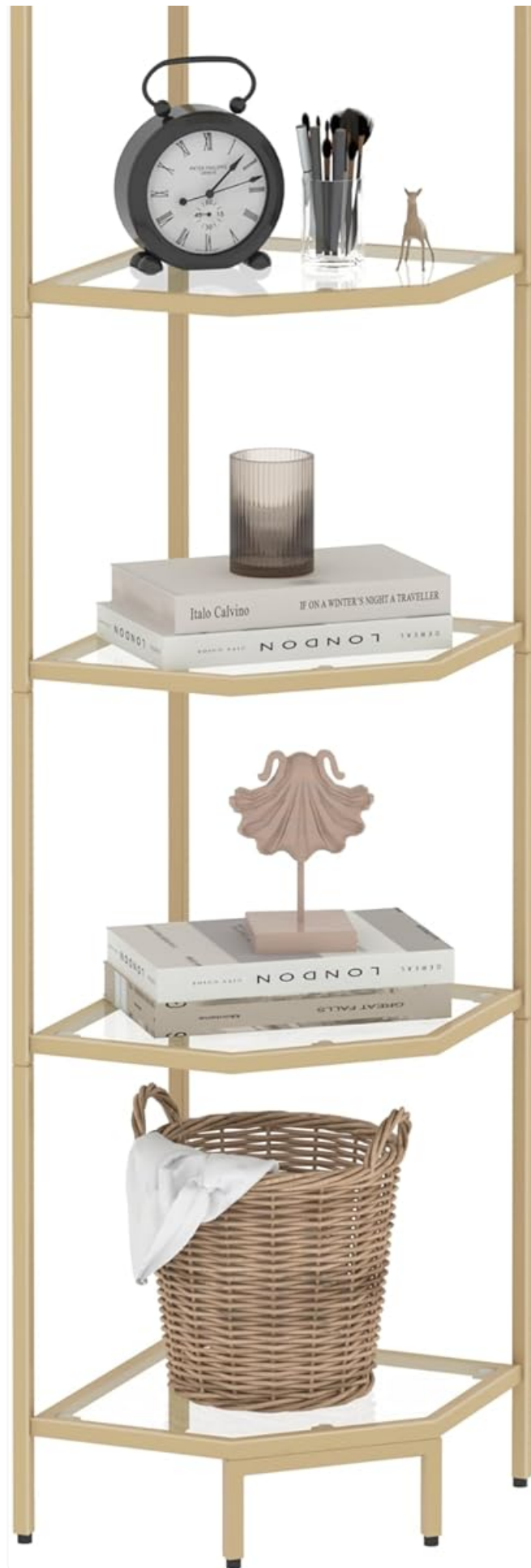
Image: The corner shelf styled with decorative items, books, and a plant, highlighting its display potential.