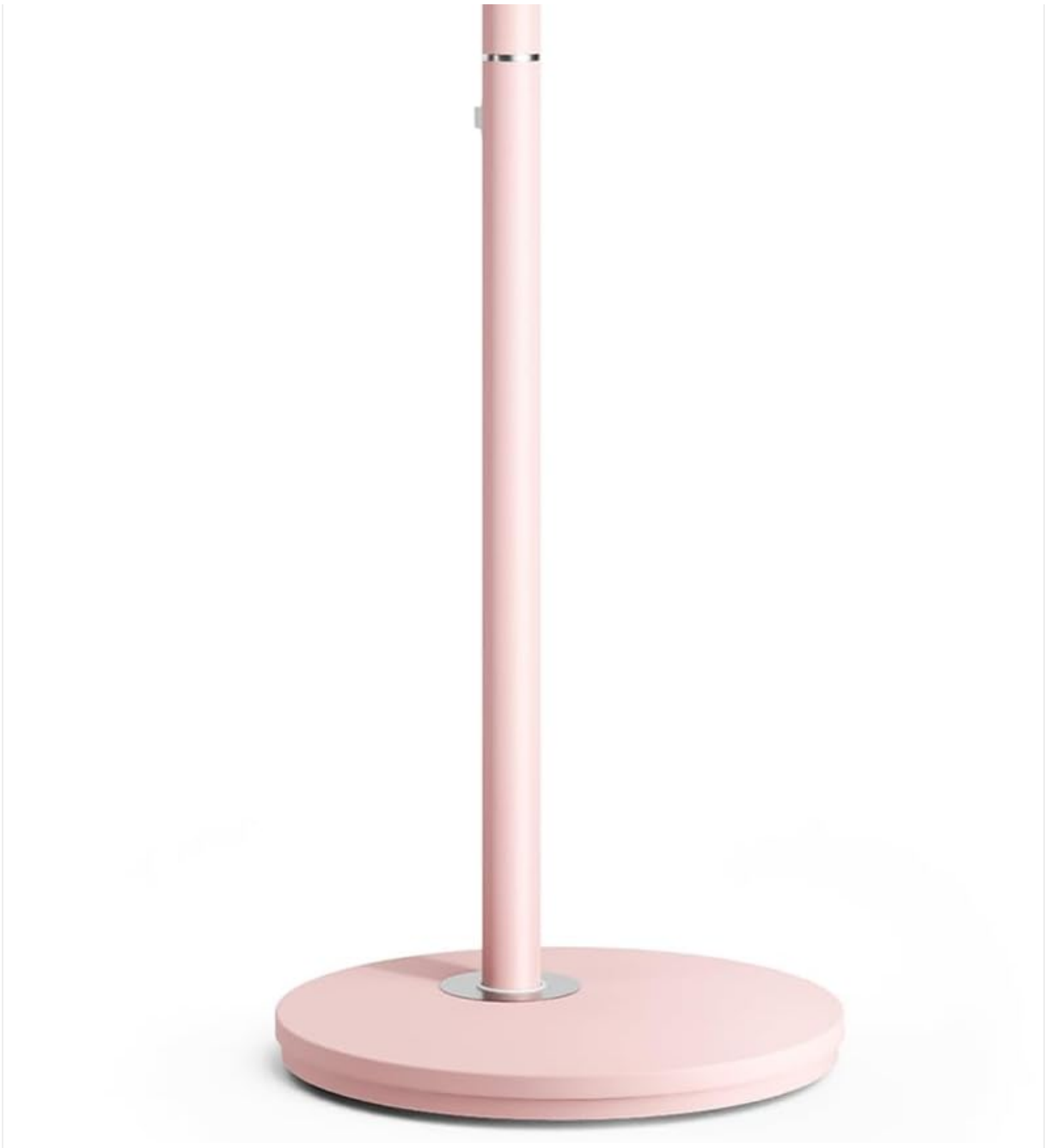
Image: The FITUEYES Master Series V2 Rolling TV Cart in pink, showcasing its minimalist design with a television mounted.