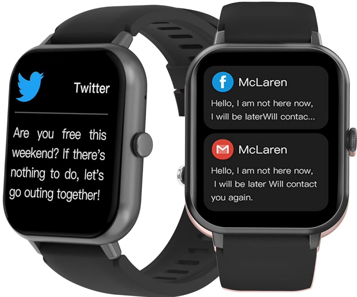
Image: Front and side view of the DOVIICO ZL54C Smart Watch, showcasing its display and physical button.