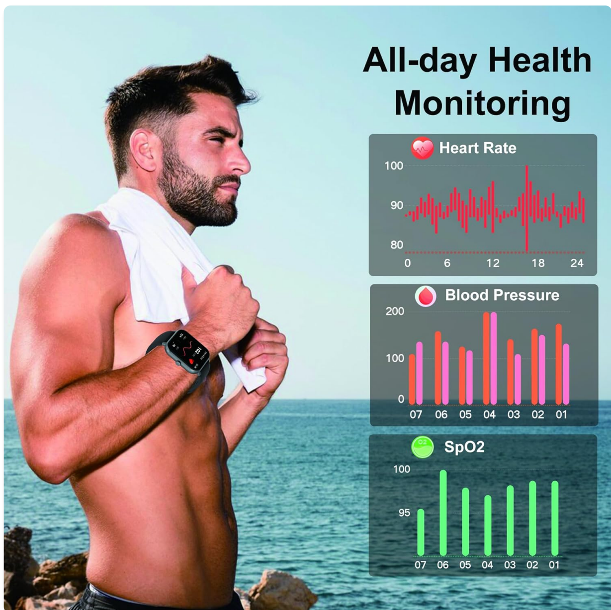
Image: A user wearing the smart watch, with the display showing graphs for Heart Rate and SpO2 monitoring.