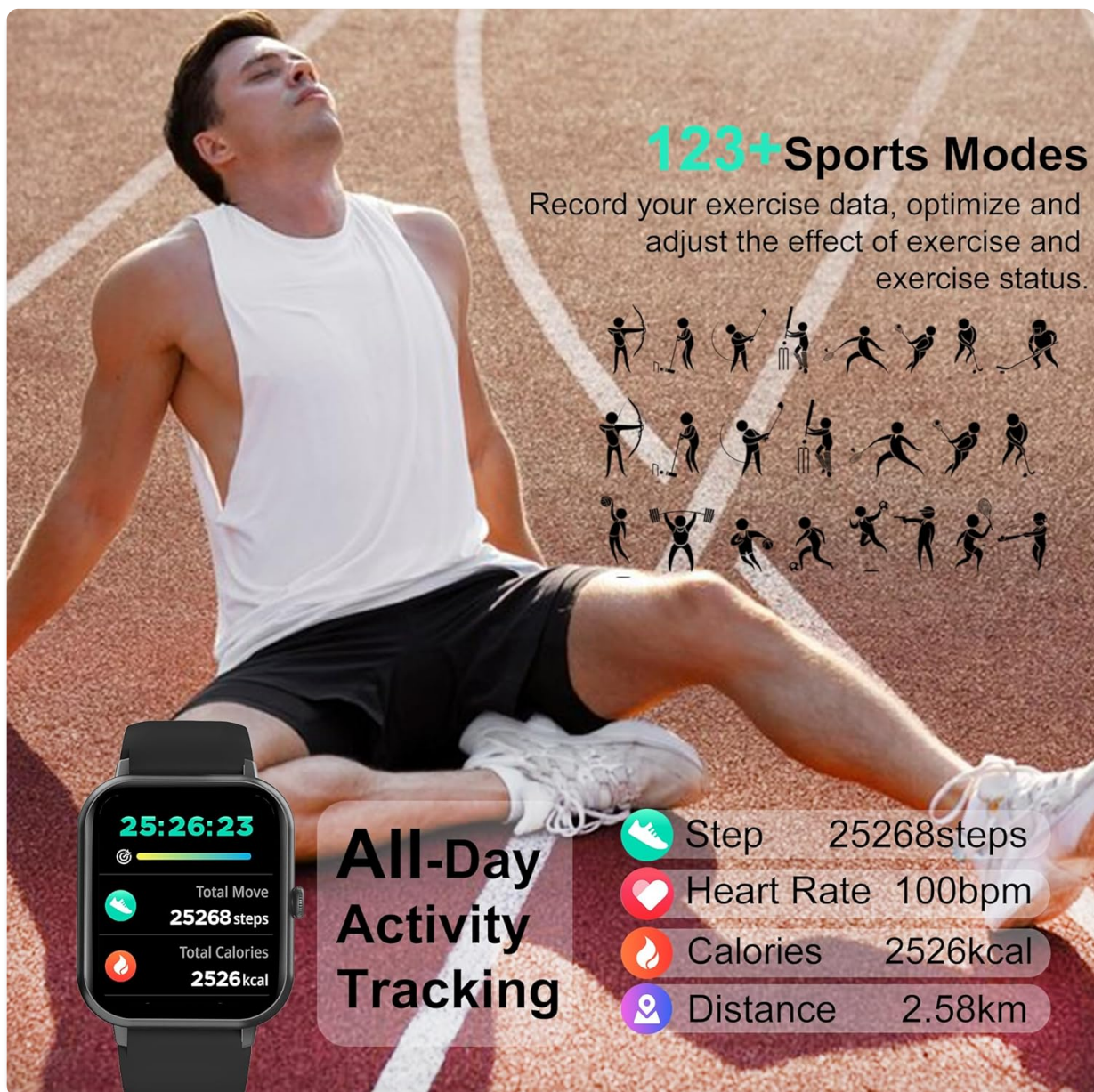
Image: The watch showing "All-Day Activity Tracking" with steps, heart rate, calories, and distance, surrounded by icons representing over 123 sports modes.