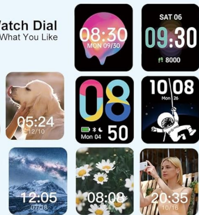
Image: The watch display showing battery life, screen dimensions, and examples of customizable watch faces.