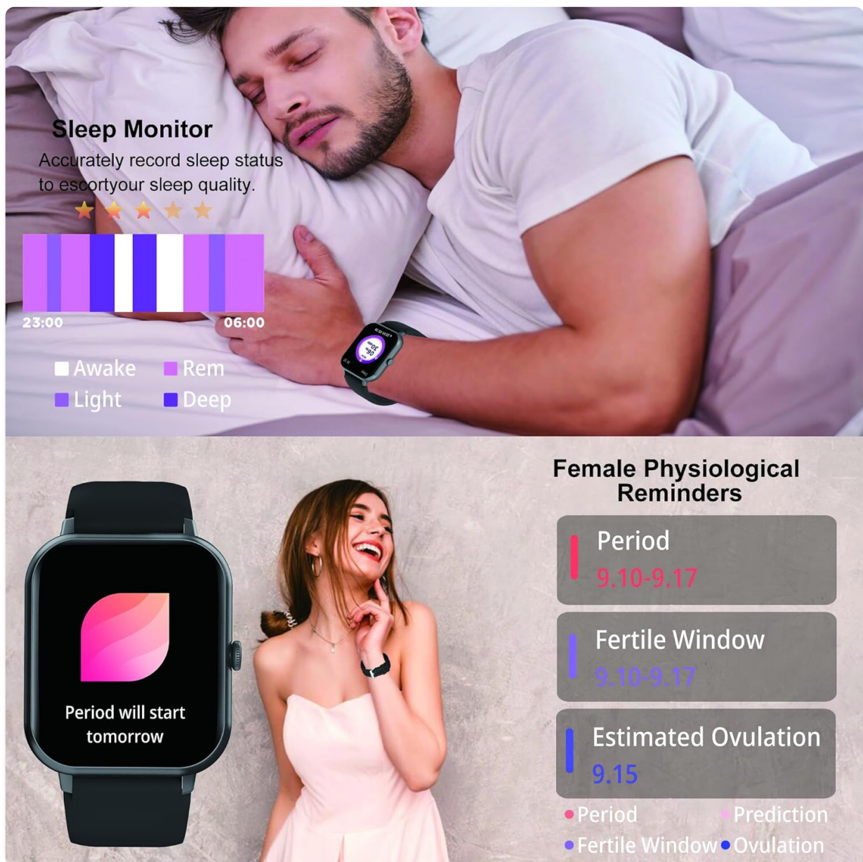
Image: The watch screen showing sleep duration and quality, alongside female physiological cycle tracking information.