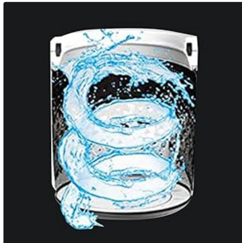
Image 4: Visual representation of 6th Sense Technology adapting wash settings.

The advanced 6th Sense Technology automatically senses the wash requirements and intuitively adapts the wash cycle to deliver a perfect wash every time, optimizing water and energy usage.