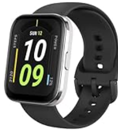
Image: Amazfit Bip 5 Smart Watch highlighting 24-hour health monitoring features: Heart Rate, Blood-oxygen, and Stress tracking.