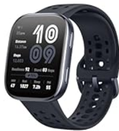
Image: Amazfit Bip 5 Smart Watch showing GPS tracking for an outdoor cycling workout, indicating distance and average pace.

Track your activities with over 120 sports modes, including walking, running, treadmill, rowing, and more. The built-in GPS ensures accurate tracking of steps, distance, and calories burned, even without your phone.