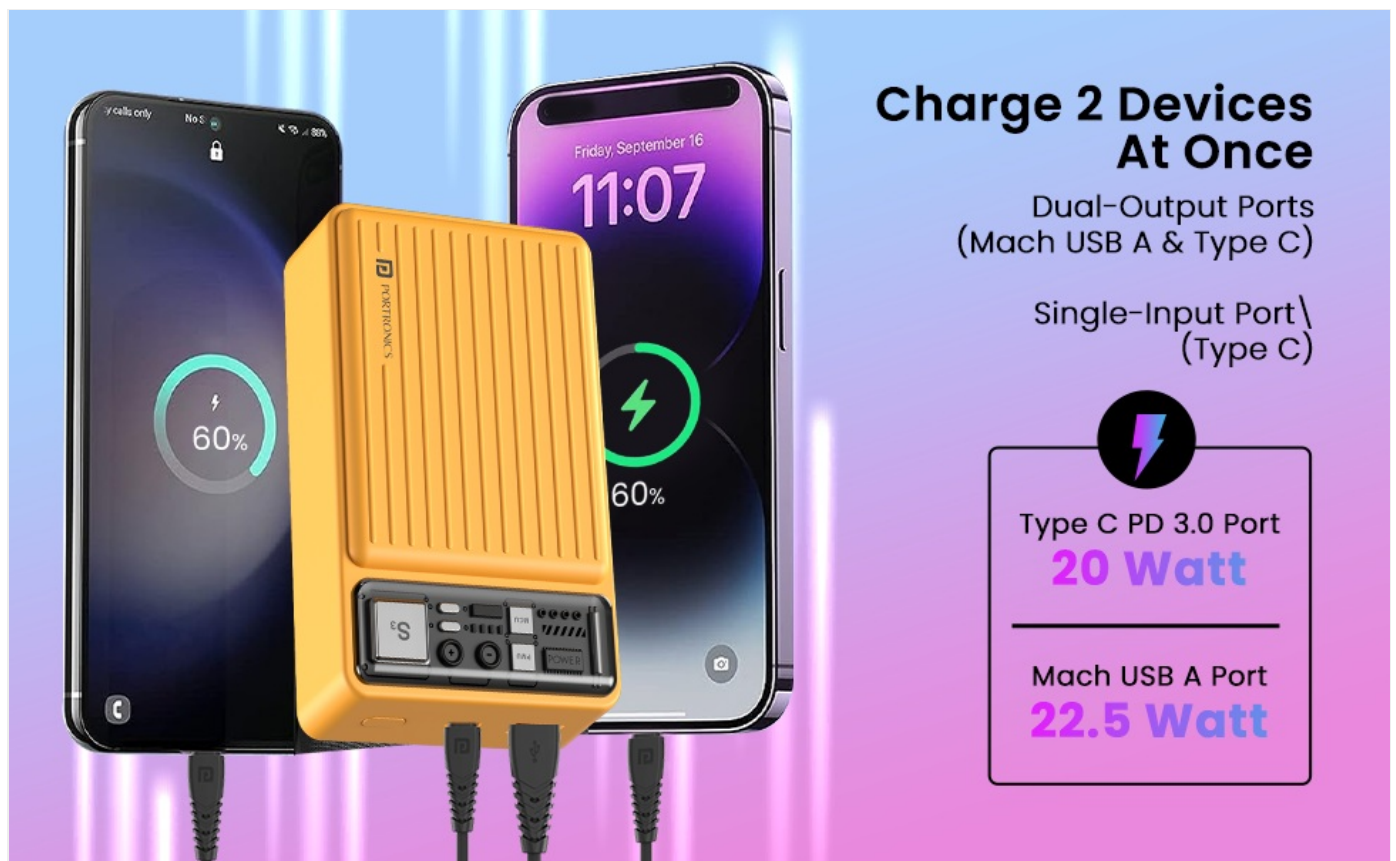
Image: The power bank connected to and charging two smartphones simultaneously, demonstrating its dual output capability.