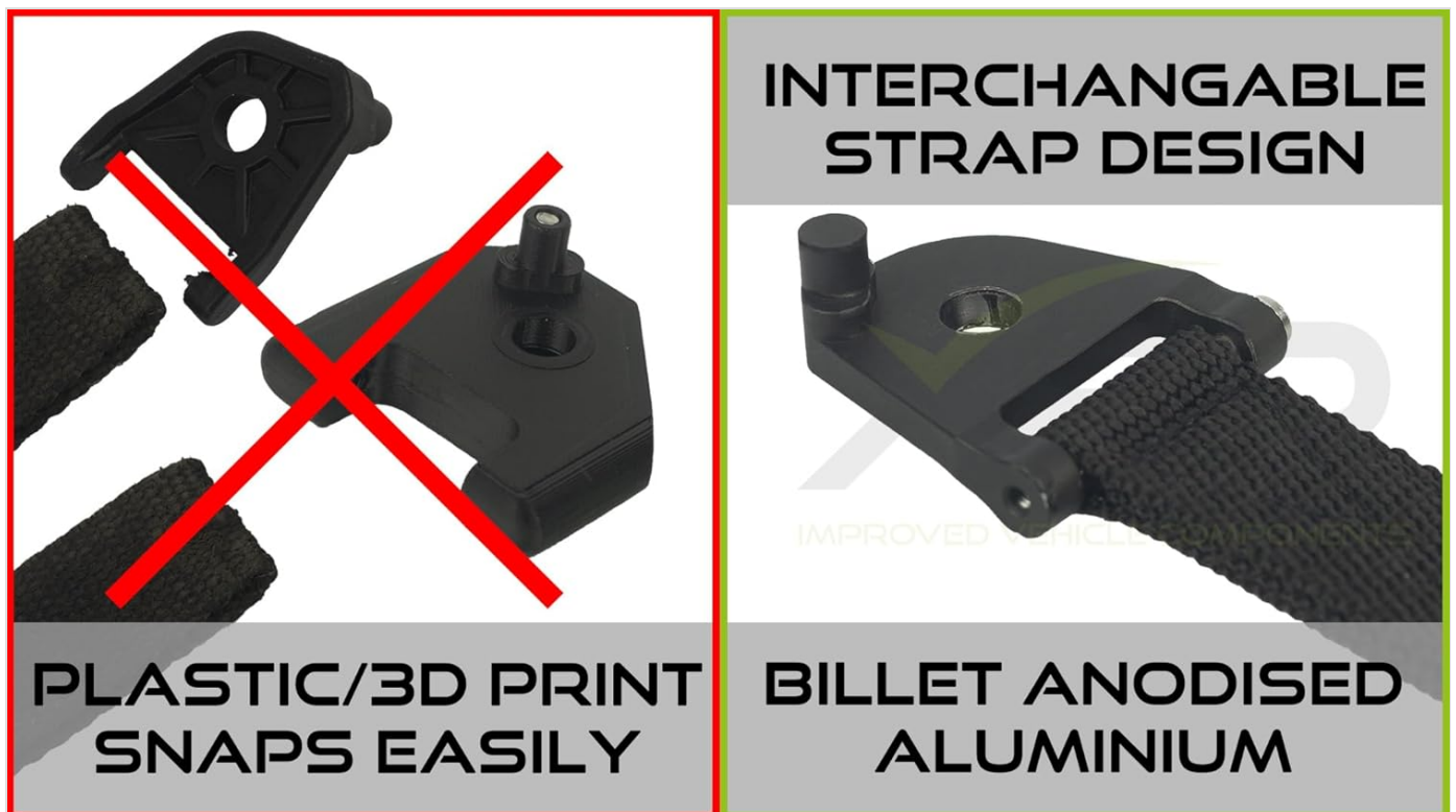
Image 3: Comparison showing the original plastic/3D printed lever (left) which snaps easily, versus the new billet anodized aluminum lever (right) with an interchangeable strap design, highlighting improved durability.