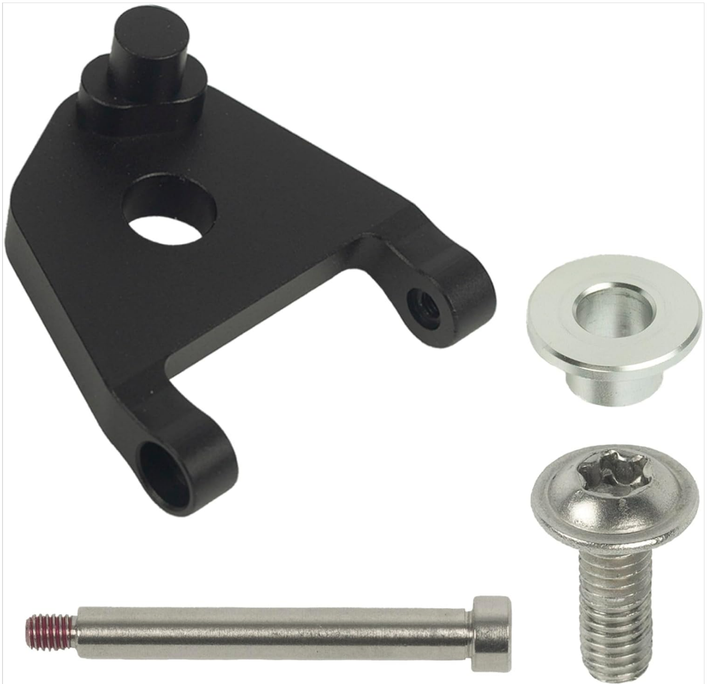
Image 1: All components included in the kit. This includes the black anodized aluminum lever, a replacement pivot screw, a billet anodized aluminum pivot bush, and a strap retaining bolt with locking compound coated thread.