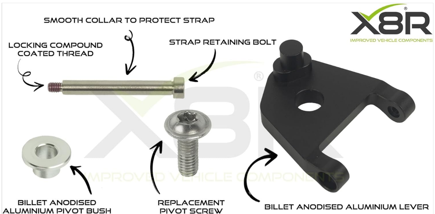
Image 2: Detailed diagram illustrating each component: the billet anodized aluminum lever, replacement pivot screw, billet anodized aluminum pivot bush, and strap retaining bolt with locking compound coated thread. Note the smooth collar designed to protect the strap.