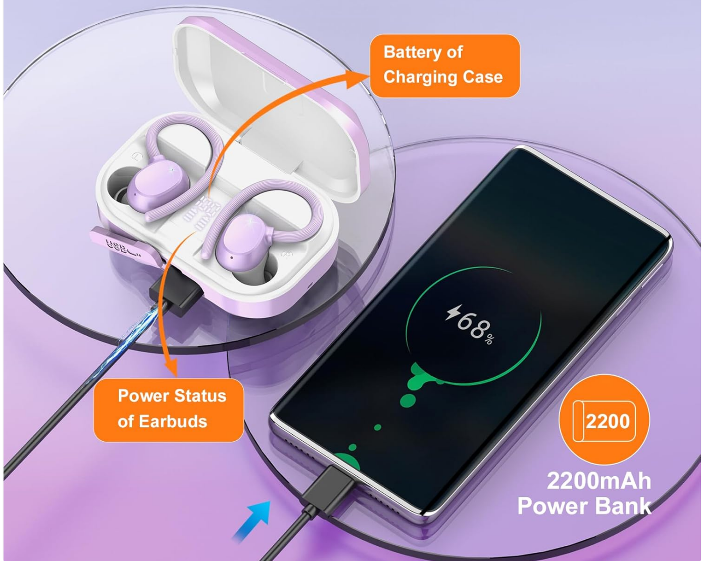
Image: The earbud charging case connected via USB-C to a smartphone, demonstrating its function as a 2200mAh emergency power bank.