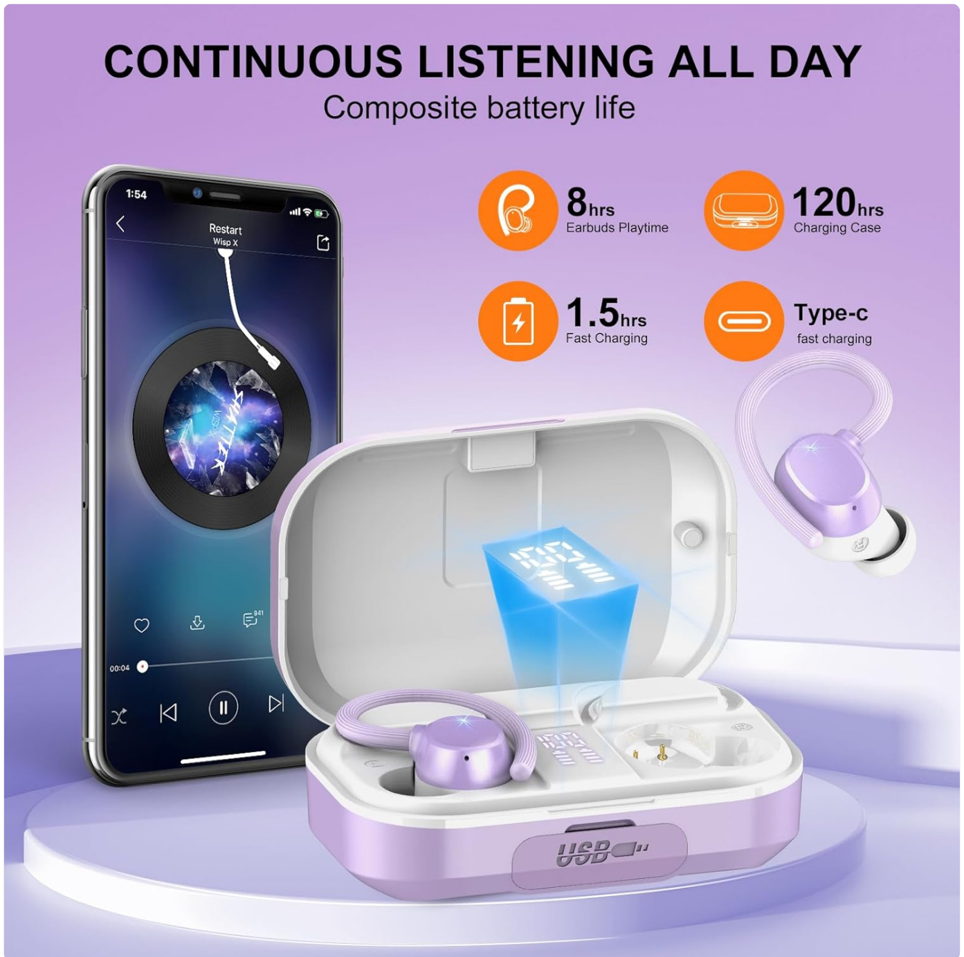
Image: The charging case displaying battery levels for both earbuds and the case, alongside icons indicating 8 hours of earbud playtime, 120 hours with the case, 1.5 hours fast charging, and USB-C charging.

The charging case also functions as a 2200mAh emergency power bank for mobile phones or other devices. Simply connect your device to the USB-A output port on the charging case using your device's charging cable.