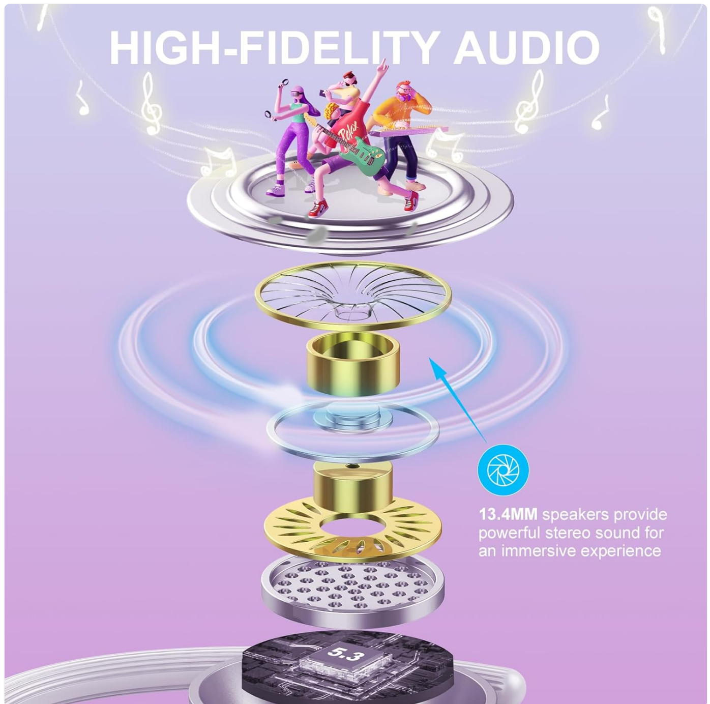
Image: An exploded diagram illustrating the internal components of the earbud, highlighting the 13.4mm dynamic driver for high-fidelity audio.

Familiarize yourself with the components of your POMUIC Wireless Earbuds.