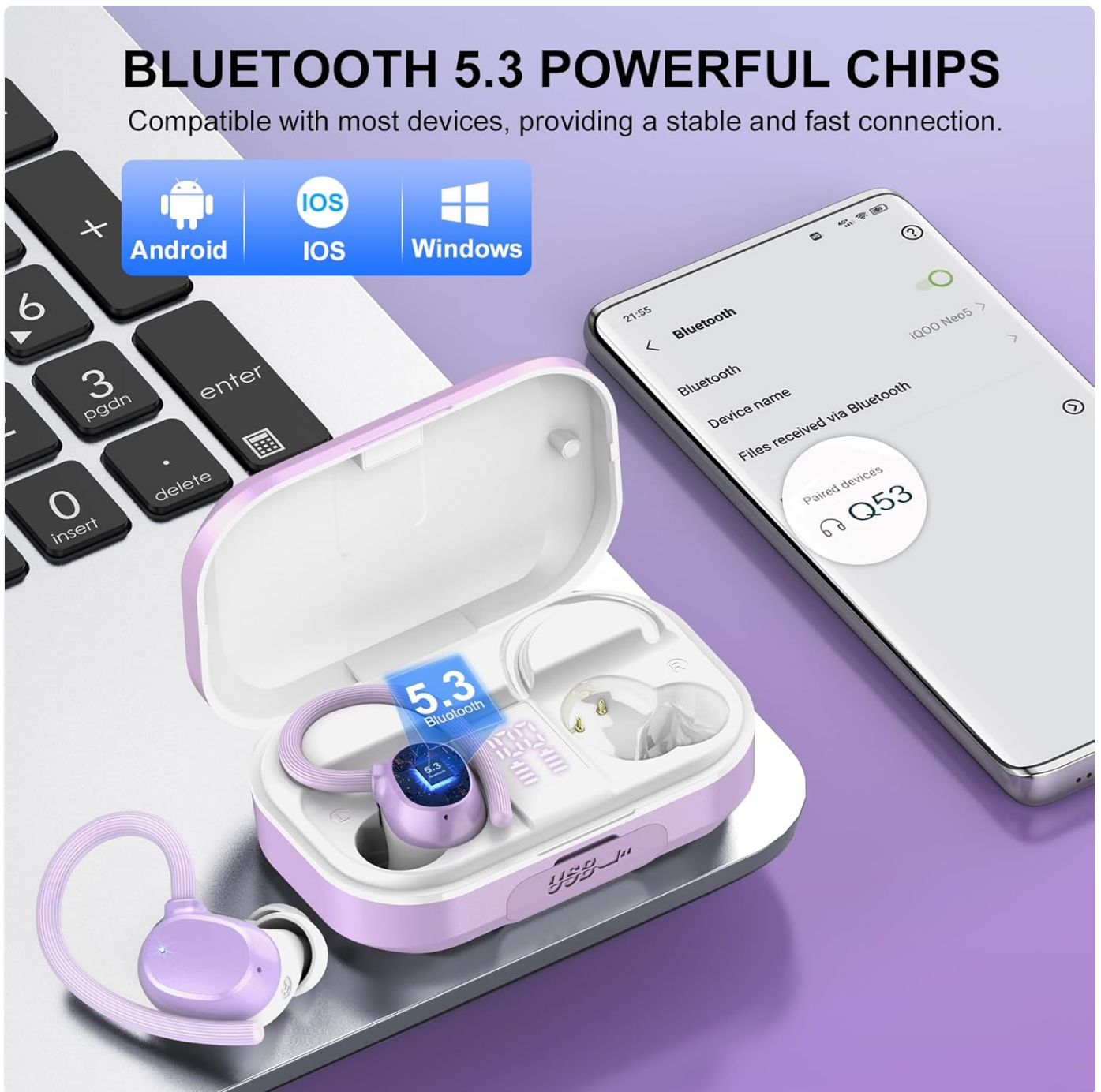
Image: A visual representation of the earbuds pairing with a smartphone, showing the "Q53" device name in the Bluetooth settings, compatible with Android, iOS, and Windows devices.