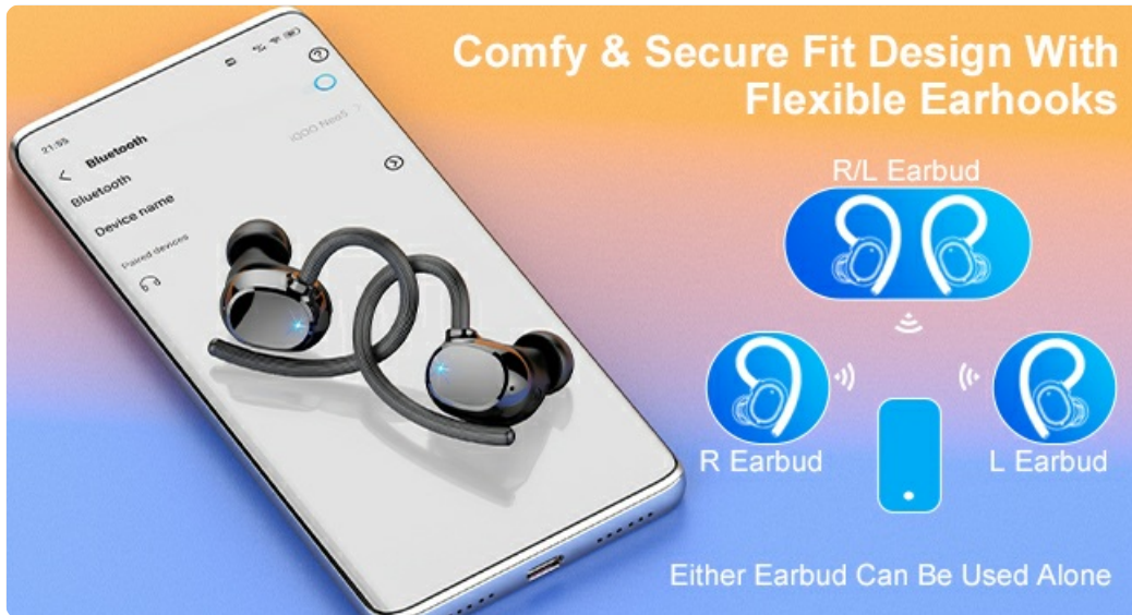
Image: A diagram showing how to wear the earbuds with flexible earhooks, illustrating that either the left or right earbud can be used independently.

The soft silicone ear hooks are designed to fit all ear shapes perfectly, ensuring your earphones stay comfortable and secure during sports and outdoor activities.