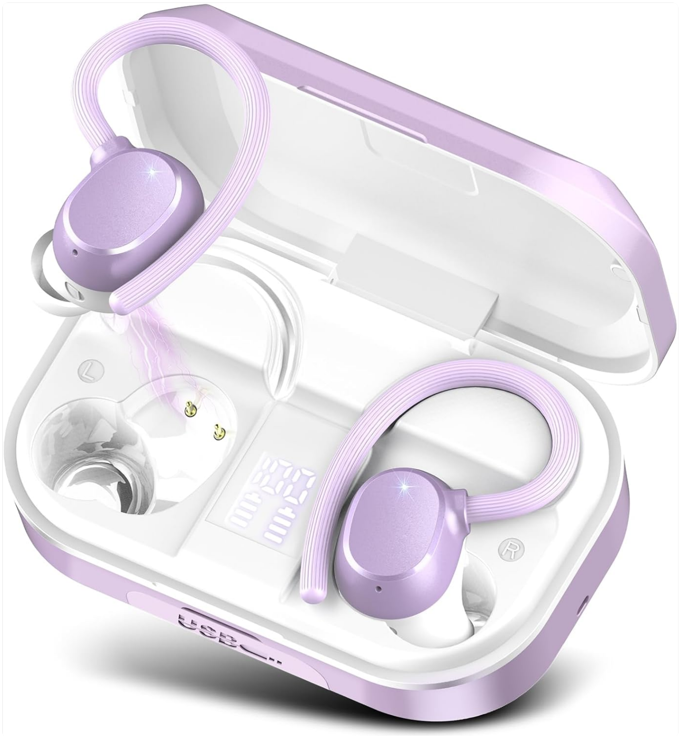
Image: The POMUIC Wireless Earbuds, purple in color, resting inside their open charging case, showcasing the earhook design and the digital display on the case.