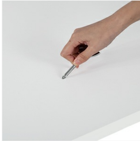
Image: A hand using a screwdriver to secure a component during the assembly process of the desk.