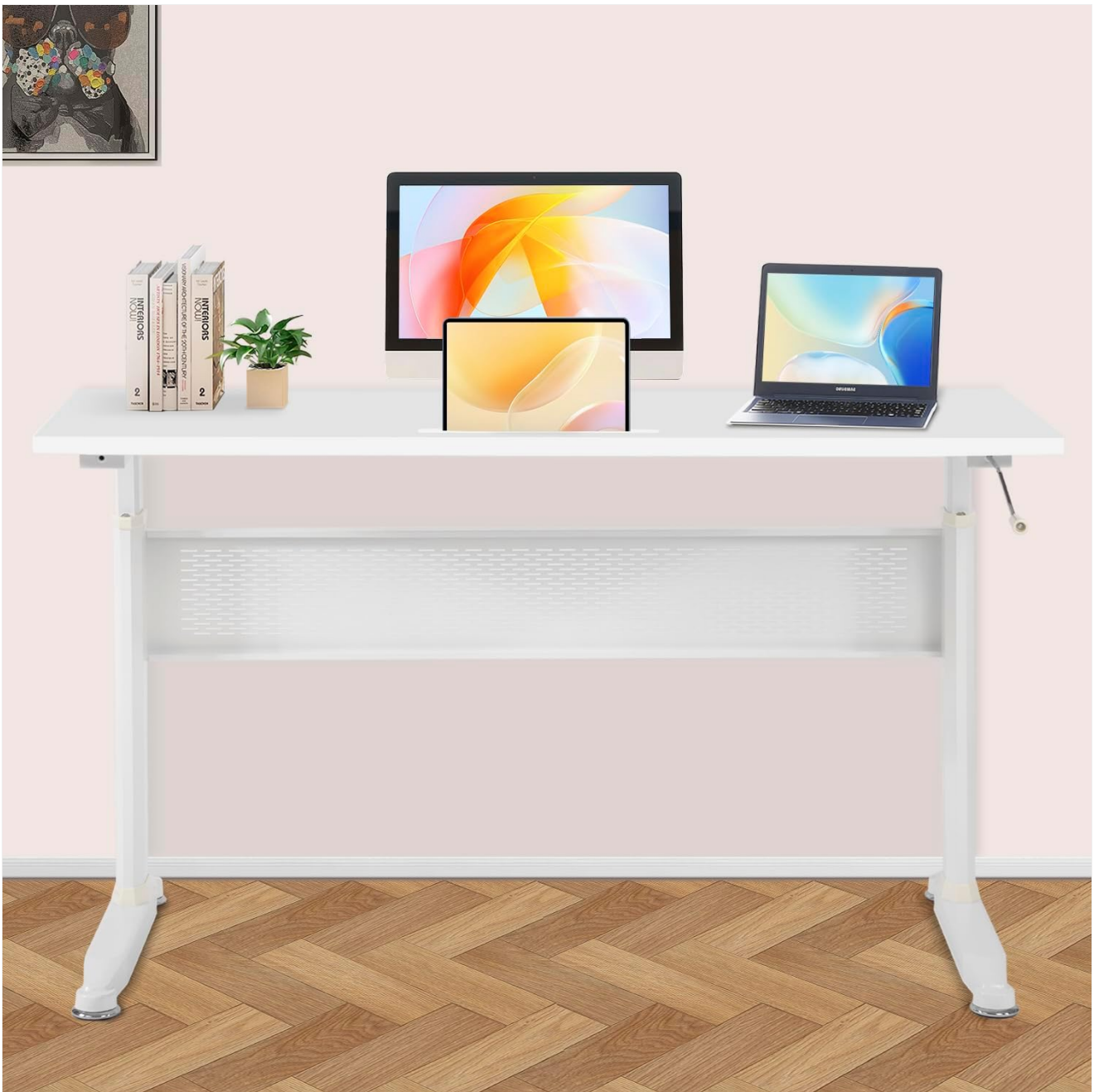
Image: The PayLessHere 47-inch Standing Desk, shown with two monitors, a laptop, and a plant, illustrating its large workspace capacity.