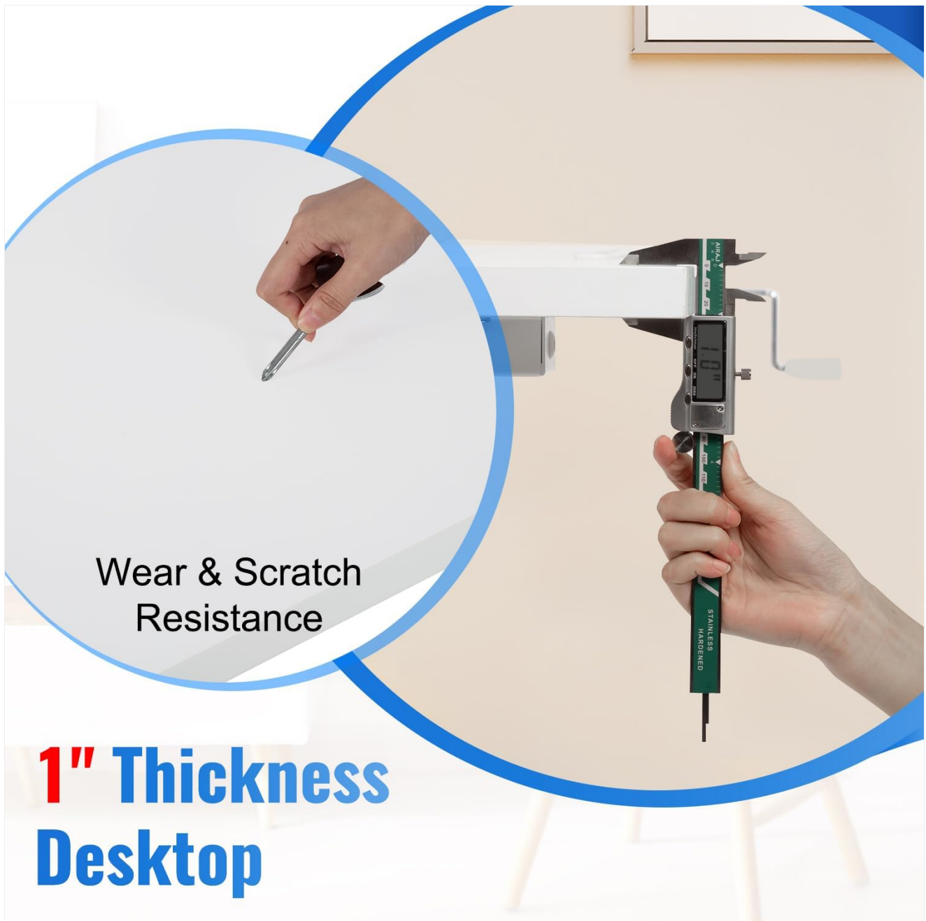
Image: A hand using a caliper to measure the desktop, highlighting its 1-inch thickness and wear/scratch resistance.