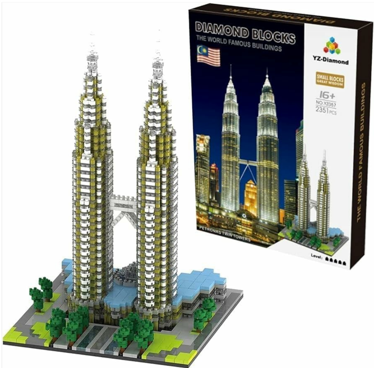
Image: The completed Petronas Twin Towers model, showcasing its intricate design and scale.