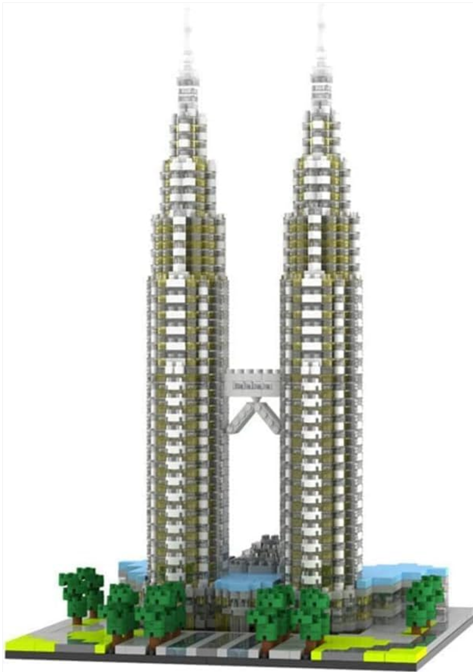
Image: The completed model from a different angle, suitable for display.