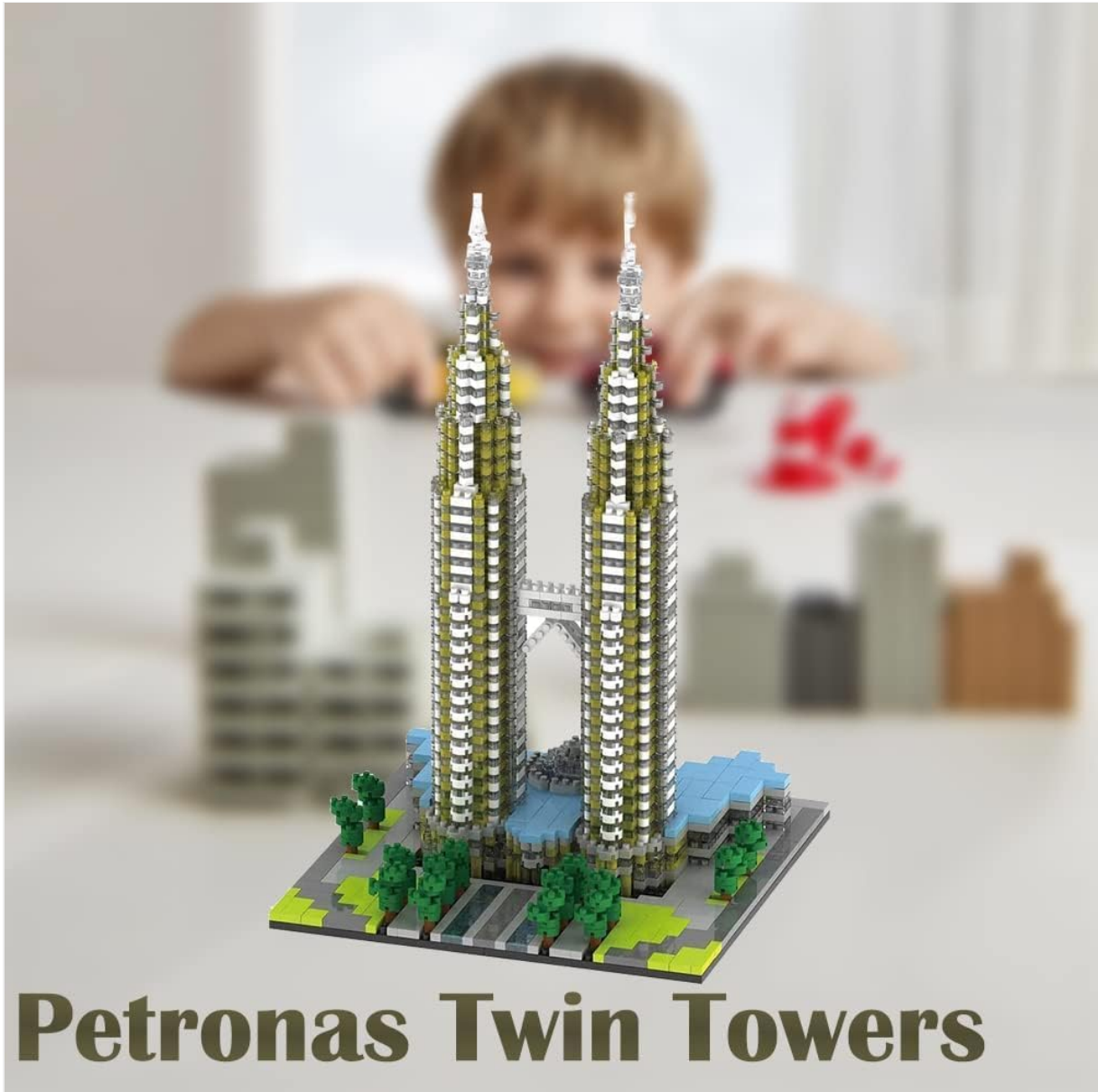
Image: A close-up of the assembled Petronas Twin Towers model, highlighting the fine details achieved with micro blocks.