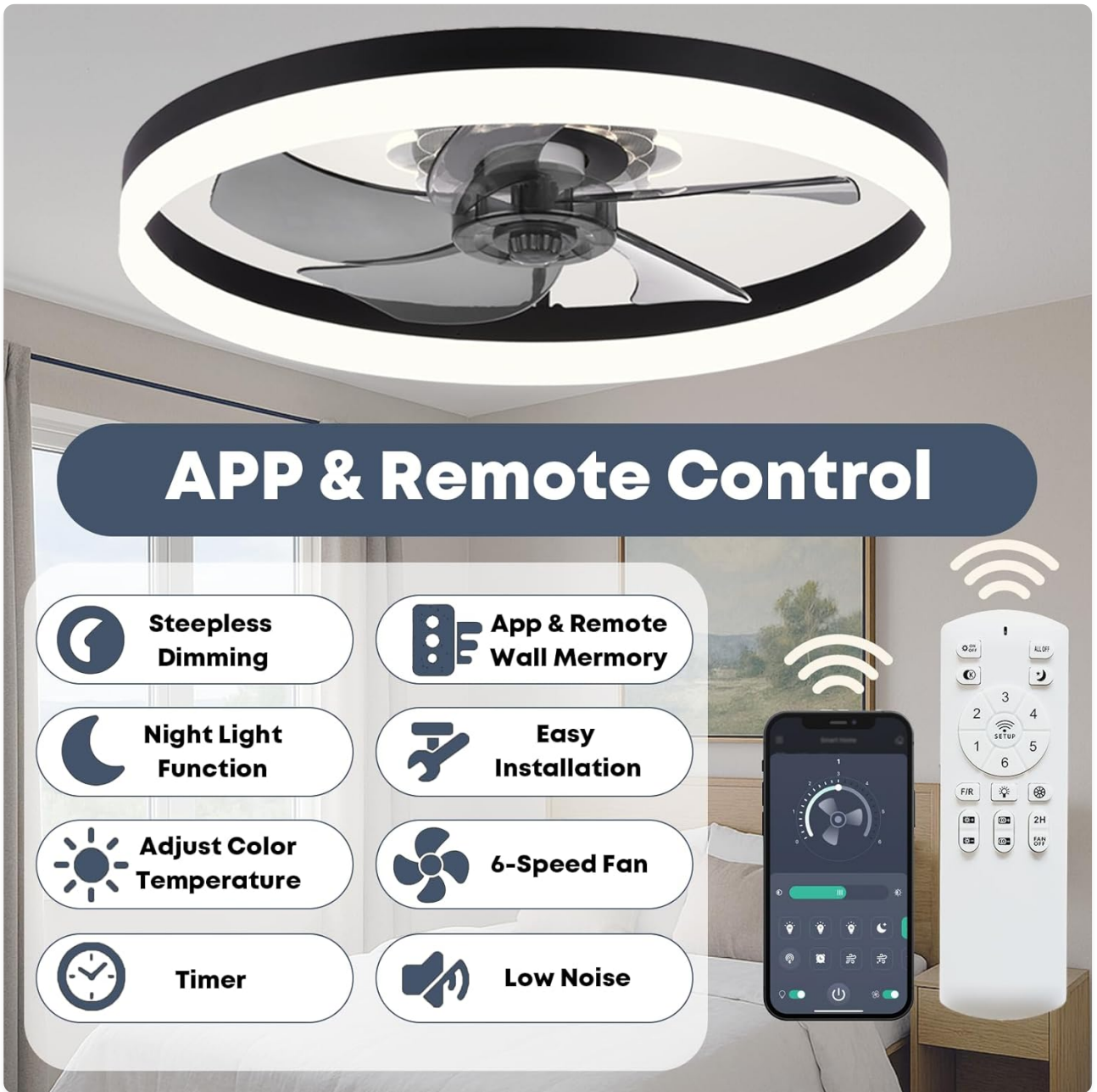
Figure 4: Stepless dimming and adjustable color temperature for the main light.