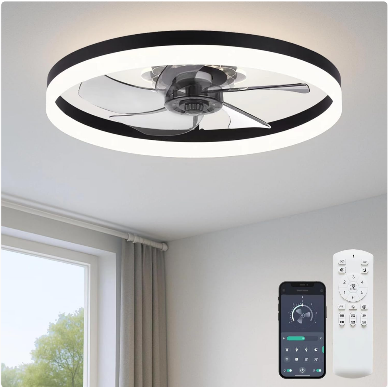
Figure 1: Fszdorj 20-inch Ceiling Fan with Light, showcasing the fan unit, remote control, and mobile app interface.