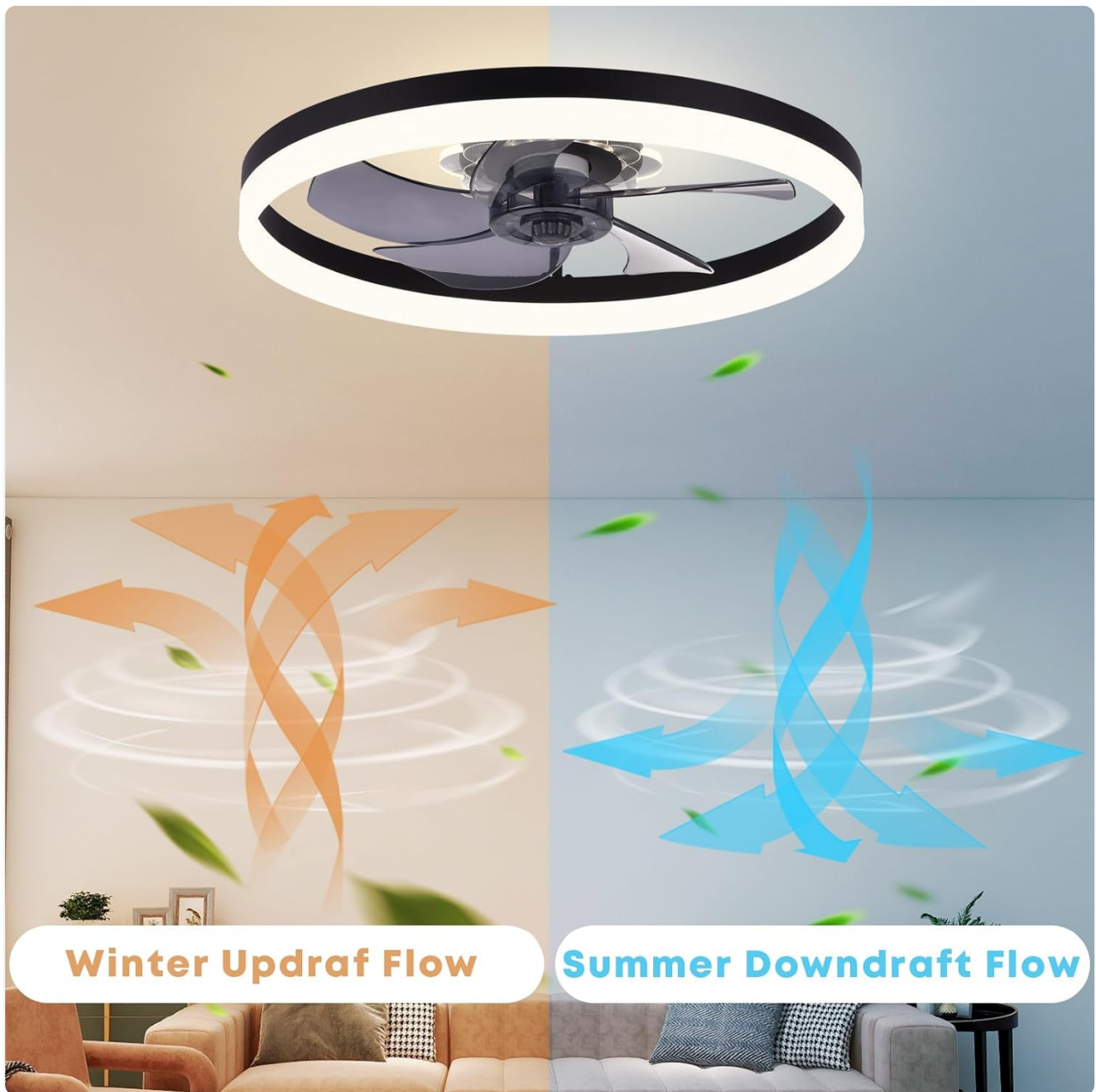
Figure 8: Visual representation of key product specifications.