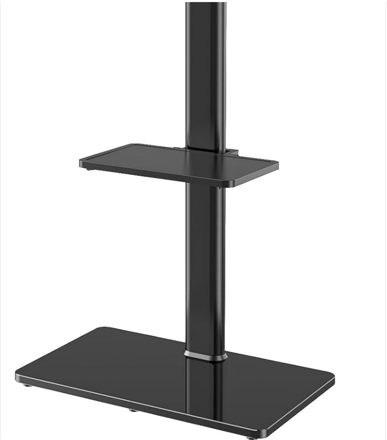
Figure 1: Hemudu Universal Floor TV Stand with Mount, showcasing its sleek design and integrated shelves.