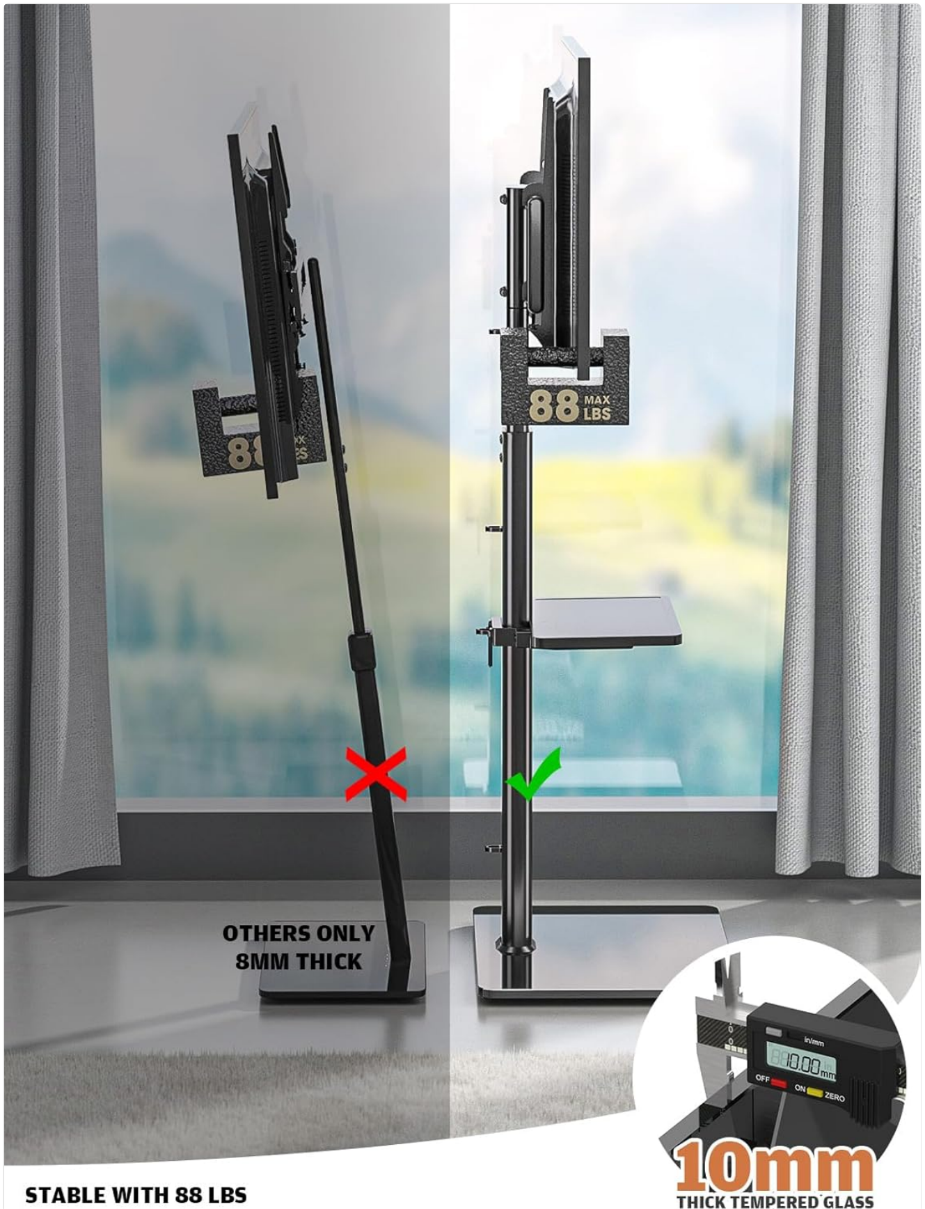
Figure 2: Illustrates the robust 10mm thick tempered glass base, ensuring stability for the TV stand.