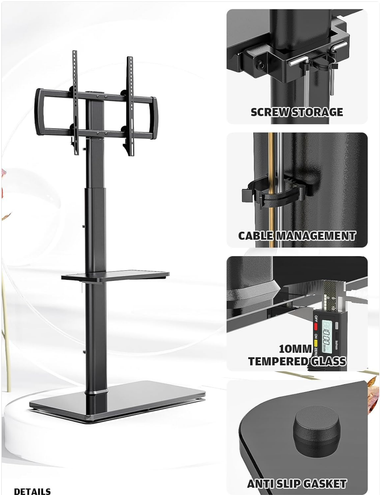
Figure 4: Close-up of the cable management clips, designed to keep wires organized and out of sight.