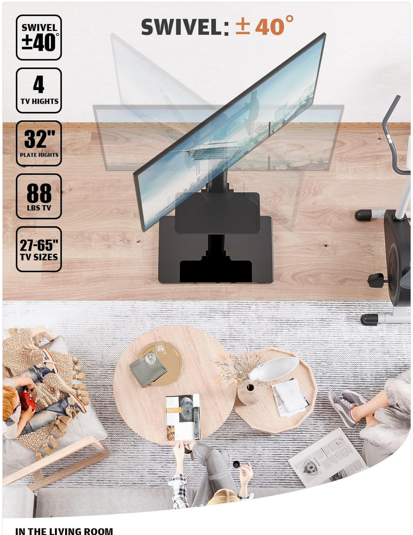
Figure 5: Demonstrates the \pm 40 degree swivel function, allowing for flexible viewing angles.

The TV mount allows for a swivel range of \pm 40 degrees. Gently push the sides of your TV to adjust the viewing angle to your preference. This feature is ideal for adapting to different seating positions or reducing glare.