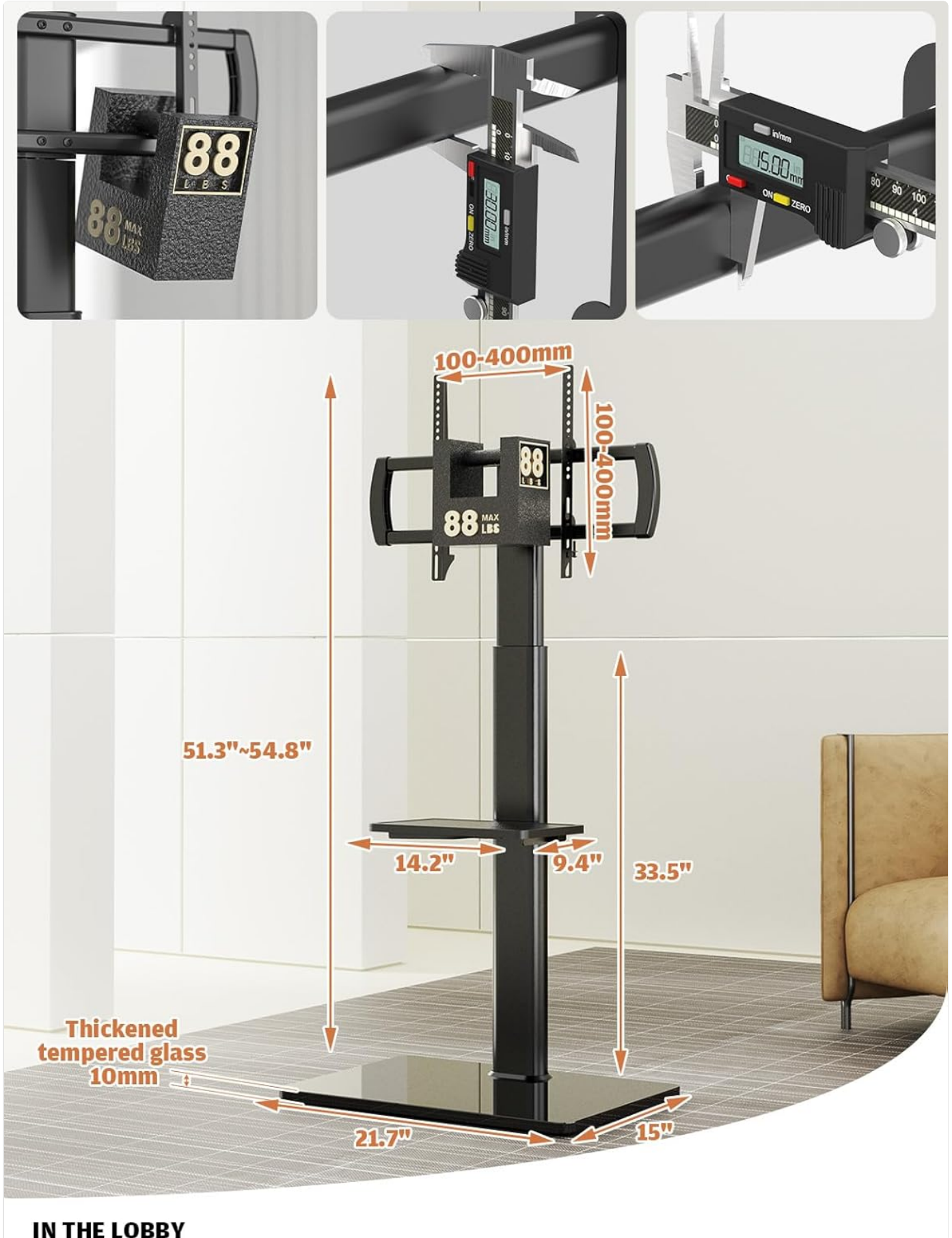
Figure 6: Shows the four distinct height levels for adjusting the TV's position on the stand.

The TV mount offers 4 levels of height adjustment . To change the TV height, loosen the securing bolts on the main support pillar, slide the mount to the desired level, and re-tighten the bolts firmly. This allows you to optimize the TV's position for comfortable viewing.